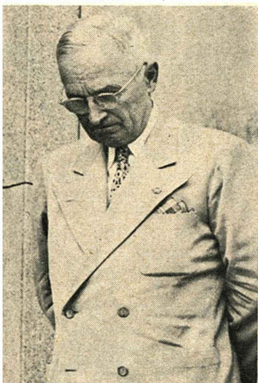
A pensive Pres. Truman: no Munich

Knots of legislators gathered on the floor or in cloakrooms for whispered conversations. Crowds formed around news tickers. A frequent comment: "Truman wouldn't go to Munich."