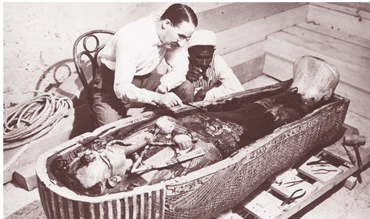
Howard Carter examined the sarcophagus