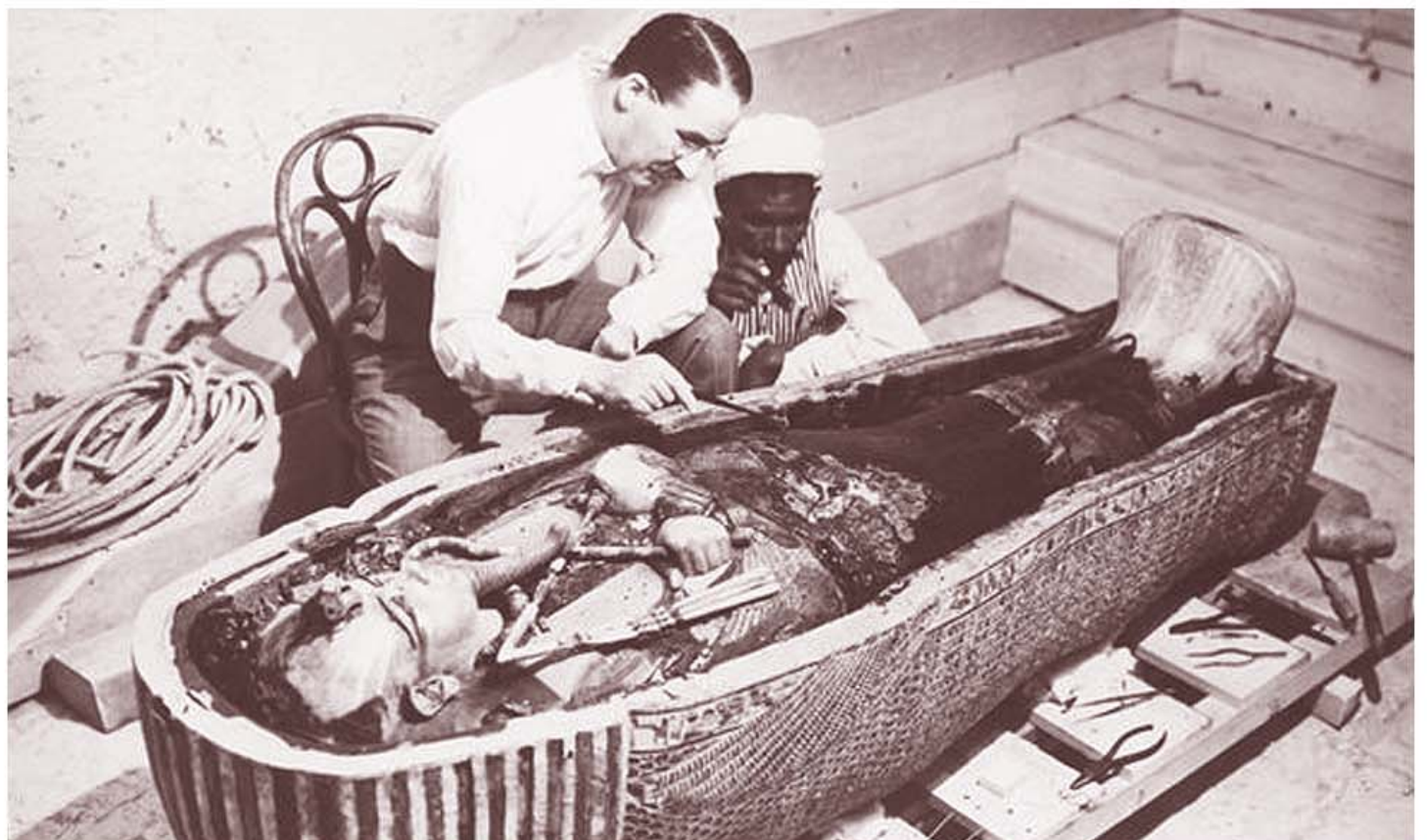
Howard Carter examined the sarcophagus