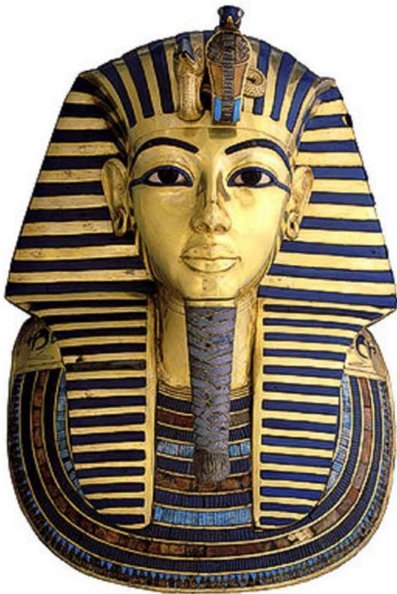
The death mask of :the Boy King"

"There was a stool of ebony inlaid with ivory, with the most delicately carved duck's feet; also a child's stool of fine workmanship. Beneath one of the couches was the State Throne of King Tutankhamen, probably one of the most beautiful objects of art ever discovered. There was also a heavily gilt chair, with portraits of the King and Queen, the whole encrusted with turquoise, cornelian, lapis, and other semi-precious stones.