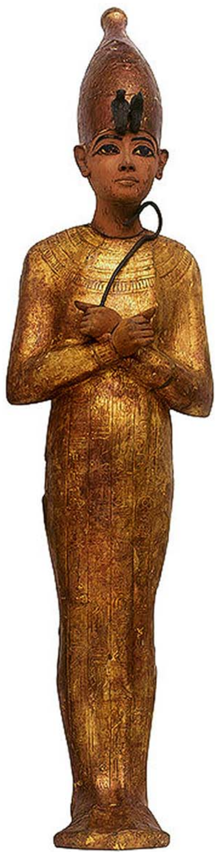
The Shawabti of Tutankhamun

"One of the finest objects is the chair or throne of the King. It is in wood. The back panel is of surpassing beauty, and portrays the King and his Queen protected by Aton rays. All the figures, etc., in this scene are built up by means of semi-