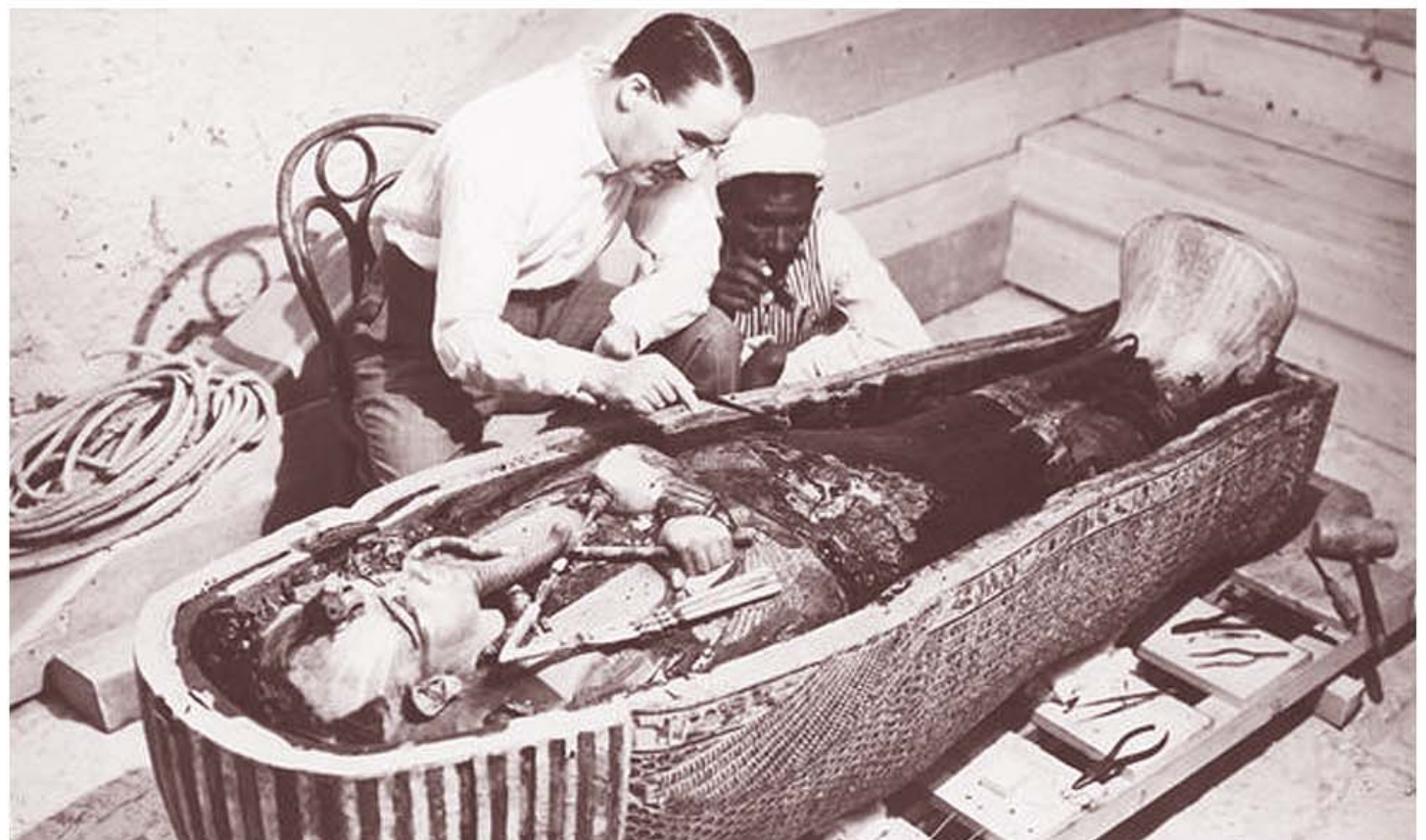
Howard Carter examined the sarcophagus