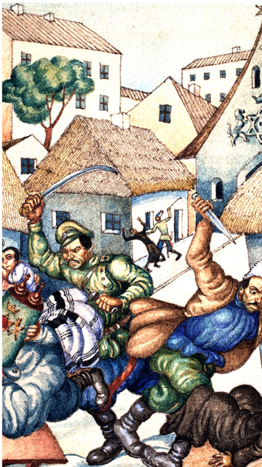
Arthur Szyk (1923)

"Should any of those murderers blasphemously allege religion as a pretext, we wish to be the first to brand them as lying hypocrites, enemies of Christ and blots on the human race."