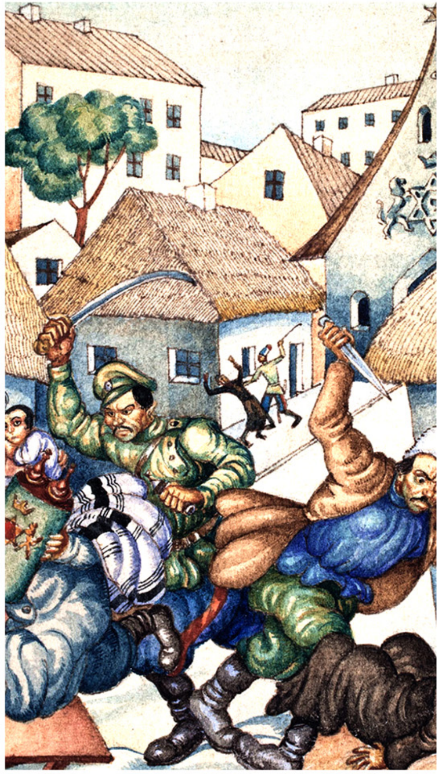
Arthur Szyk (1923)

"Should any of those murderers blasphemously allege religion as a pretext, we wish to be the first to brand them as lying hypocrites, enemies of Christ and blots on the human race."