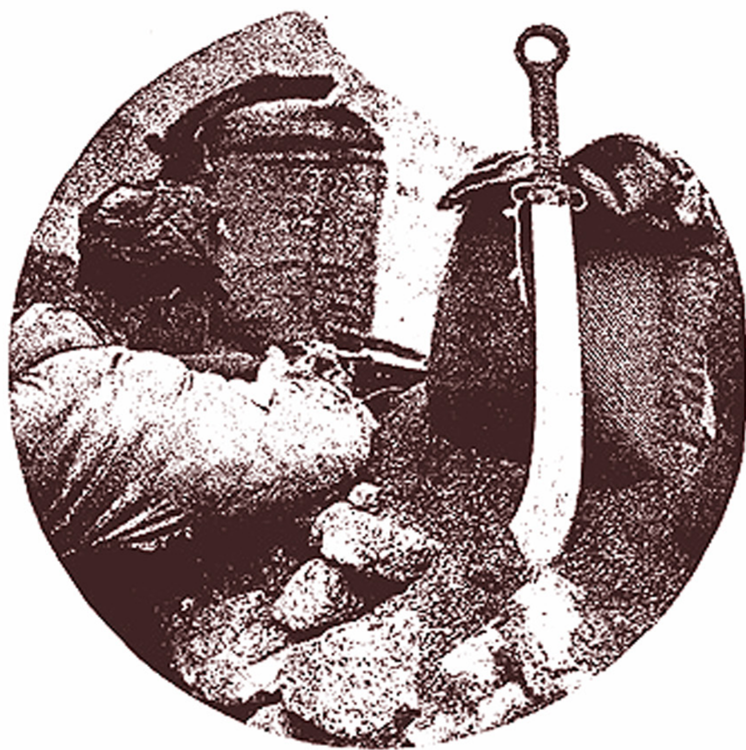
In Case of Need