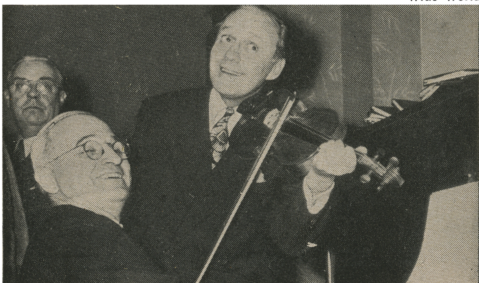
JACK BENNY AND HARRY TRUMAN SERENADE D.C. PRESS CLUB.

edy," he says. "They laugh at me and the other characters on the show because they know us, and when a situation comes along they have a pretty good idea ahead of time how we'll act in it. For instance, on one show a stickup man pulls a gun on me and says: 'Your money or your life.' I don't answer for a long time, and the audience, knowing what a fantastically tight guy I am, starts laughing even before I explain to the crook that 'I'm thinking it over.'"