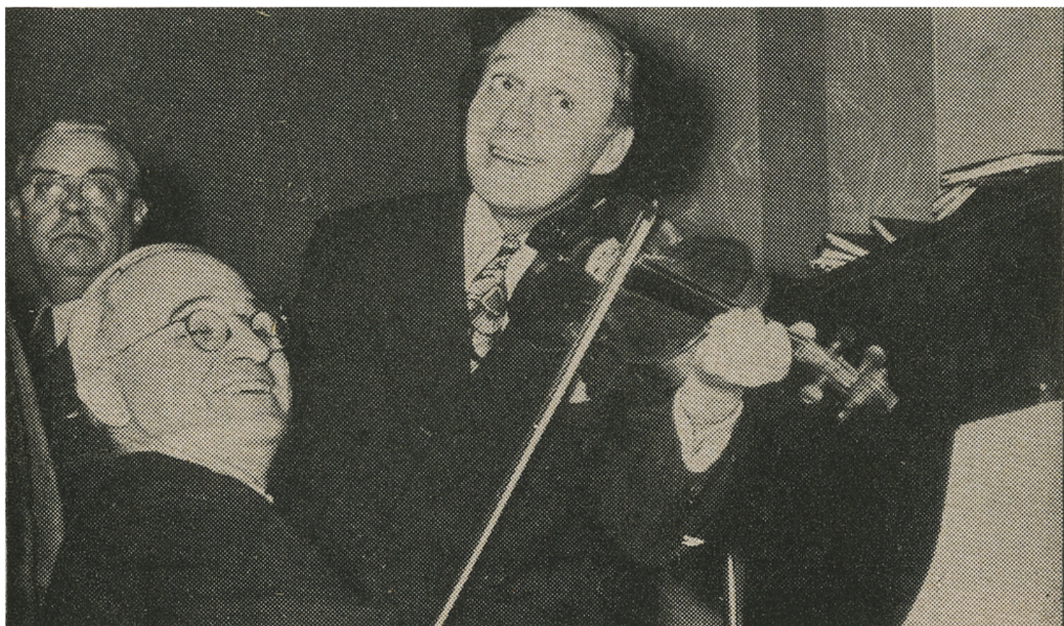
JACK BENNY AND HARRY TRUMAN SERENADE D.C. PRESS CLUB.

edy," he says. "They laugh at me and the other characters on the show because they know us, and when a situation comes along they have a pretty good idea ahead of time how we'll act in it. For instance, on one show a stickup man pulls a gun on me and says: 'Your money or your life.' I don't answer for a long time, and the audience, knowing what a fantastically tight guy I am, starts laughing even before I explain to the crook that 'I'm thinking it over.'"