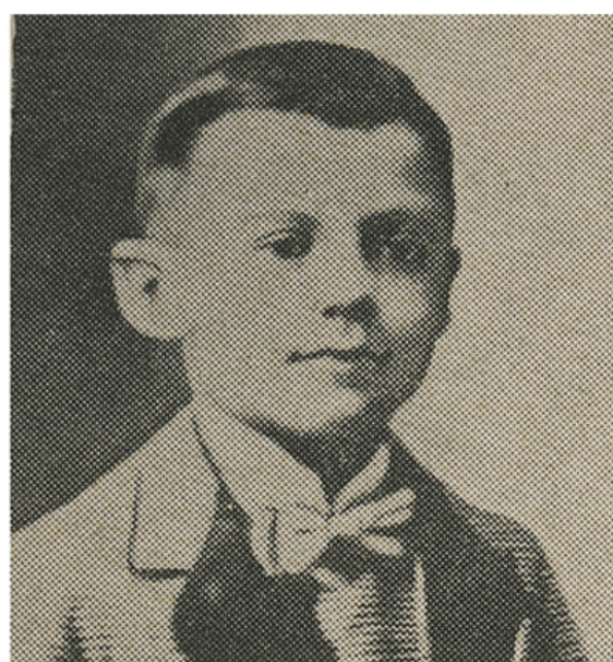
JACK BENNY AT 4