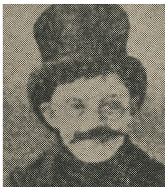
HE PLAY-ACTS AT 6