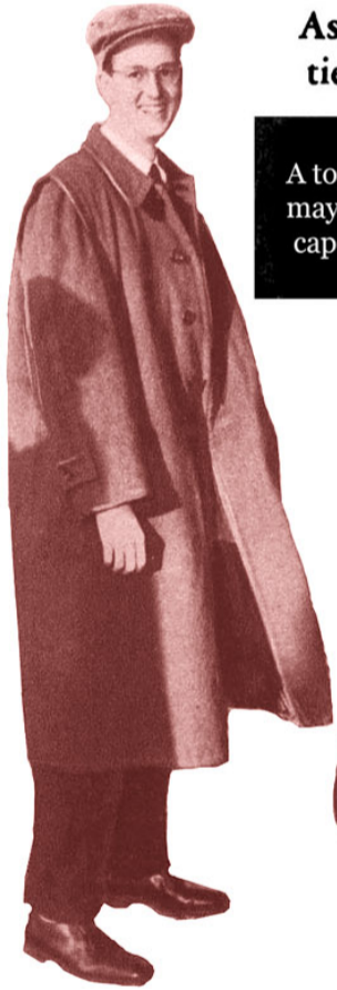
A topcoat of Loden cloth tailored so that it may be worn in conventional manner or as cape. Small shape patterned tweed cap.

As seen by our candid camera... current trends in clothes for on or off campus activities... reflecting some of the styles that have matriculated with better dressed young men.