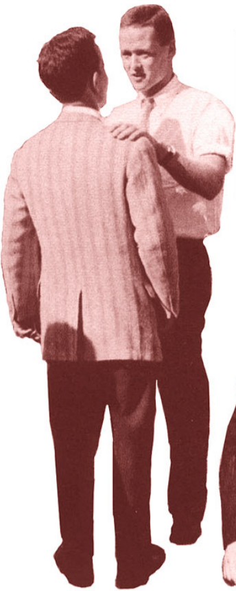
Left: Black-grey flannel suit; Tattersall check vest; short point collar; sporting motif tie. Right: Twill weaves Shetland sport coat, oatmeal tan shade in three-button model; black-grey flannel slacks candy-striped shirt with button-down collar; Paisley-patterned tie.