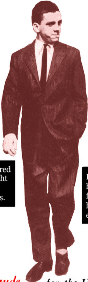
Black-grey flannel suit with white hairline stripes... three-button model featuring natural shoulders, straight hanging body, flapped pockets, moderately narrow lapels; knit tie, narrow.