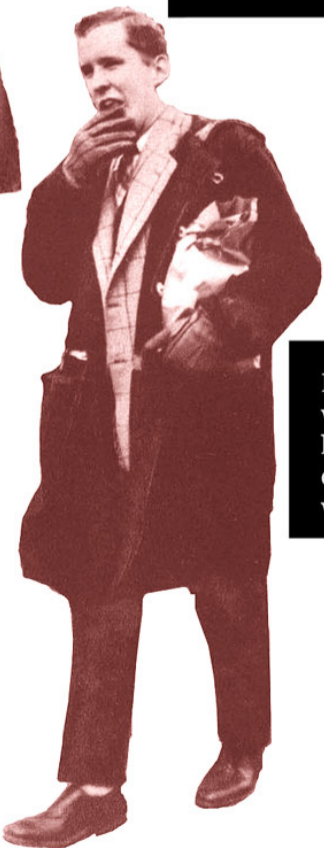
Protective duffel coat in dark blue with hood, wooden toggels and hemp loops. Underneath, window-pane check sport jacket; Tartan patterned wool tie.