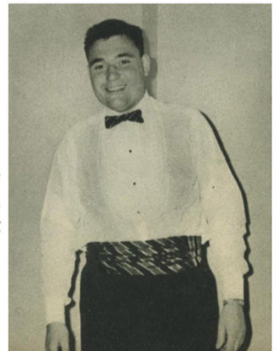
The striped rep matching tie and cummerbund . . . the small bosomed, very lightweight dress shirt for dinner jackets.