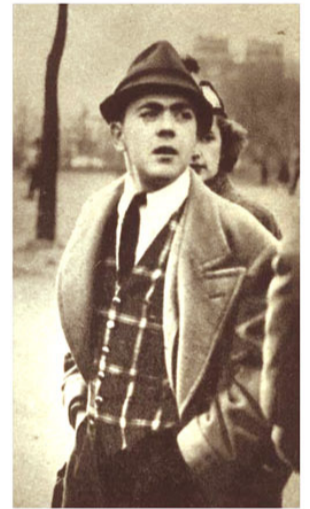
The Tyrolean-shaped small brimmed hat . . . The Tartan odd vest trimmed with gold color metal buttons.