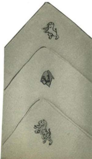
Miniature mascots (shown here: Yale Bull, Dartmouth Indian, Princeton Tiger) embroidered in school colors on white linen handkerchiefs by International Handkerchief.