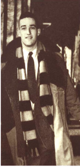
The wool six-foot muffer with fringed ends, horizontally striped in many school colors.