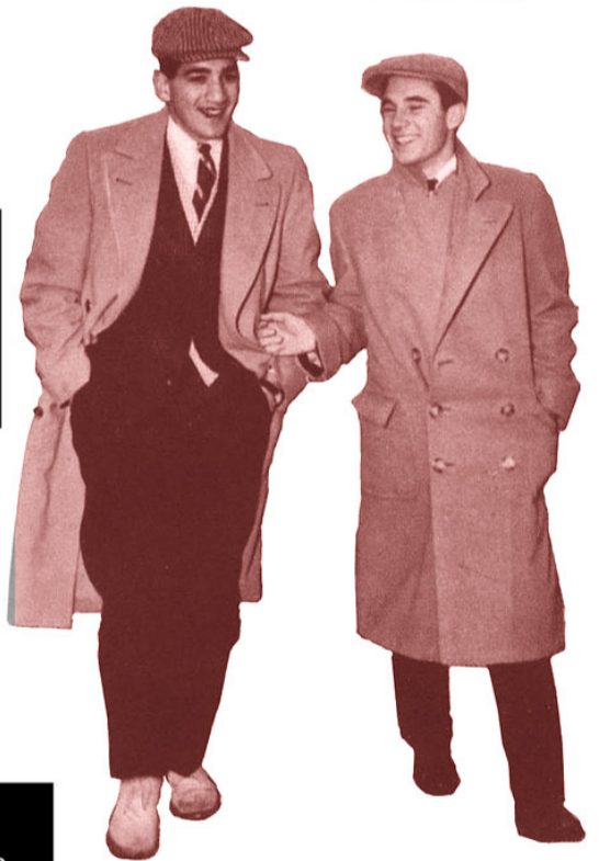
Double-breasted camel hair polo coat in natural tan shade. Caps in sport coat fabrics... both in preferred small shape. Tattersall vest; striped rep tie.