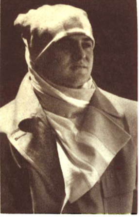
From Jaeger of London . . . the new wool muffer-toque. Can be worn stocking cap style, as shown, or conventionally around the neck.

ACCESSORIES . . . some add a touch of color . . . others combine functionalism with good looks. Already accepted, or new this season . . . all in good taste.