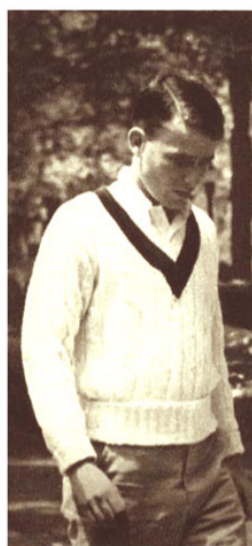
One version of the cable-stitched tennis type sweater in white with contrasting multi-color neck treatment.