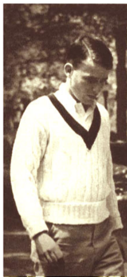
One version of the cable-stitched tennis type sweater in white with contrasting multi-color neck treatment.