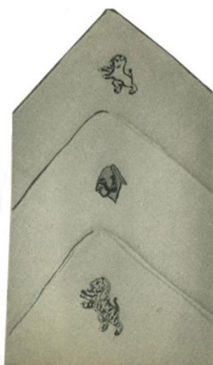
Miniature mascots (shown here: Yale Bull, Dartmouth Indian, Princeton Tiger) embroidered in school colors on white linen handkerchiefs by International Handkerchief.