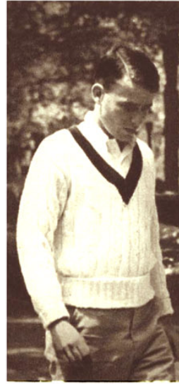
One version of the cable-stitched tennis type sweater in white with contrasting multi-color neck treatment.