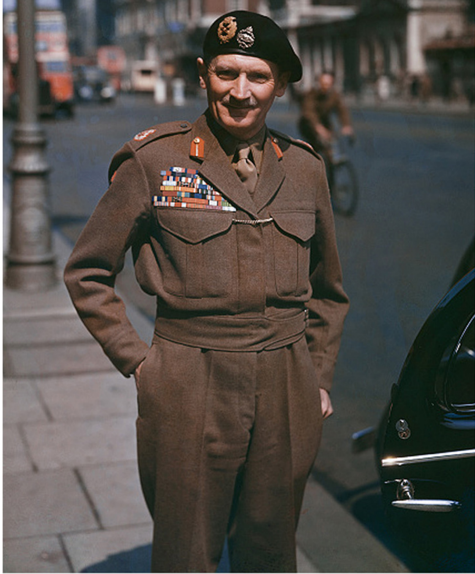
Marshal Sir Bernard Law Montgomery, best known in the clothing world for his famous beret, wears a British battle jacket. The British version is slightly shorter at the waist than ours because the uniform is worn with high trousers and suspenders. The trousers of our troops are designed to be worn with a belt

A similar jacket had been worn for some time by the R.A.F. When our 8th Air Force boys arrived in England, they liked the jacket the English pilots were wearing and promptly went to English tailors and had themselves jacketed. It wasn't regulation. But who was to argue with the golden boys if they wanted to shoot down enemy planes wearing a well-tailored jacket—or star-spangled tights for that matter?