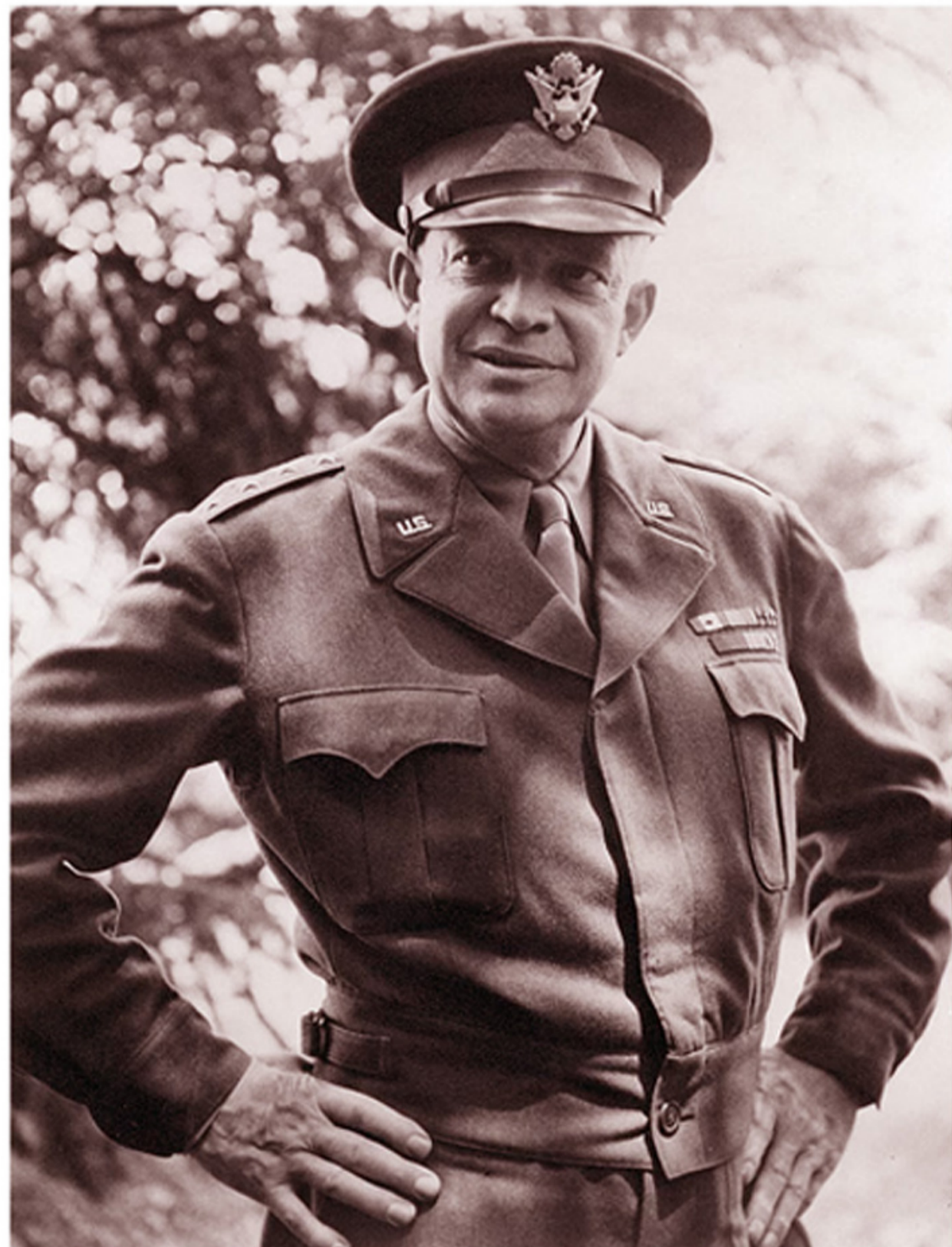
General Ike Eisenhower is responsible for putting our fighting men in Europe in battle jackets, has been wearing this model since the early part of this year. The general's jacket is buttoned at the bottom, his own idea. The one the boys will get is like this except it has an extension tab at the waistline

Each war seems to produce one article of wearing apparel which finds a permanent place in the wardrobe. In the first World War, it was the trench type of raincoat. Now comes the battle jacket. When the Quartermaster General's office announced last spring that our boys would be issued a new battle jacket for the European Theater of Operations and manufacturers took one look at it, they whooped with joy. Already it promises to become a civilian avalanche.