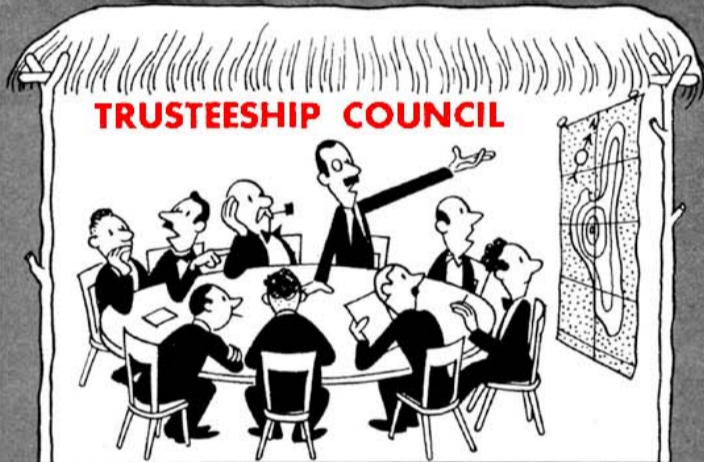
This body is charged with promoting the educational, social and economic progress of the colonial areas of the world.