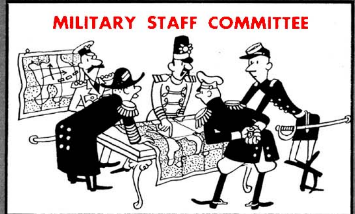
This group—the Chiefs of Staff of the U. S., Britain, Russia, France and China—will direct armed action against any future aggressors.