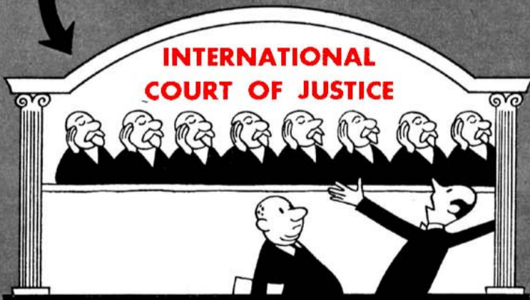
This permanent court will decide legal disputes between countries. Members of the United Nations are pledged to follow its rulings.