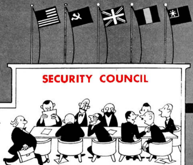
The Council is the heart of the security organization. Its 11 members have the job, among other things, of making plans to halt aggressors.