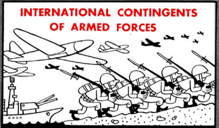
Each nation promises to have a quota of troops ready for future emergencies and to make them available whenever the need arises.