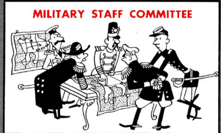
This group—the Chiefs of Staff of the U. S., Britain, Russia, France and China—will direct armed action against any future aggressors.