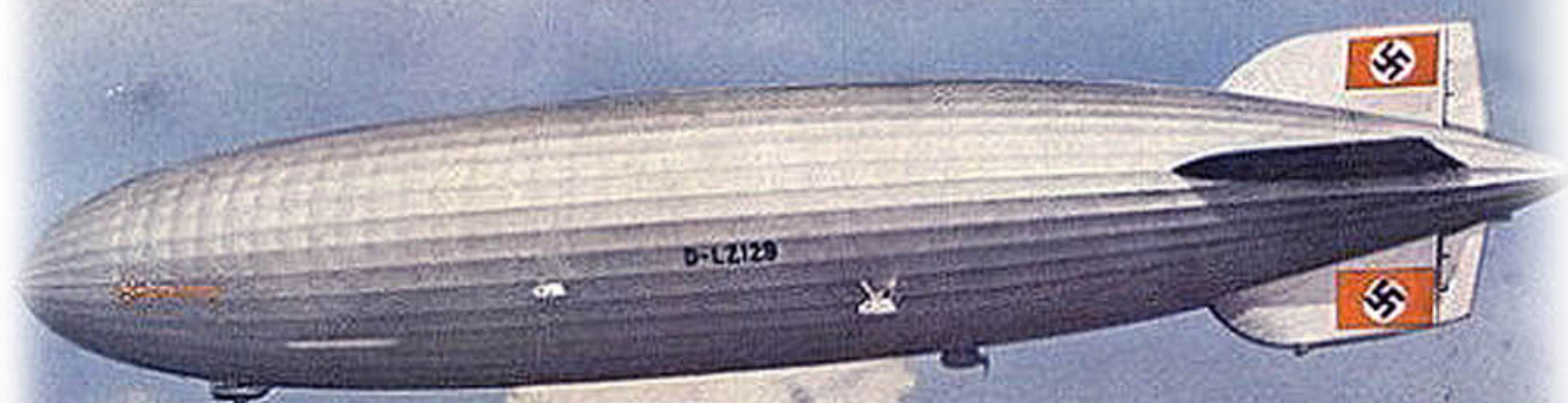
THE ILL-FATED GERMAN ZEPPELIN HINDENBURG, ONCE QUEEN OF THE AIR BUT DEMOLISHED MAY 6.