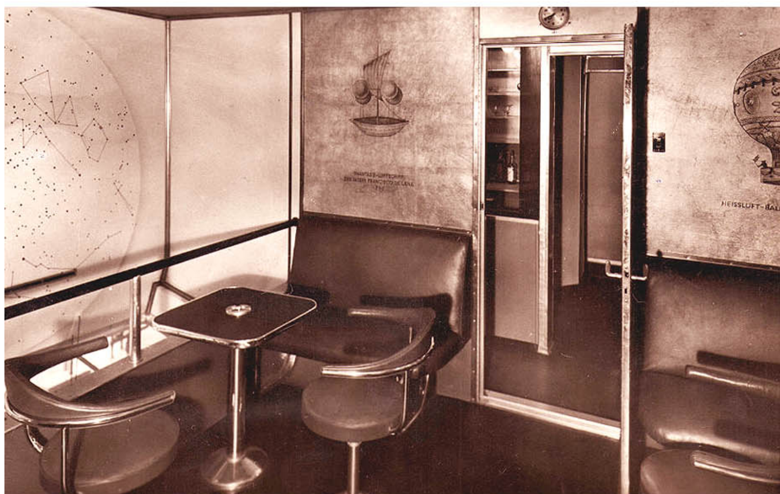
CORNER OF SMOKING ROOM ABOARD THE HINDENBURG

From the moment of going aboard the great flexibility of