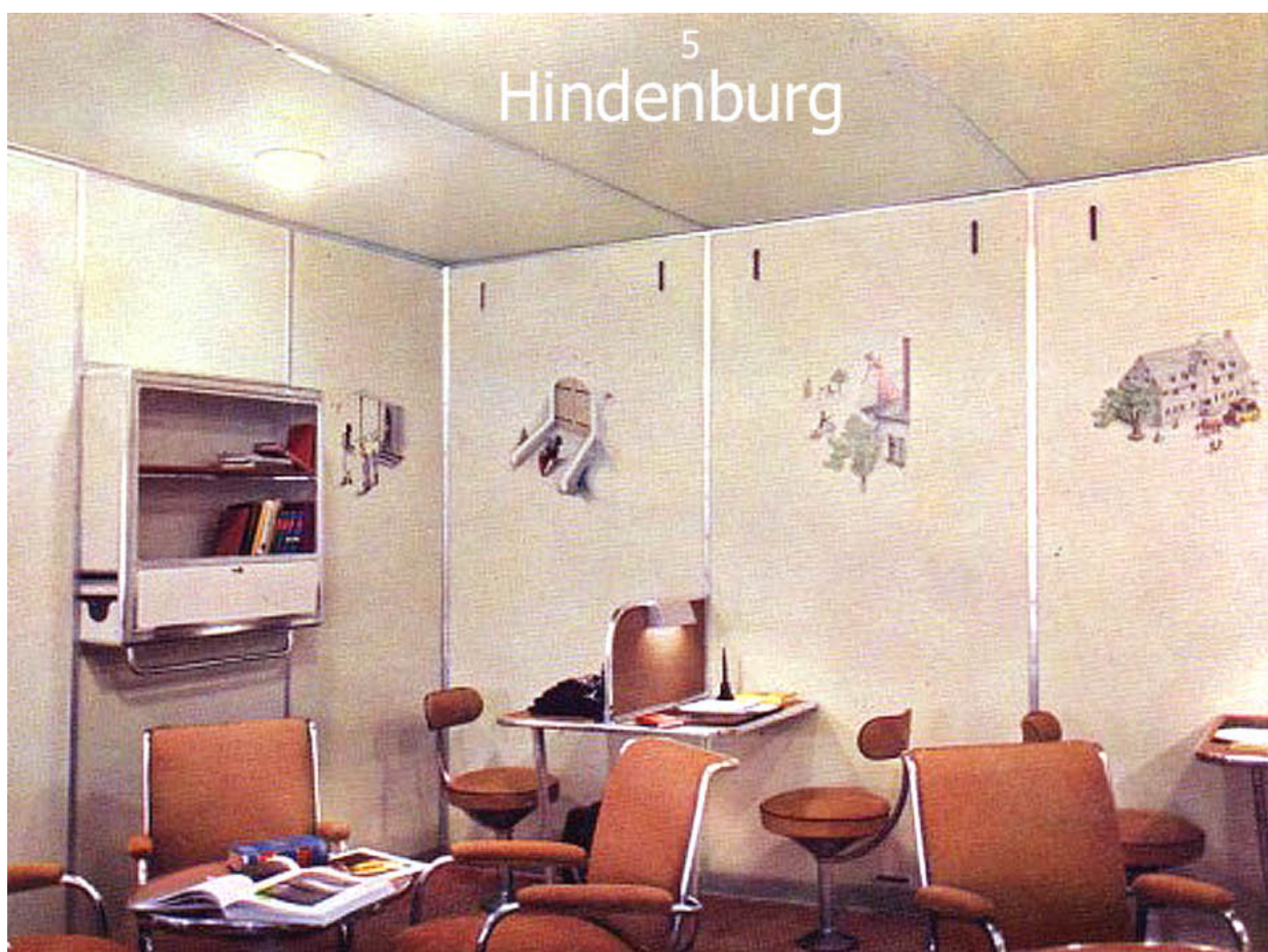
THE READING AND WRITING ROOM ON THE ZEPPELIN HINDENBURG