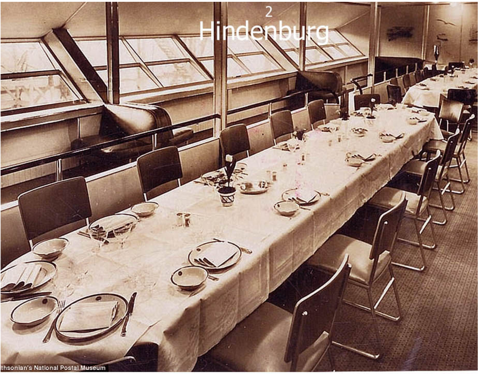
Above: THE ZEPPELIN HINDENBURG'S DINING SALON MADE UP FOR THE CAPTAIN'S DINNER. Below: THE DINING ROOM AS IT ORDINARILY WAS. NOTE THE LONG WINDOWS PLACED AT AN ANGLE THROUGH WHICH PASSENGERS WERE ABLE TO SEE "OUT, UP, AND DOWN"