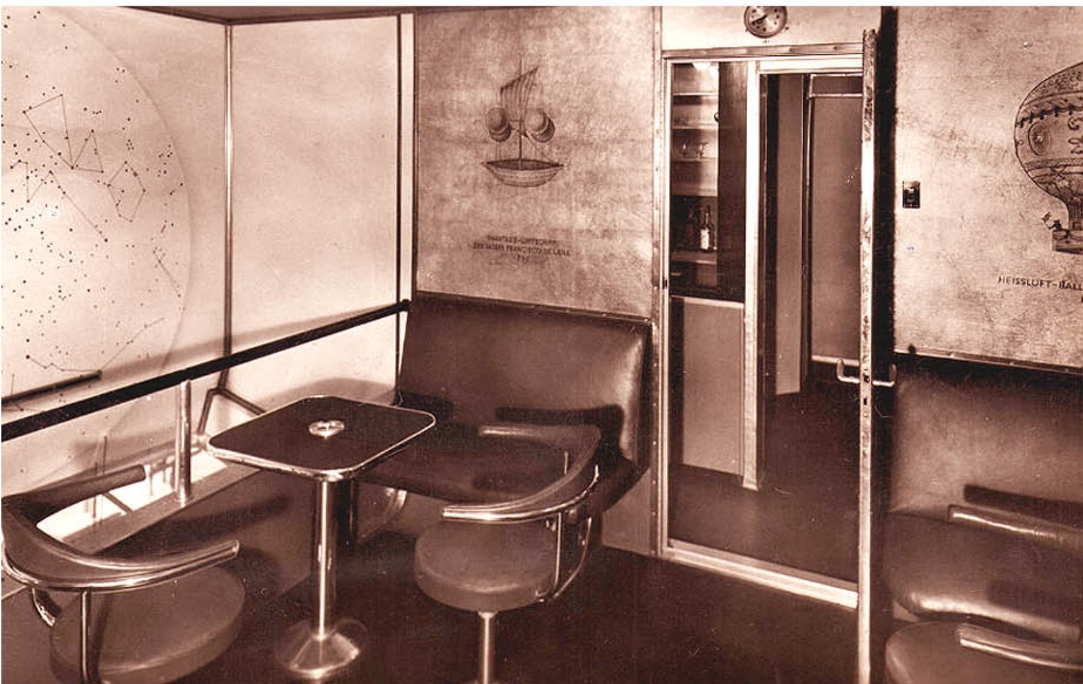
CORNER OF SMOKING ROOM ABOARD THE HINDENBURG

From the moment of going aboard the great flexibility of