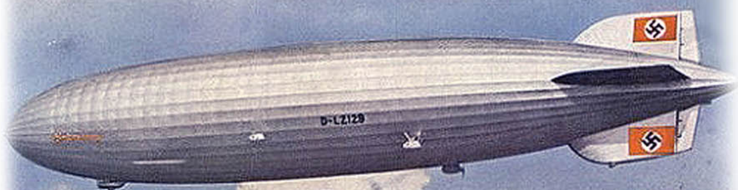
THE ILL-FATED GERMAN ZEPPELIN HINDENBURG, ONCE QUEEN OF THE AIR BUT DEMOLISHED MAY 6.