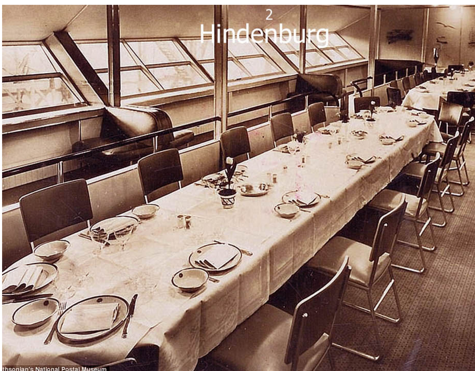
Above: THE ZEPPELIN HINDENBURG'S DINING SALON MADE UP FOR THE CAPTAIN'S DINNER. Below: THE DINING ROOM AS IT ORDINARILY WAS. NOTE THE LONG WINDOWS PLACED AT AN ANGLE THROUGH WHICH PASSENGERS WERE ABLE TO SEE "OUT, UP, AND DOWN"