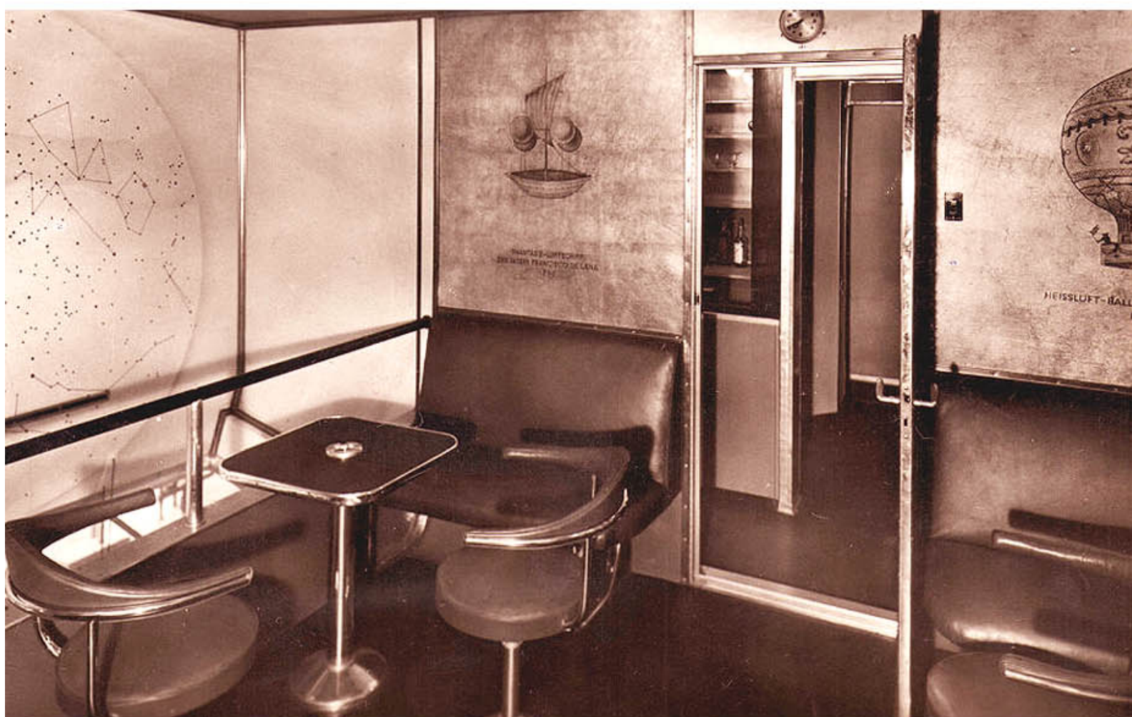
CORNER OF SMOKING ROOM ABOARD THE HINDENBURG

From the moment of going aboard the great flexibility of