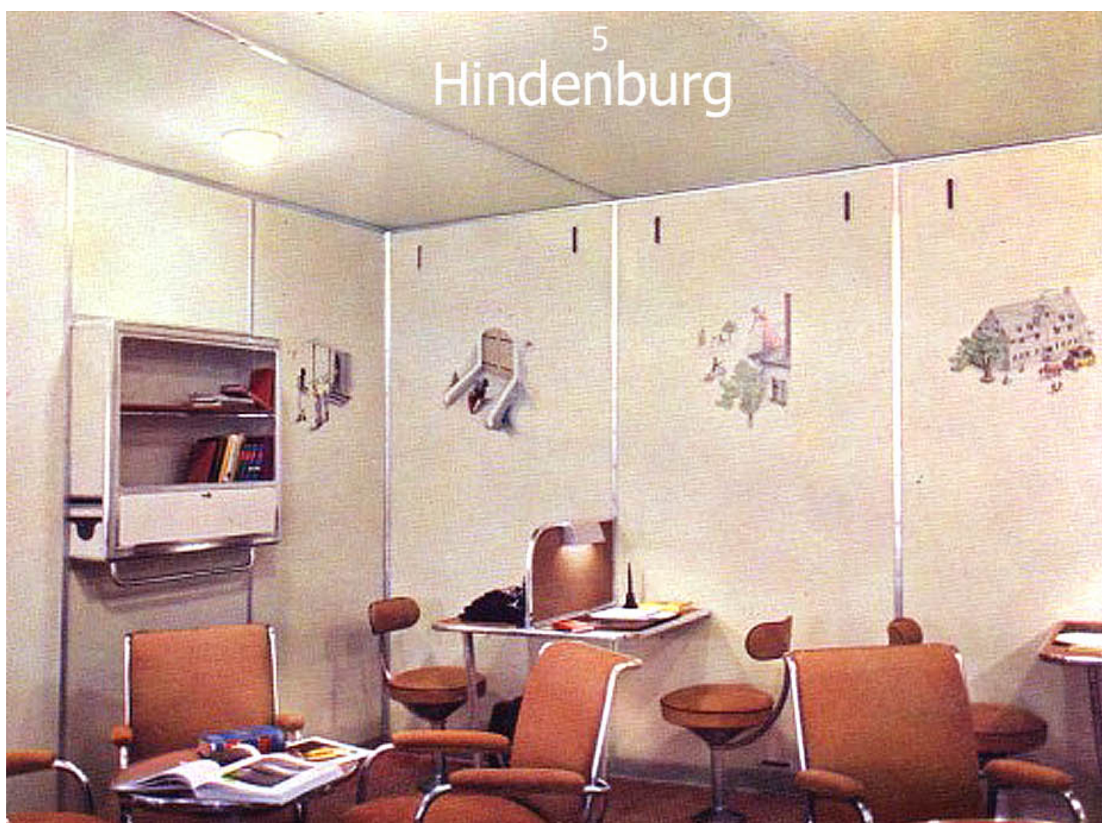
THE READING AND WRITING ROOM ON THE ZEPPELIN HINDENBURG