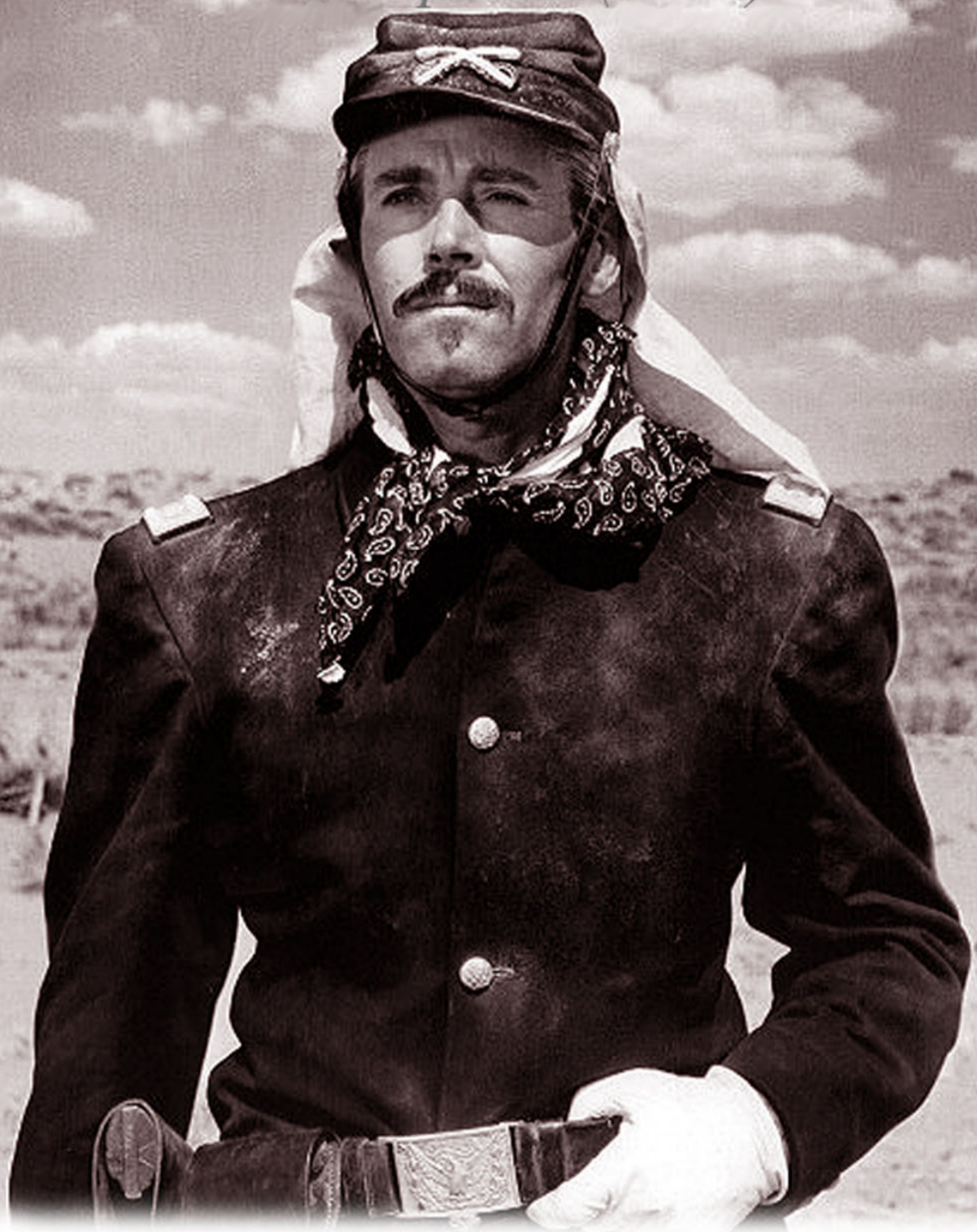
Fort Apache (1948)

So as soon as he found the right play, Fonda left the easy money of Hollywood for the hard work of Broadway. The play was the famous Mister Roberts , in which he had the role of an idealistic young lieutenant aboard a Navy supply ship in the Pacific. It was a great show and Fonda gave a great performance,