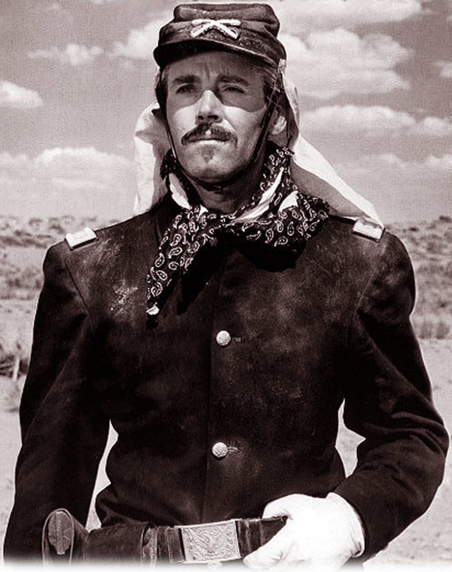
Fort Apache (1948)

So as soon as he found the right play, Fonda left the easy money of Hollywood for the hard work of Broadway. The play was the famous Mister Roberts , in which he had the role of an idealistic young lieutenant aboard a Navy supply ship in the Pacific. It was a great show and Fonda gave a great performance,