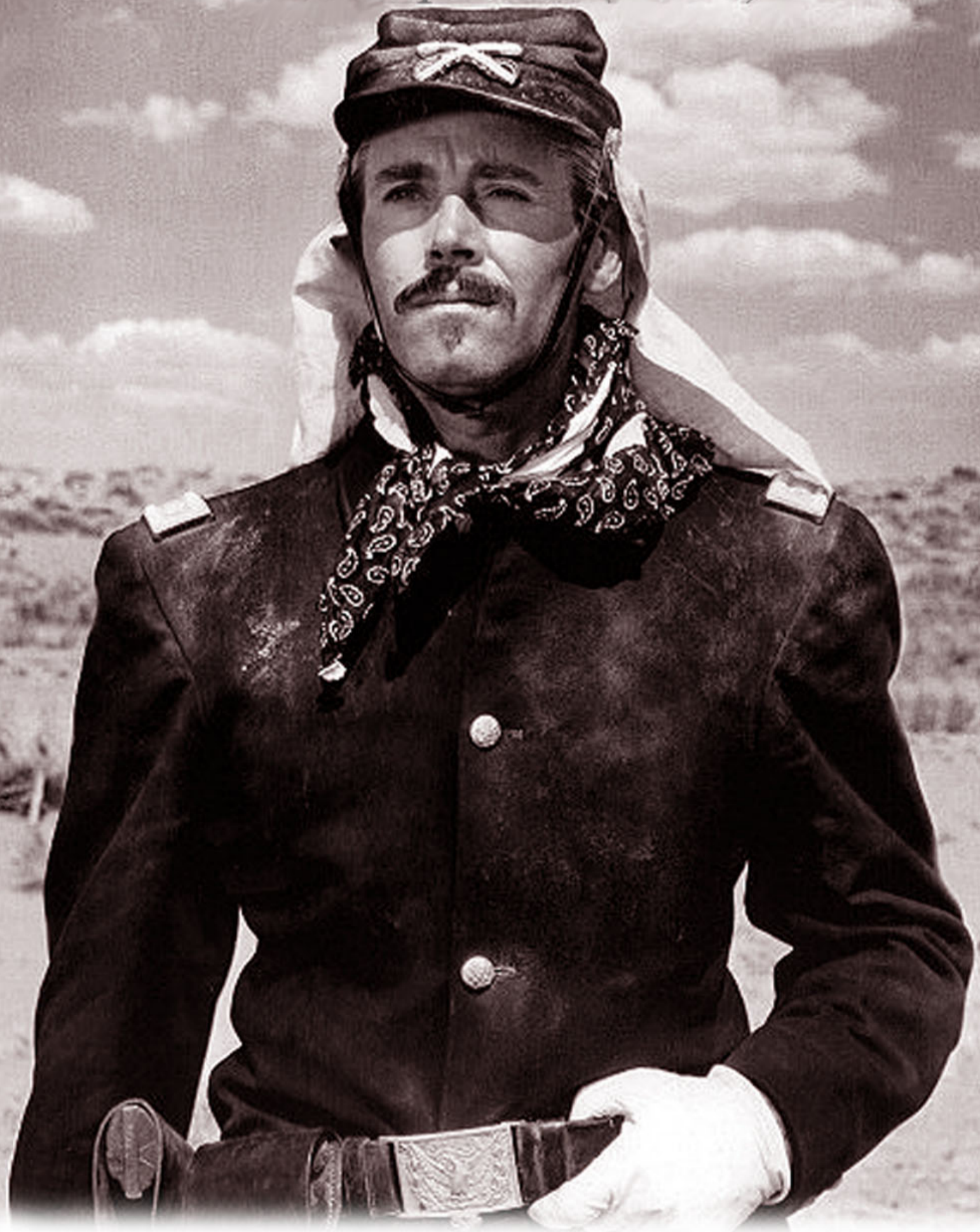
Fort Apache (1948)

So as soon as he found the right play, Fonda left the easy money of Hollywood for the hard work of Broadway. The play was the famous Mister Roberts , in which he had the role of an idealistic young lieutenant aboard a Navy supply ship in the Pacific. It was a great show and Fonda gave a great performance,