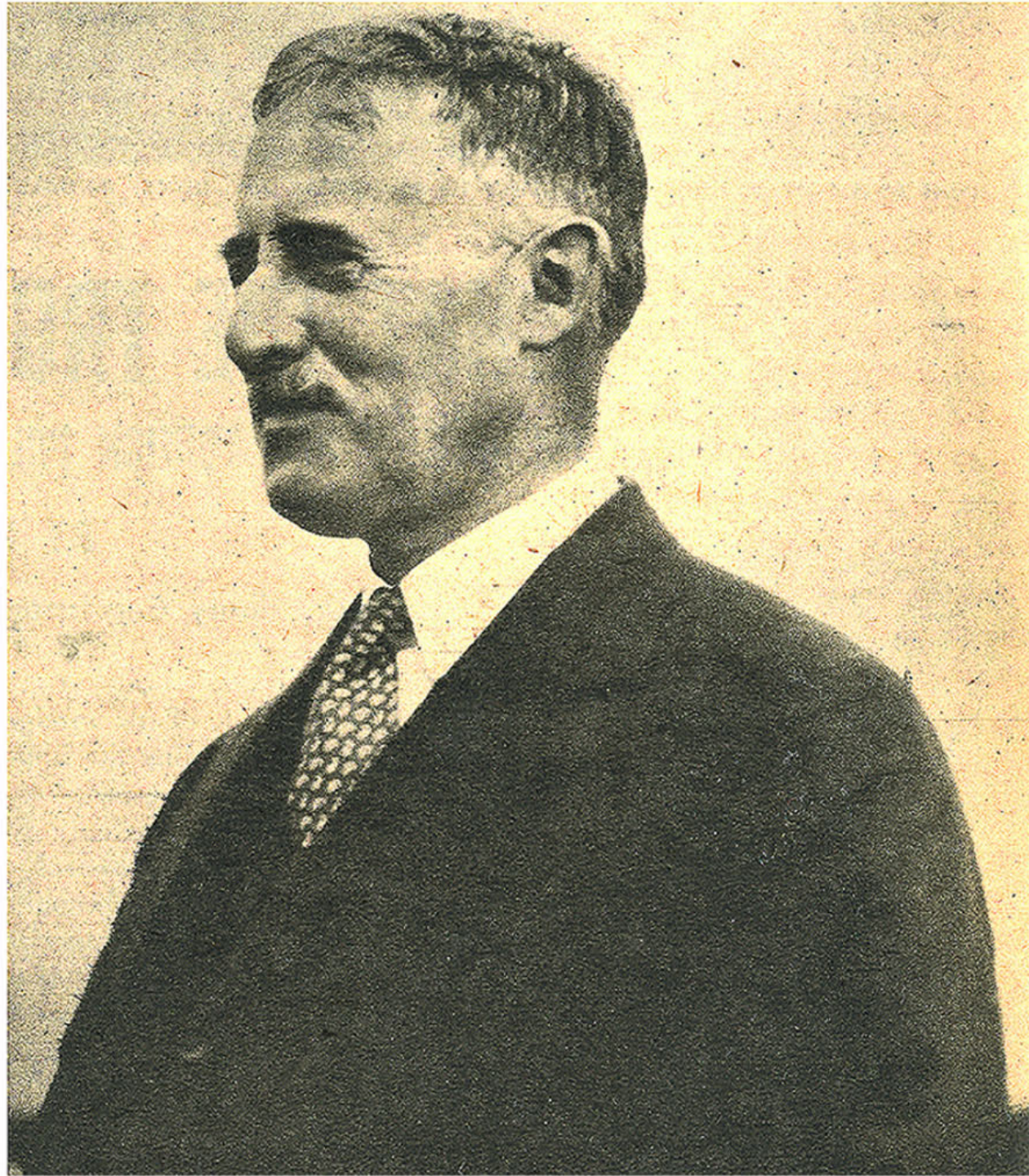
Henry L. Stimson, Hoover's Secretary of State; Secretary of War during Franklin Roosevelt's last term, urged England to join U. S. in checking Jap aggression. British refused.

A British statesman in London said to me, "The trouble with this business of stopping Communism is that you inevitably find yourself mixed up with