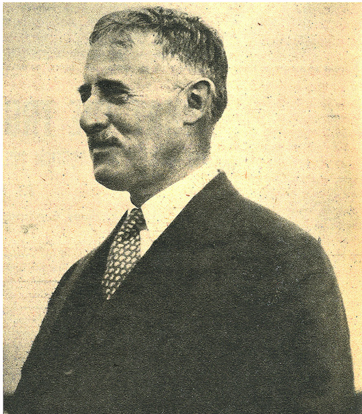
Henry L. Stimson, Hoover's Secretary of State; Secretary of War during Franklin Roosevelt's last term, urged England to join U. S. in checking Jap aggression. British refused.

A British statesman in London said to me, "The trouble with this business of stopping Communism is that you inevitably find yourself mixed up with