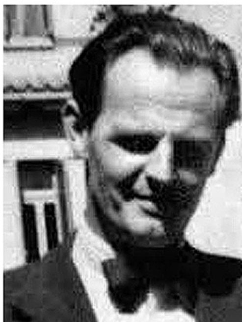
Donald D. MacLean

Background: The disappearance of two British foreign service men, D. D. MacLean and Guy Burgess, upset the State Dept. Both men had access to confidential U. S.-British diplomatic files, although not to top secrets. Even if they hadn't gone over to Russia, their mysterious disappearance on a "holiday" shook official U. S. confidence in their eligibility to handle high policy papers of the two Allies.