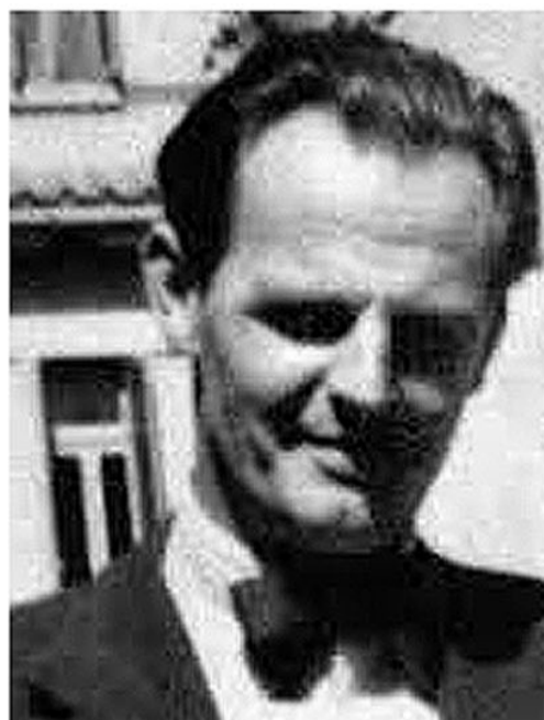
Donald D. MacLean

Background: The disappearance of two British foreign service men, D. D. MacLean and Guy Burgess, upset the State Dept. Both men had access to confidential U. S.-British diplomatic files, although not to top secrets. Even if they hadn't gone over to Russia, their mysterious disappearance on a "holiday" shook official U. S. confidence in their eligibility to handle high policy papers of the two Allies.