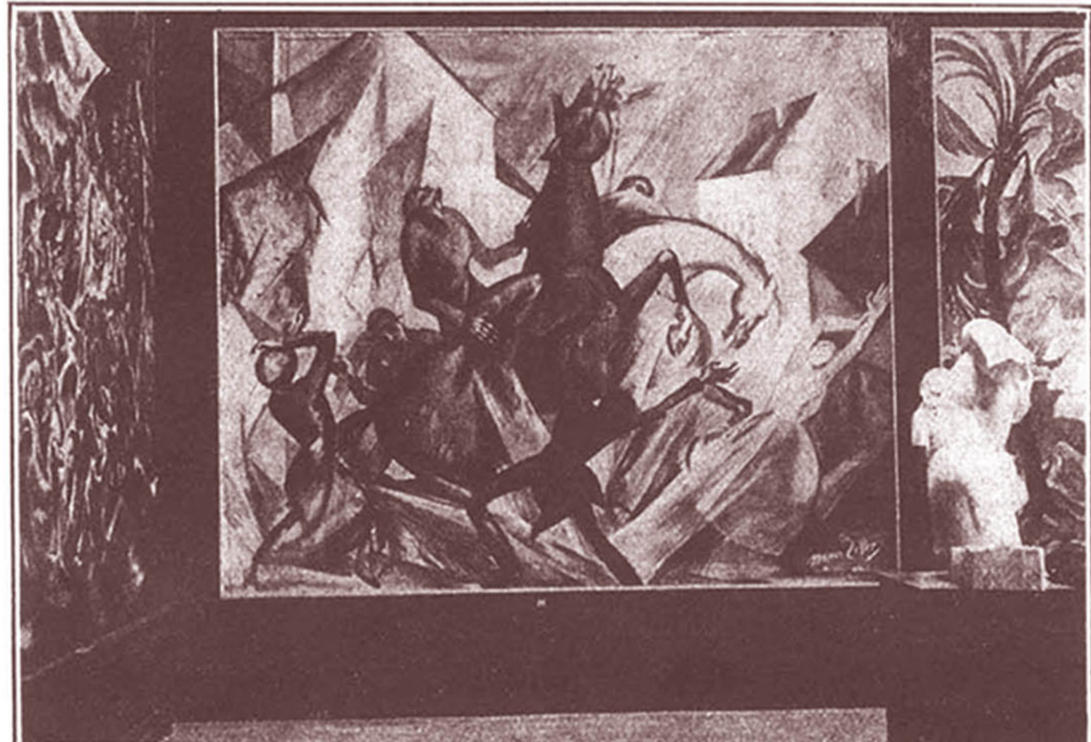
A REVOLUTIONARY CORNER OF THE BERLIN "SECESSION" Magnus Zeller's "Collapse" seems appropriately named, as it is a somewhat cubistic rendition of the revolution.

"The Republic, through the collapse of the old system, has inherited a number of important and constructive duties in the domain of art. The aim of the cultivation of art must be to recognize the fact that art is not a luxury nor an exceptional circumstance, but that it must penetrate the people's daily life; that it shall not be for the few but within reach