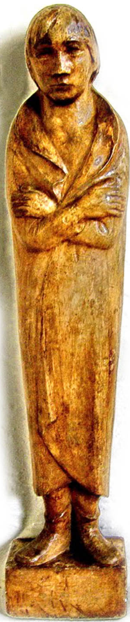
Figure by Ernst Barlach

A RT and artists have not remained untouched by the revolution in Germany. Art has influenced the revolution, more perhaps than the revolution has influenced art; for pacifistic and insurrectionist canvases grew to maturity in the quiet of many a studio in the days before November. The revolution has merely brought these to light. In the Spring exhibition of the Berlin Secession, for instance, a number of such pictures were exhibited. There was a colossal painting by Hans Richter bearing the title "Peace," showing two grotesque figures of Russian soldiers leading a third, in a white blouse, past a group of tall Greek crosses marking the graves of the fallen. In the background are masses of people struggling toward the height, with flags of all colors. A city in the distance and a background of fiery hues gives the whole thing a weird, mysterious tone. A mural painting, by Magnus Zeller, entitled "Collapse," shows horrible creatures on horseback riding through a fearful cubistic chaos. The foremost horse is rearing itself on its hind legs, the nude rider sits bolt-upright as tho petrified, while weird types of the "old order" tumble about in prostrating attitudes. It is difficult to tell whether the rider is