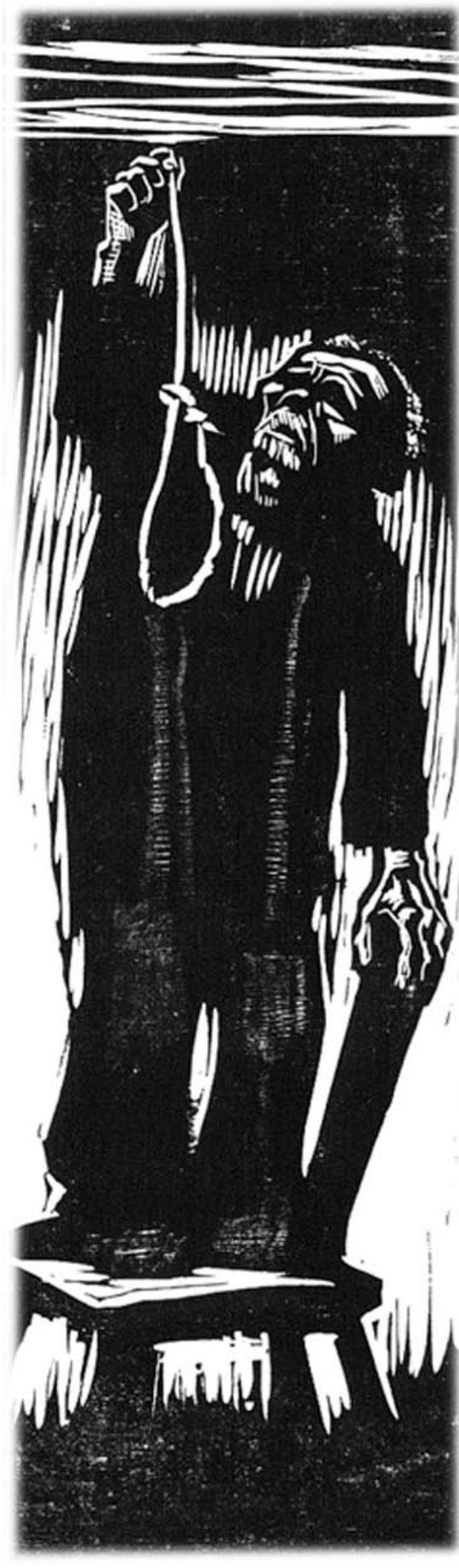
"The Last Thing" Woodcut by Kathe Kallwitz 1924