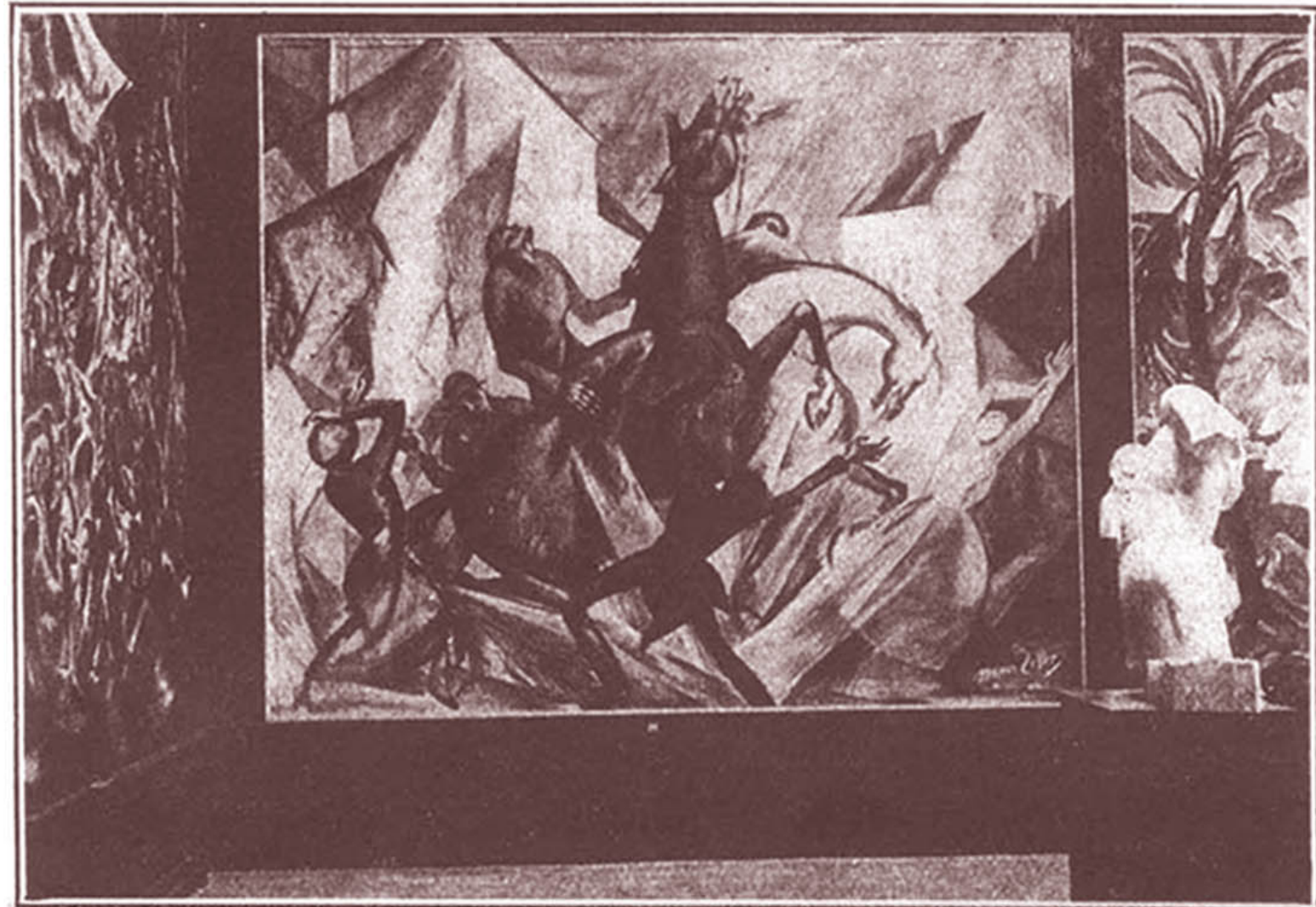
A REVOLUTIONARY CORNER OF THE BERLIN "SECESSION" Magnus Zeller's "Collapse" seems appropriately named, as it is a somewhat cubistic rendition of the revolution.

"The Republic, through the collapse of the old system, has inherited a number of important and constructive duties in the domain of art. The aim of the cultivation of art must be to recognize the fact that art is not a luxury nor an exceptional circumstance, but that it must penetrate the people's daily life; that it shall not be for the few but within reach