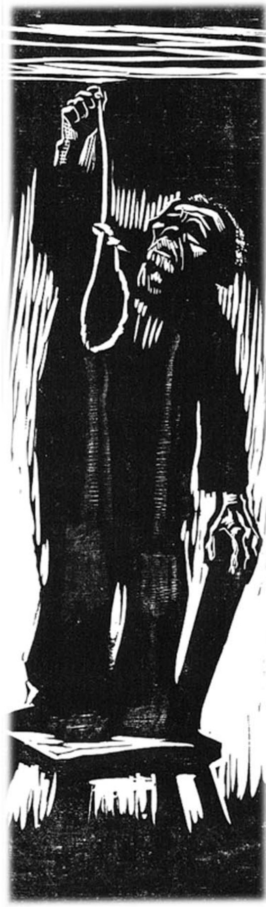
"The Last Thing" Woodcut by Kathe Kallwitz 1924