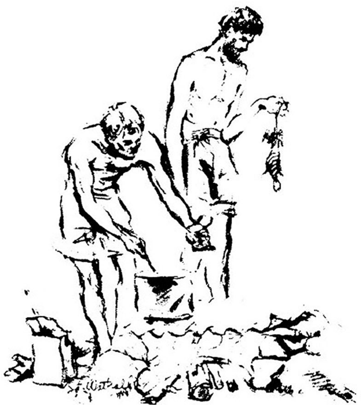
Men told of eating cats, dogs, rats and lizards in their fight to stay alive in the Jap prison camp.

A few feet away a half dozen of the prisoners, clad in only thin long-handled cotton unders, "in a space smaller than a city block. The summer of '42 was the worst—they were dying 20 or 30 a day. One day 65 died. The Japs made us bury them, made us dig holes, then threw 40 or 50 bodies in a hole. When the hole was full, we covered it up. The smell made us sick."