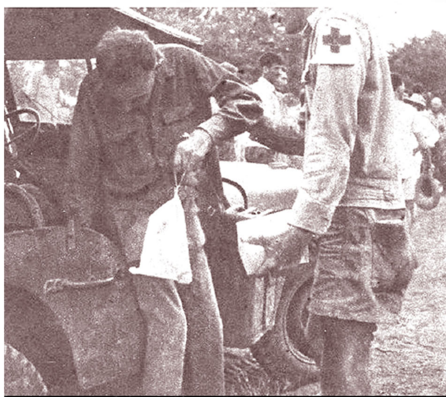
One of the liberated prisoners, armed with a Red Cross parcel, helps another into a waiting jeep, transport to an evac hospital.