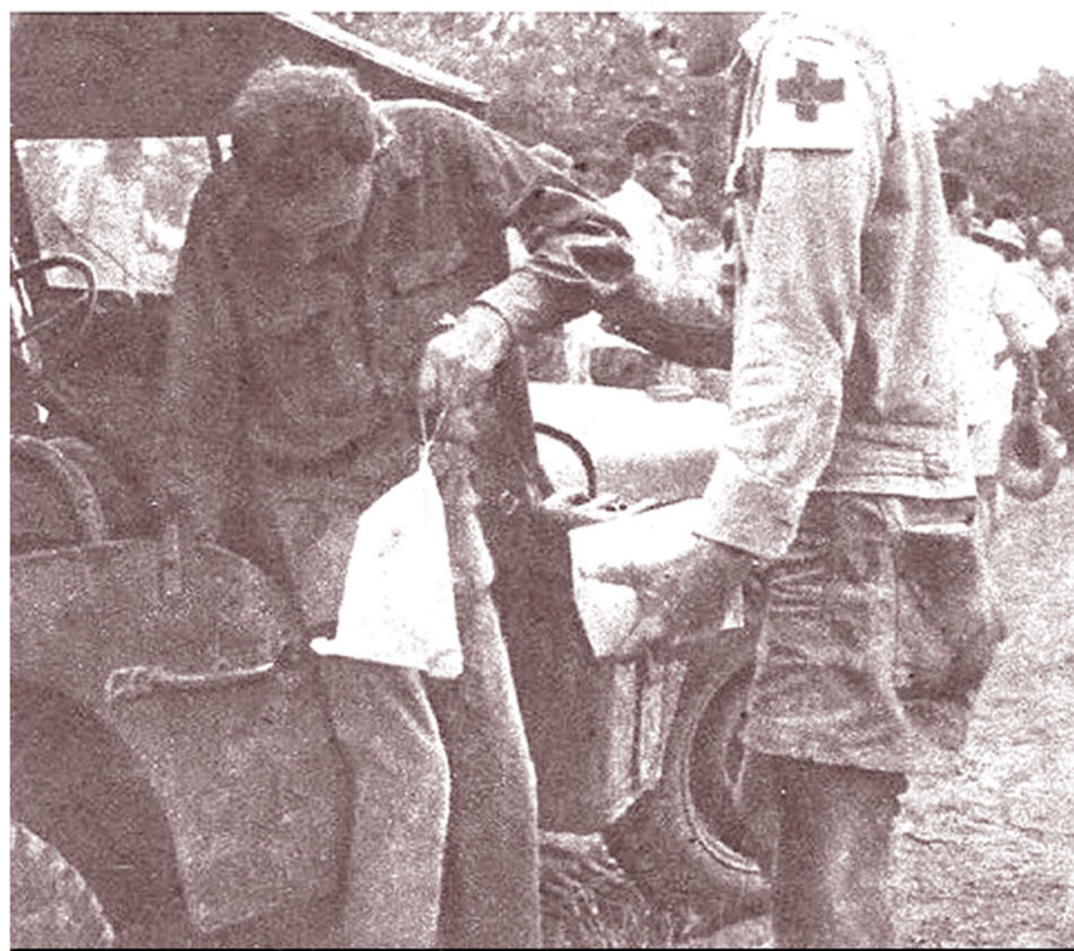
One of the liberated prisoners, armed with a Red Cross parcel, helps another into a waiting jeep, transport to an evac hospital.