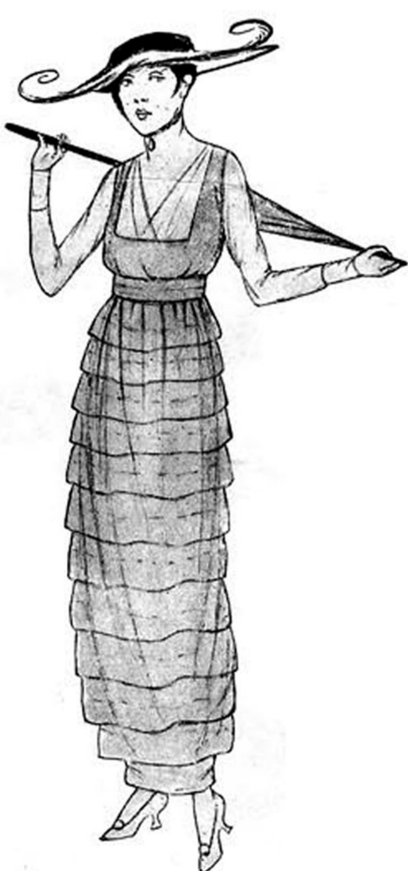
The familiar black taffeta with an unfamiliar tunic