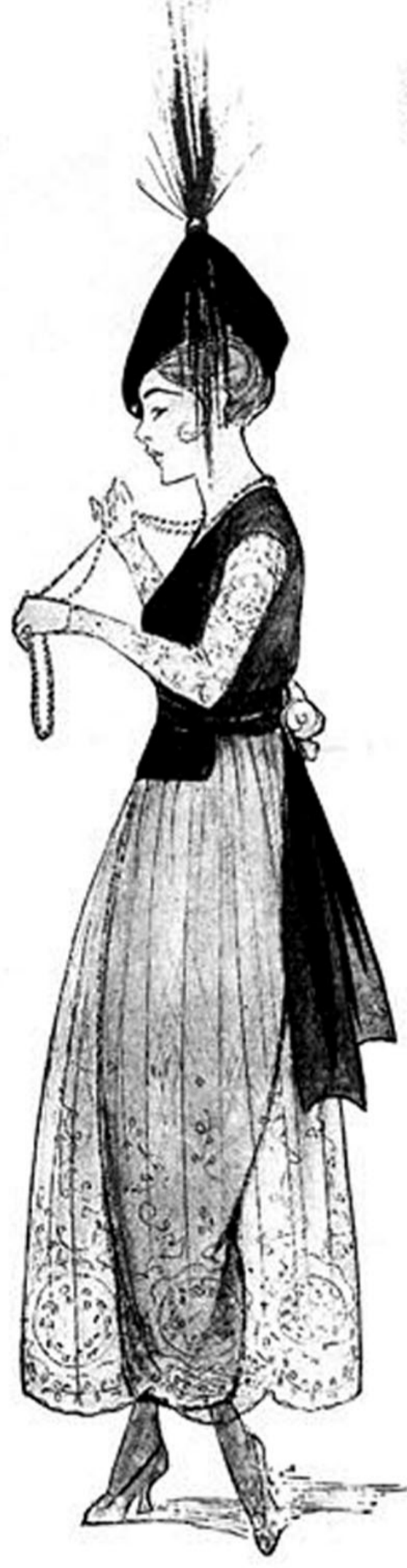
To the Café Madrid came an aristocratic peasant girl in lace and velvet

Redfern prefers to use a double frill on his summer models, and this is very youthful and effective, as was demonstrated by the gown worn by a young girl at the races. In this feature is combined the idea of long tunic and full skirt, which practically sum up the season's styles as far as skirts are concerned. The Redfern dress in question was of white and yellow linen, with a double plissé frill of white linen edged with white chenille, the waist being encircled by a wide, draped sash of the yellow velvet.