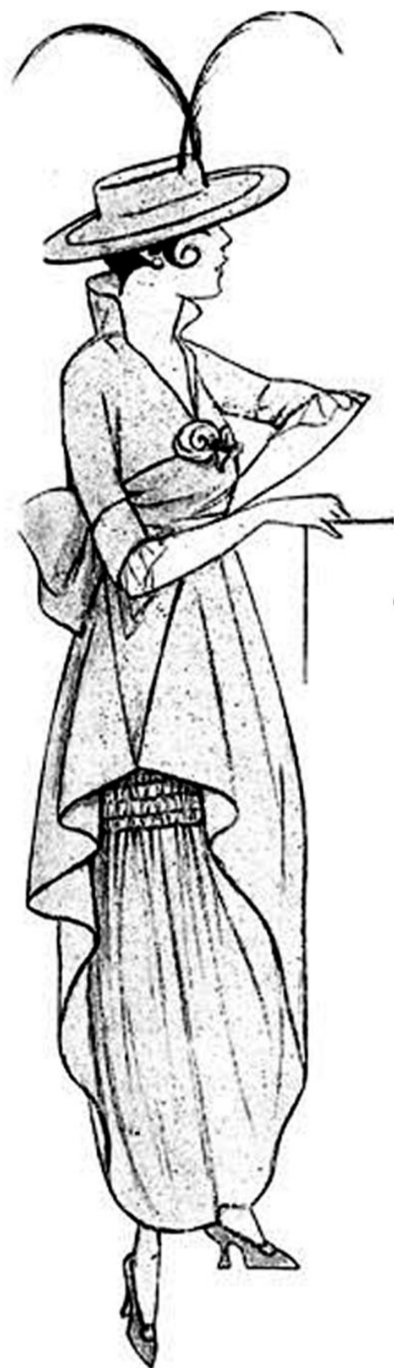
A Longchamp frock was tucked eleven times over