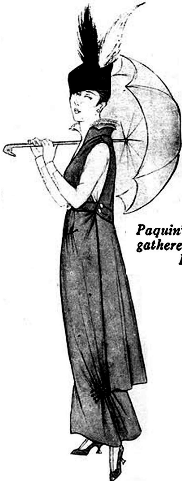
Paquin's favorite blue serge gathered low at the side in Paquin's manner

G LOVES continue to be worn very long, even over long sleeves, and when the sleeve is transparent it is made wide enough to permit of the glove being worn underneath. White kid and white suède are the only ones seen at the smart resorts, but a few of the white kid ones have the tops turned back and lined with a band of colored kid to match the dress.