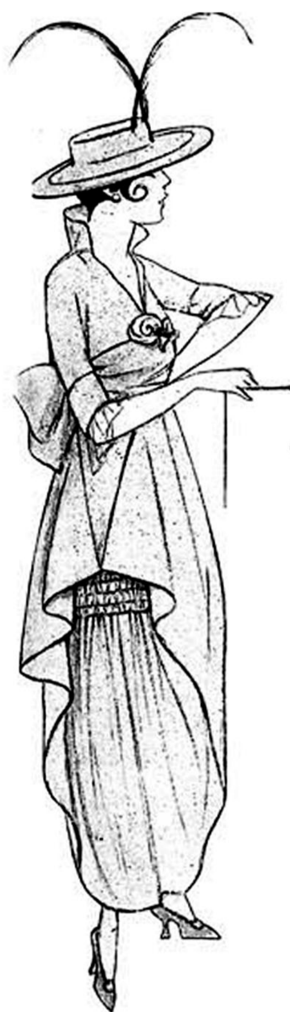
A Longchamp frock was tucked eleven times over