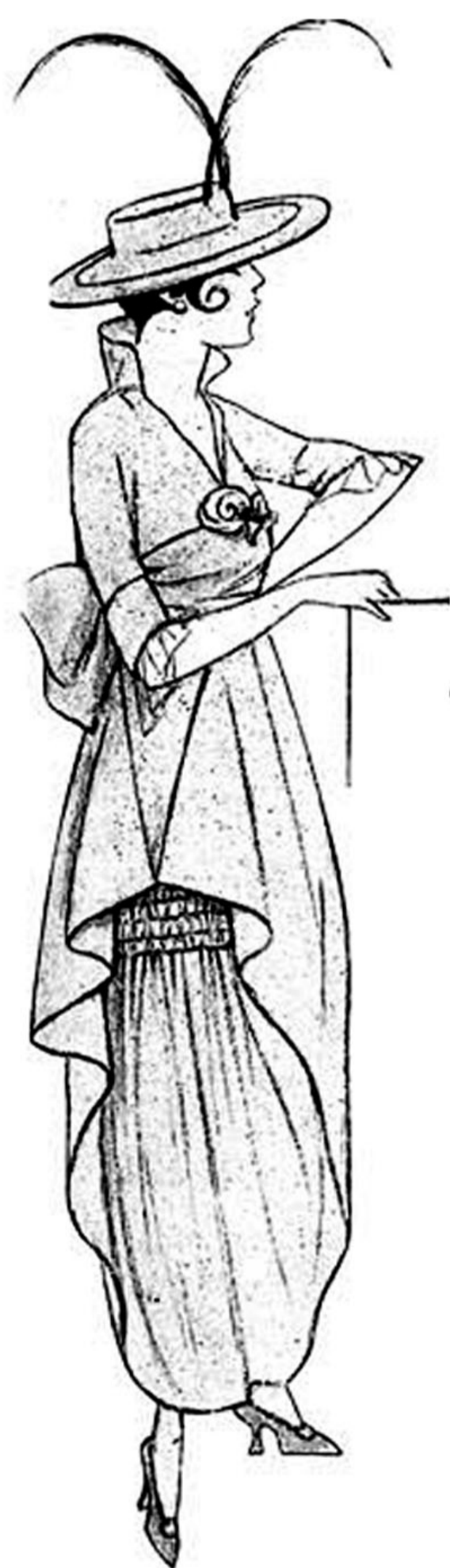
A Longchamp frock was tucked eleven times over