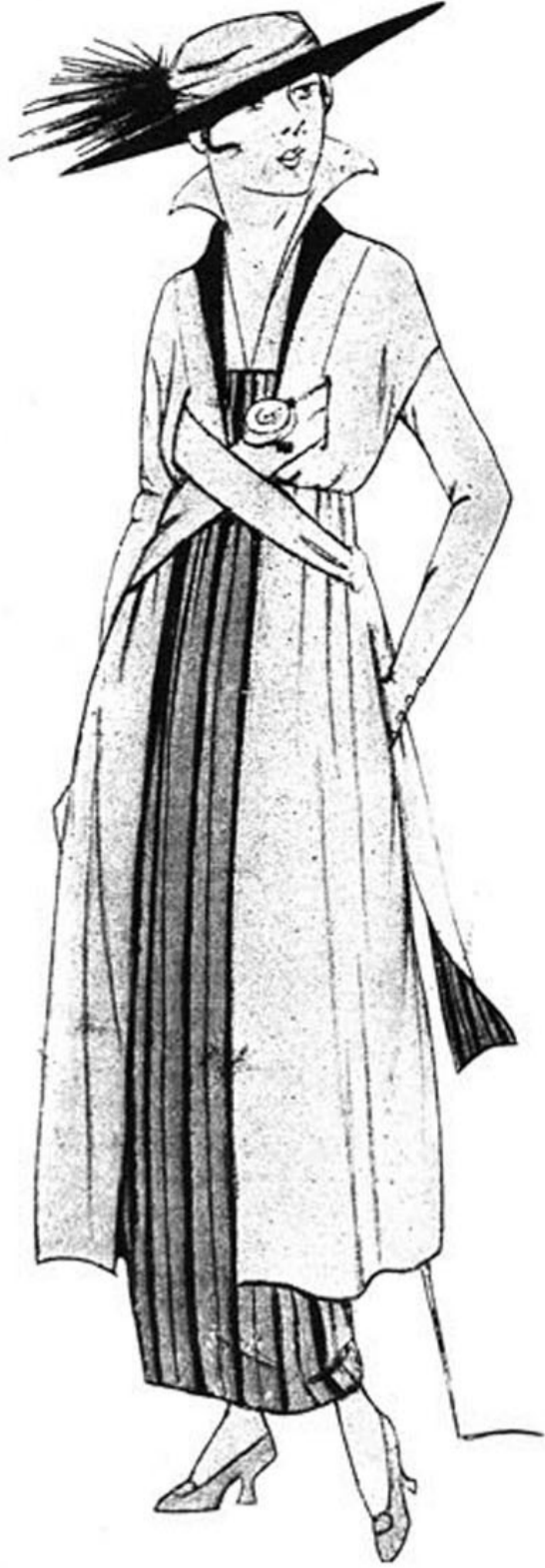
Drécoll ties a demure gray gabardine redingote over a striped taffeta slip

the days of convent prosperity the French nuns always wore gowns with such plaits at the hem of the skirt. The bodice of this Premet model was of the popular blouse variety, and had a little inner vest of black velvet crossed over like a waistcoat, and a wide black velvet sash about the hips.