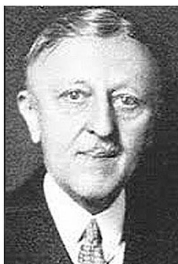
WILLIAM H. WOODIN of New York.