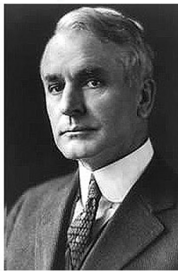
CORDELL HULL of Tennessee, Secretary of State.

The whole country, continues Mr. Hard, "lies under a blight of indecisiveness. Among members of Congress, and just as