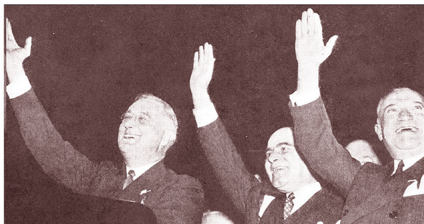
With the President are Governor Lehman and Senator Wagner

I N NOVEMBER, 1936, came the presidential and congressional elections. It was a hard-fought campaign, in which the issue was joined without reserve, in which no punches were pulled. The issue was a single one—the New Deal, its objectives, its methods, its future proposals. The opposition pointed to the Court as the only obstacle which had stood in our way. On the other hand, I made it clear that, if re-elected, I intended to continue to press harder and harder for our objectives, in order to carry out the will of the people. The spirit of the Democratic campaign was expressed in my speech at Madison Square Garden in New York City, on October 31, 1936: that for all our objectives—many of which had already been blocked by the Supreme Court—we had “only just begun to fight.”