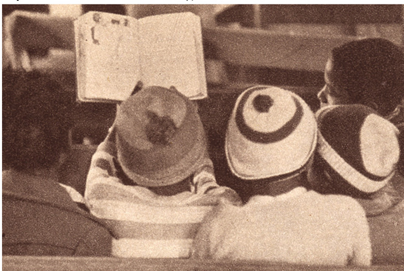
Negro school in Alabama has one textbook for whole class

In America the world-wide color explosion has focused attention on the grievances of Negro citizens as never before since the Civil War. Not only in the South—where humiliation and fear of personal injury still too often fetter the life of the Negro—but in the North, too, discrimination in housing, jobs and education has given colored leaders strong impetus. Recently, major legal strides have been made—especially in the Supreme Court—but change of white attitudes is slow.