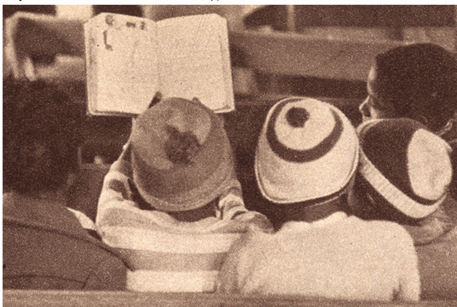
Negro school in Alabama has one textbook for whole class

In America the world-wide color explosion has focused attention on the grievances of Negro citizens as never before since the Civil War. Not only in the South—where humiliation and fear of personal injury still too often fetter the life of the Negro—but in the North, too, discrimination in housing, jobs and education has given colored leaders strong impetus. Recently, major legal strides have been made—especially in the Supreme Court—but change of white attitudes is slow.