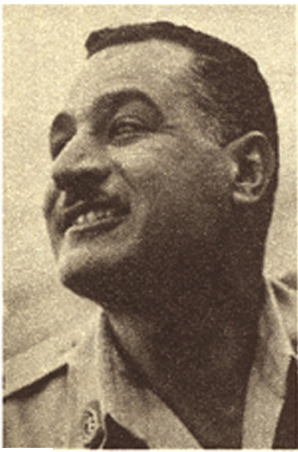
Gamal Nasser of Egypt