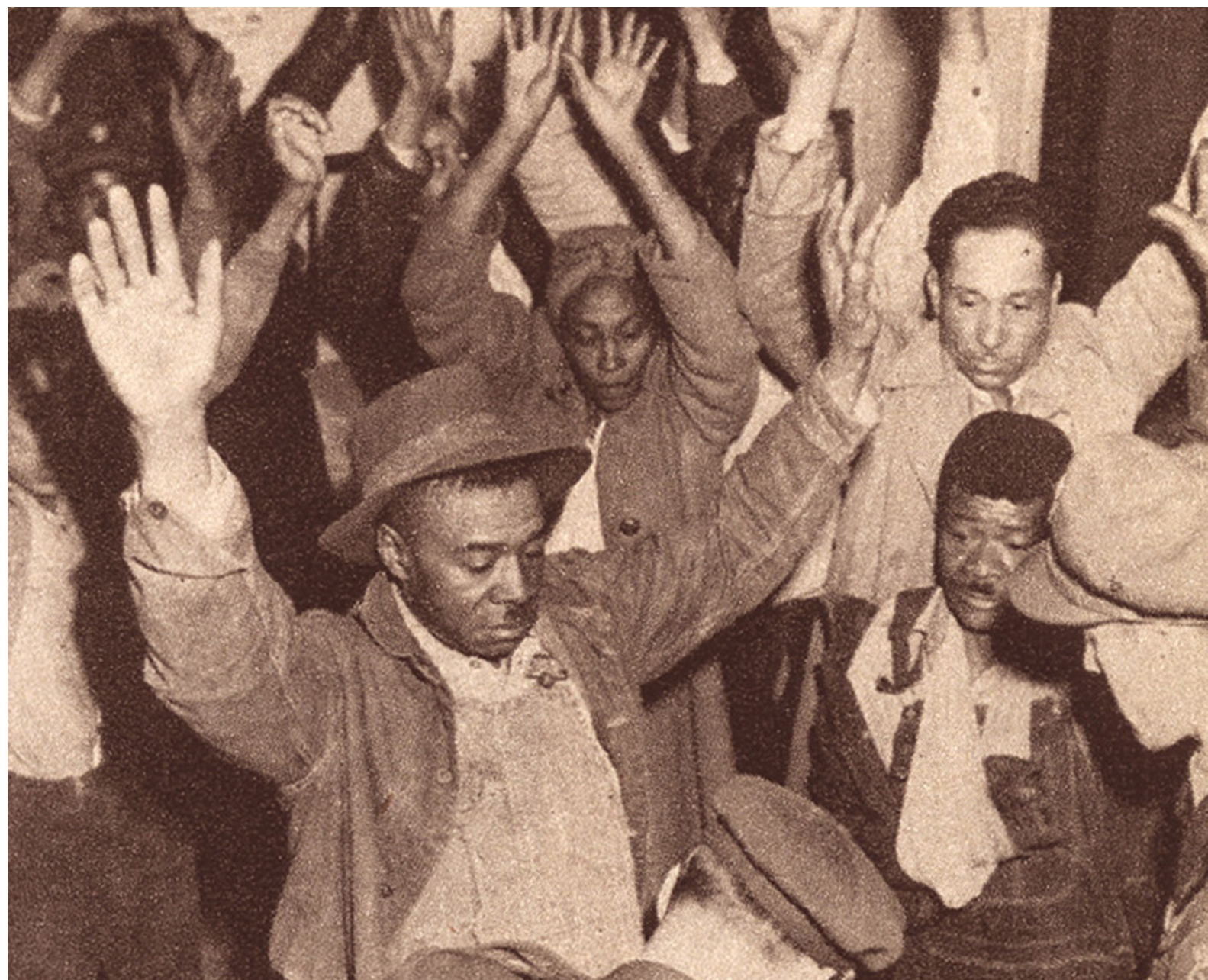
Raided Negroes distrusted white police, had own gun cache