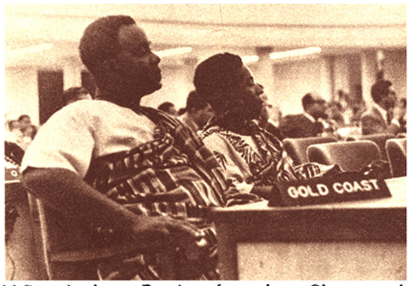
Gold Coast leaders at Bandung formed new Ghana republic

As for those colored leaders who wish to imitate the worst sins of the white world, by deciding all issues on a purely prejudiced racial basis, they are warned by Nehru of India who speaks from the core of the color explosion: "Wrong means will not lead to right results."