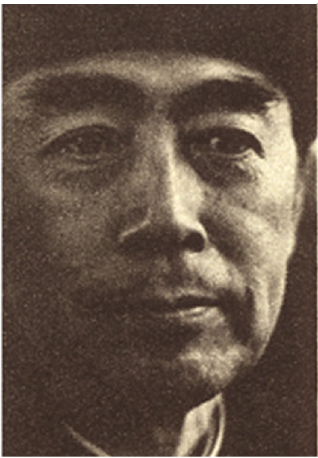
Chou En-lai of China