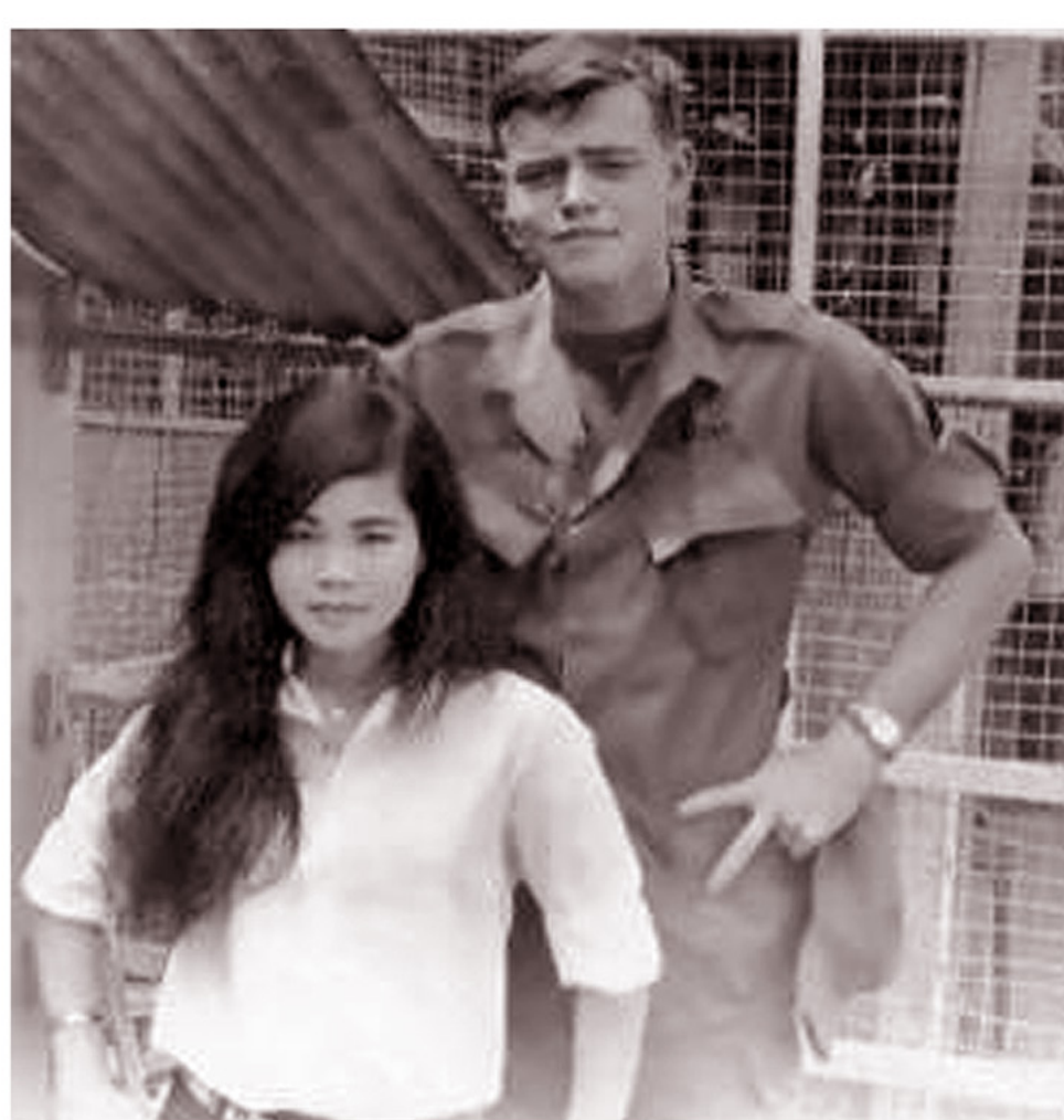
"Disapproved": couple below

In America the world-wide color explosion has focused attention on the grievances of Negro citizens as never before since the Civil War. Not only in the South—where humiliation and fear of personal injury still too often fetter the life of the Negro—but in the North, too, discrimination in housing, jobs and education has given colored leaders strong impetus. Recently, major legal strides have been made—especially in the Supreme Court—but change of white attitudes is slow.