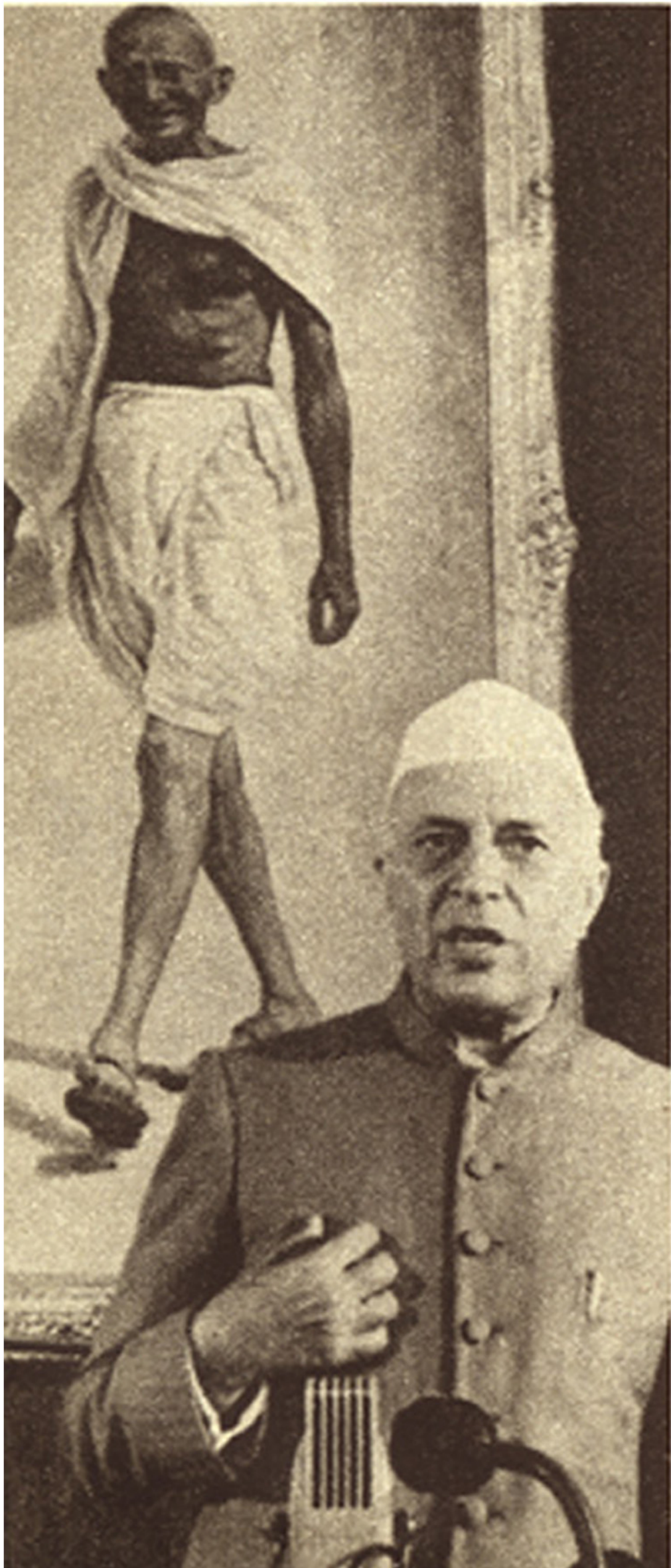
Spiritual leadership of Gandhi serves as guide for Nehru