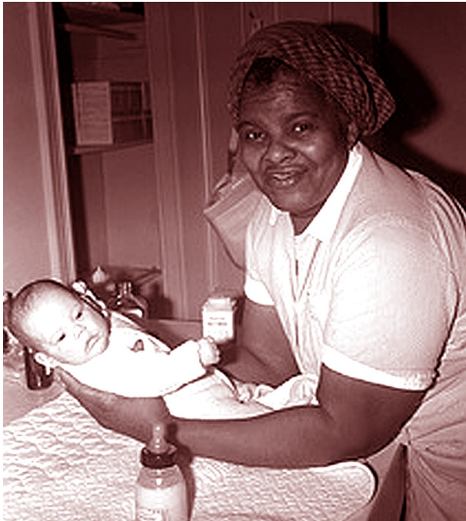
Approved" relationship in Miami, Fla. (above).

But there is much reason to hope that solutions will be found. One UNESCO pamphlet notes: "To future generations it may seem unbelievable that a slight difference in the chemical composition of their skins have caused men to hate, despise, revile and persecute each other."