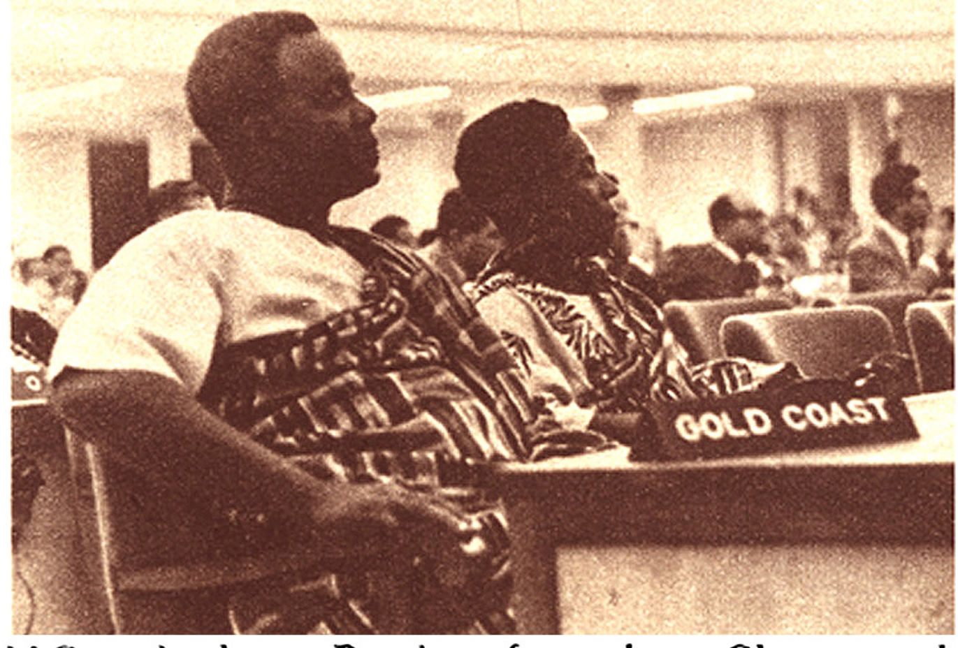
Gold Coast leaders at Bandung formed new Ghana republic

As for those colored leaders who wish to imitate the worst sins of the white world, by deciding all issues on a purely prejudiced racial basis, they are warned by Nehru of India who speaks from the core of the color explosion: "Wrong means will not lead to right results."