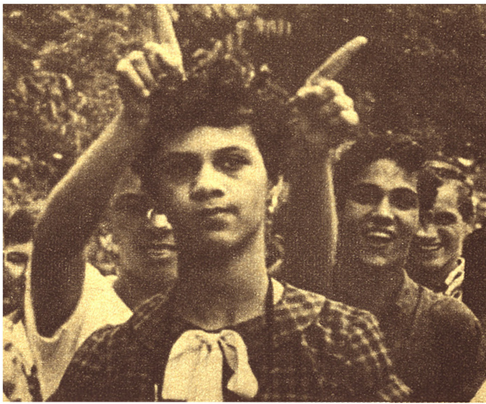
Race prejudice means ridicule for Negro girl in Little Rock, Ark.

It would be pleasant to say that the colored peoples simply wish to put into reality the brotherhood of man in an enlightened age when almost everyone knows that skin color has nothing to do with a man's rights or abilities. (This is indeed one of the ideals of colored leaders like Nehru of India and the Rev. Martin Luther King of the U. S.) But the color explosion is of such intensity, the desire for self-determination is so strong, that the whites cannot hope for the problem to be resolved on such a lofty plane. Like it or not, they are being challenged to deal with angry, color-proud equals who are already changing the world.