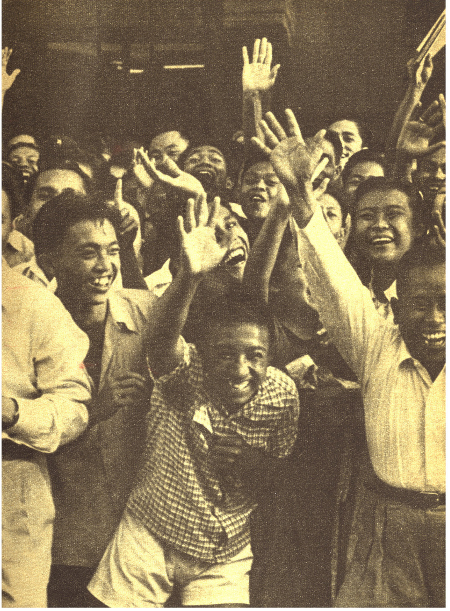
Joyous Indonesians greet delegates to all-colored nations' parley at Bandung in 1955, which symbolized new political force in the world