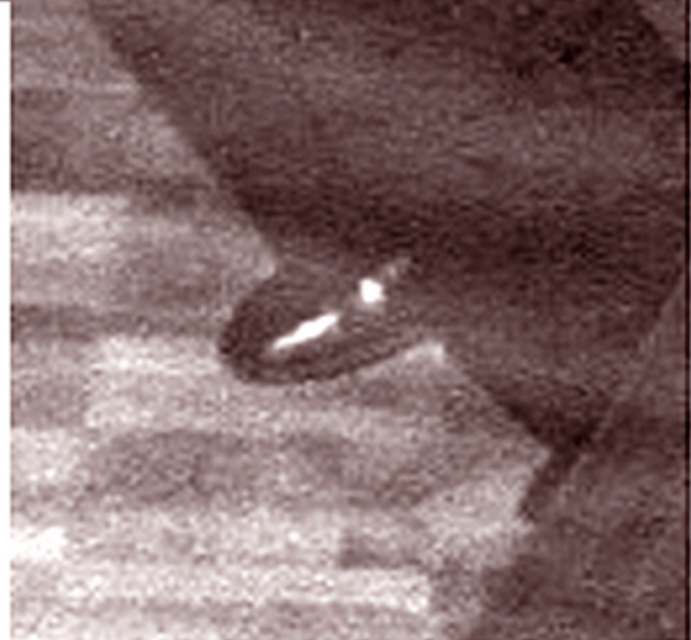
Flynn give rhumba lesson to model Pat Byrnes.