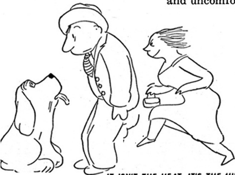
IT ISN'T THE HEAT, IT'S THE HUMIDITY.