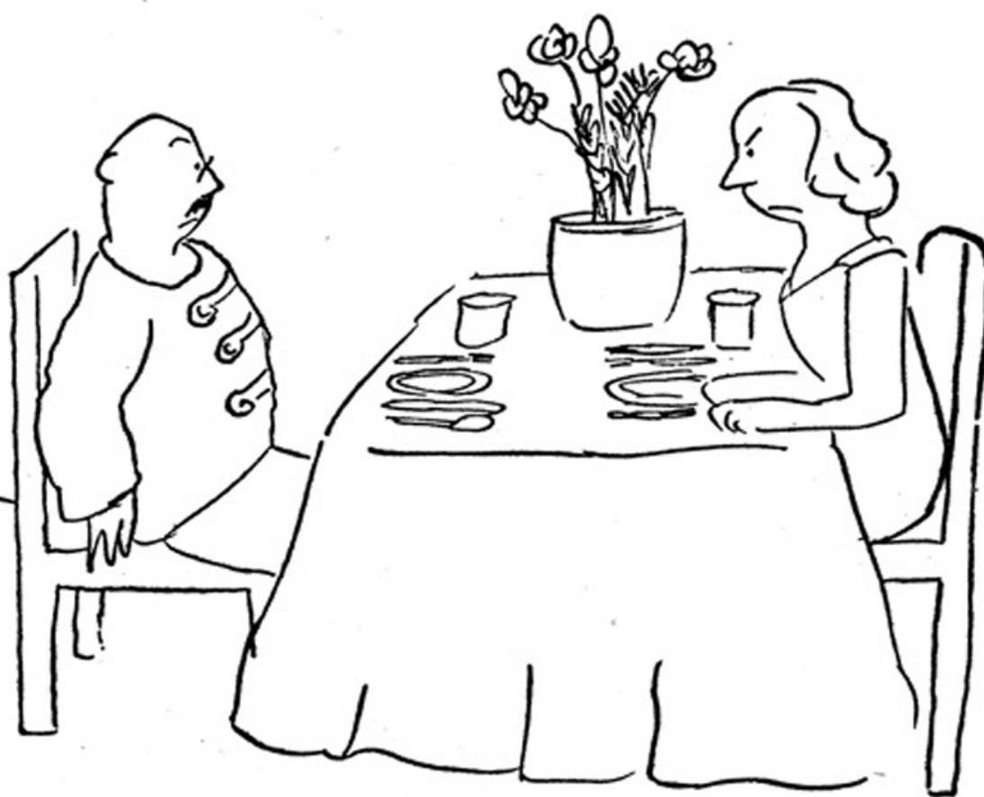
NEVER IN MY HOME!

Clothes like these are an investment. Wake up, mice!