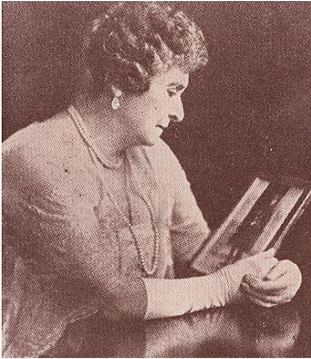
Douglas MacArthur's mother was the former Mary P. Hardy, a beautiful girl who came from an old Virginia family.

liant and brave and idealistic and eloquent.