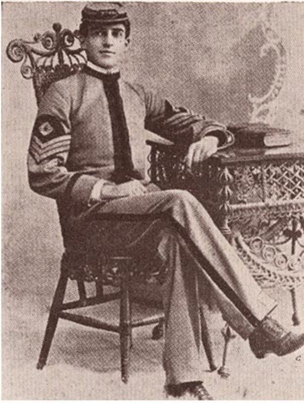
As a West Point cadet, MacArthur already had the touch of greatness: his marks were the highest ever recorded.

economic democratization. The first was accomplished with magnificent dispatch, thanks, in good part, to the cooperation of the Japanese. With only minor reservations, Nippon's military leaders accepted their purge from public life, the soldiers shouldered their meager packs and marched home as civilians, and the people—who had known the worst that war has so far offered—announced their hatred of the whole business and turned, first with fear and then with hope, to something new. This was success. And the credit went to MacArthur.