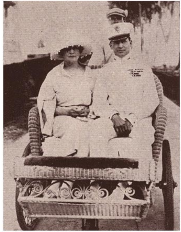
On a 1922 Florida vacation, he posed solemnly in this beach chair with his first wife. They were later divorced.

MacArthur's personal isolation in the very core of Japan today is prescribed to some extent by the role he must play as conqueror-cum-liberator of the Japanese. Among his own people he is isolated by the Army chain-of-command system, which limits ordinary give-and-take to men of equal rank, and necessarily relegates a five-star general to self-communion. But it is also in keeping with a personality that is constructed on the pattern of Victorian grandeur. In the audiences he holds with the higher echelon members of his staff, with newspaper correspondents, or with visiting American dignitaries, conversation runs a one-way track: from MacArthur to his listeners.