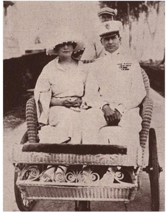
On a 1922 Florida vacation, he posed solemnly in this beach chair with his first wife. They were later divorced.

MacArthur's personal isolation in the very core of Japan today is prescribed to some extent by the role he must play as conqueror-cum-liberator of the Japanese. Among his own people he is isolated by the Army chain-of-command system, which limits ordinary give-and-take to men of equal rank, and necessarily relegates a five-star general to self-communion. But it is also in keeping with a personality that is constructed on the pattern of Victorian grandeur. In the audiences he holds with the higher echelon members of his staff, with newspaper correspondents, or with visiting American dignitaries, conversation runs a one-way track: from MacArthur to his listeners.