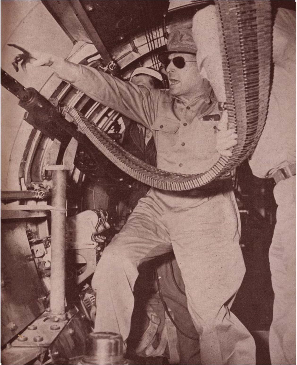
A dauntless commander in war, MacArthur was photographed not only landing with his men but also, as here, directing attacks from the waist of a heavy bomber.