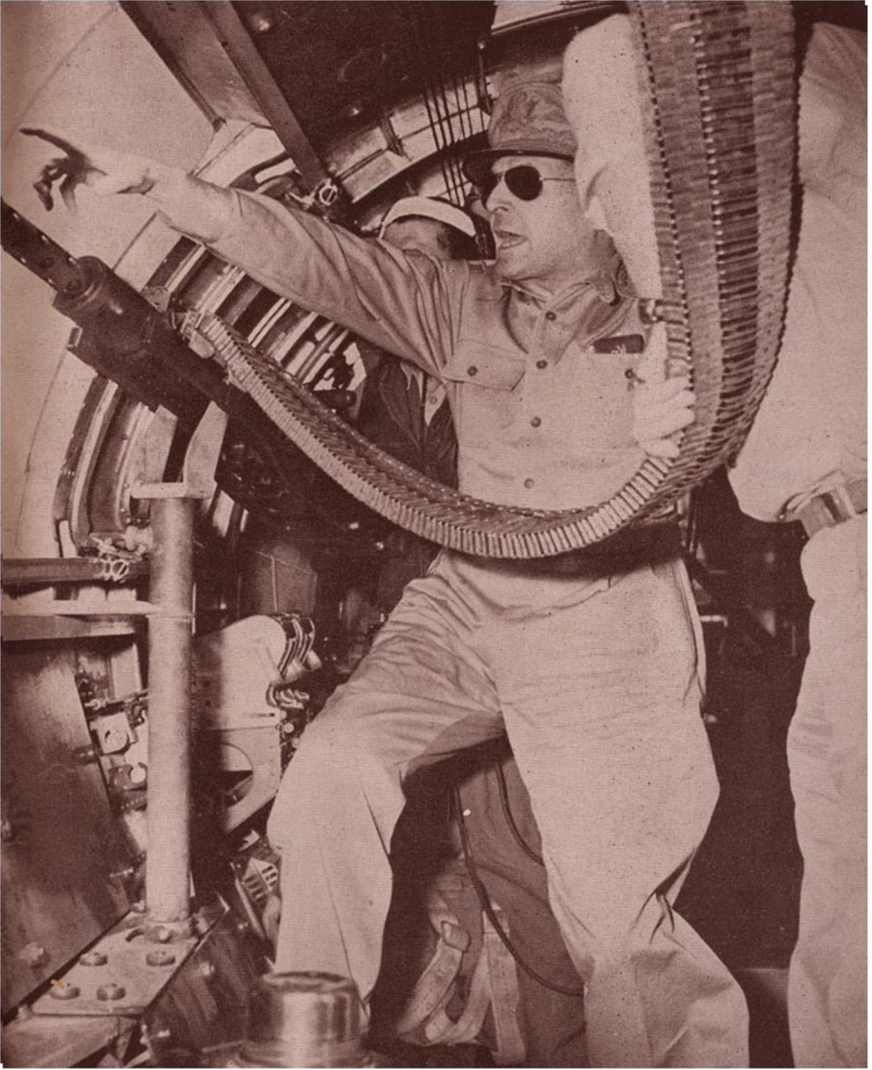
A dauntless commander in war, MacArthur was photographed not only landing with his men but also, as here, directing attacks from the waist of a heavy bomber.