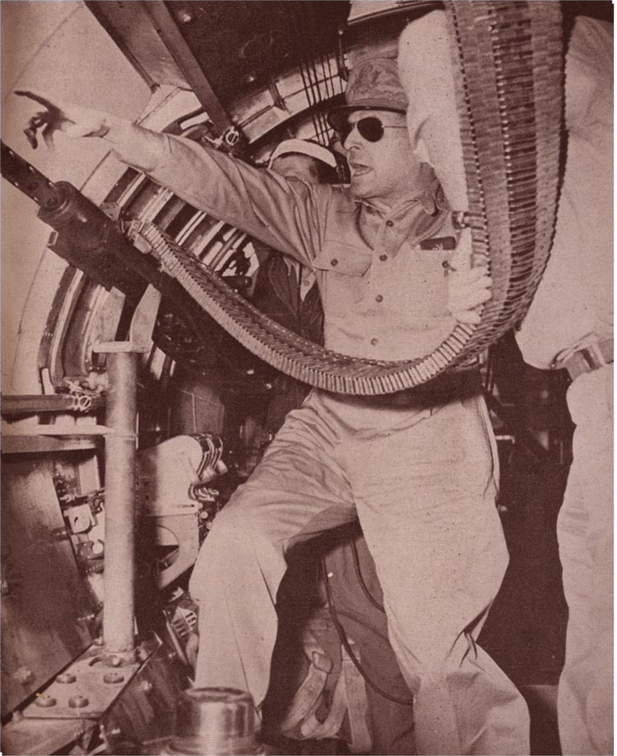
A dauntless commander in war, MacArthur was photographed not only landing with his men but also, as here, directing attacks from the waist of a heavy bomber.