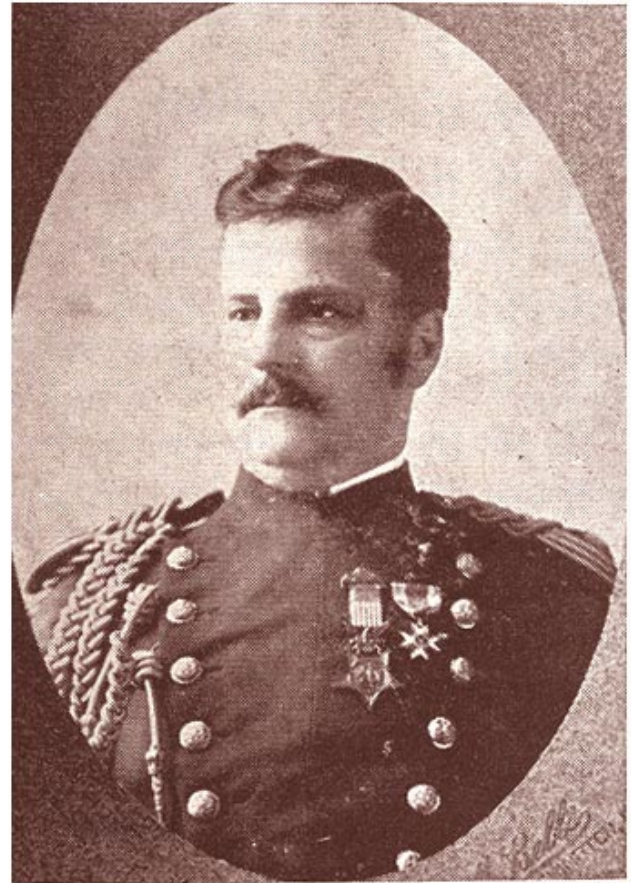
General Arthur MacArthur, the hero's father, was a famous military leader who died as he had lived—dramatically.

So that Japan might never again wage war, MacArthur divided his occupation aims, in order of precedence, into three parts: demilitarization, political democratization,