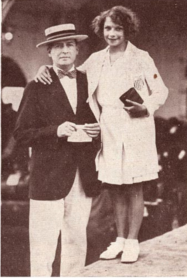
As president of the Olympic Commission, MacArthur was photographed in 1928 with the diver, Dorothy Poynton.

Philippines and a year as aide to his father in Tokyo. Later he was aide to President Theodore Roosevelt. During World War I he served with the Rainbow Division, which he helped to activate and which he commanded as a brigadier general at the age of 38. He was wounded twice but refused to leave his outfit for hospitalization.