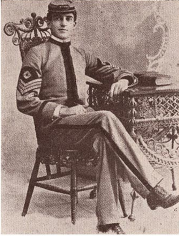
As a West Point cadet, MacArthur already had the touch of greatness: his marks were the highest ever recorded.

economic democratization. The first was accomplished with magnificent dispatch, thanks, in good part, to the cooperation of the Japanese. With only minor reservations, Nippon's military leaders accepted their purge from public life, the soldiers shouldered their meager packs and marched home as civilians, and the people—who had known the worst that war has so far offered—announced their hatred of the whole business and turned, first with fear and then with hope, to something new. This was success. And the credit went to MacArthur.