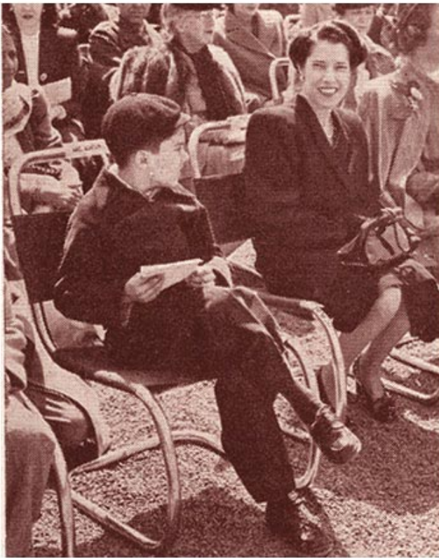
MacArthur's second wife and 10-year-old son, shown at a Tokyo celebration, are charming, popular, and photogenic.

"While it seems unnecessary for me to repeat that I do not actively seek or covet any office and have no plans for