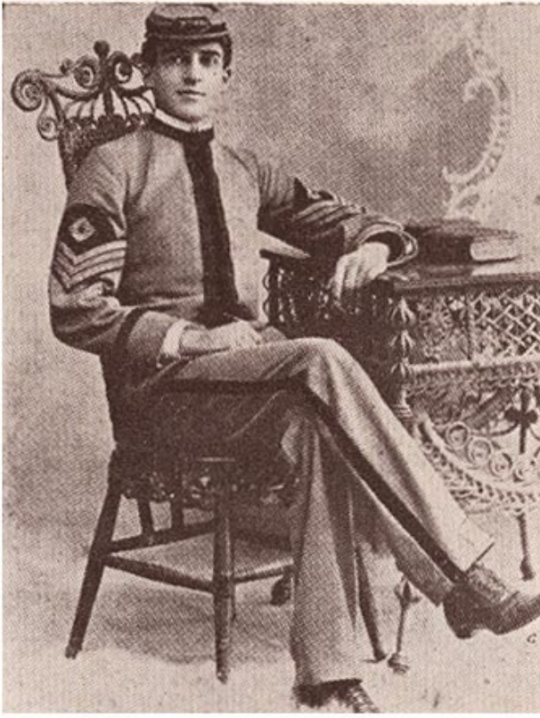
As a West Point cadet, MacArthur already had the touch of greatness: his marks were the highest ever recorded.

economic democratization. The first was accomplished with magnificent dispatch, thanks, in good part, to the cooperation of the Japanese. With only minor reservations, Nippon's military leaders accepted their purge from public life, the soldiers shouldered their meager packs and marched home as civilians, and the people—who had known the worst that war has so far offered—announced their hatred of the whole business and turned, first with fear and then with hope, to something new. This was success. And the credit went to MacArthur.