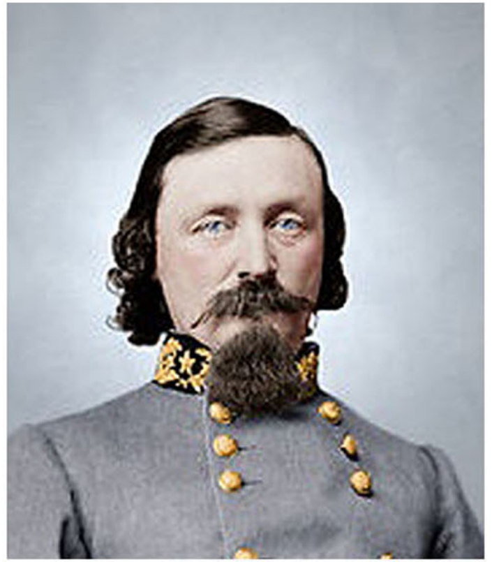
Maj. Gen. George E. Pickett.

CANNONADE AT DAWN: CULP'S HILL AND SPANGLER'S SPRING. Night brought an end to the bloody combat at East Cemetery Hill, but this was not the time for rest. What would Meade do? Would the Union Army remain in its established position and hold its lines at all costs? At midnight Meade sought the advice of his Council of War in the east room of his headquarters. The corps commanders—Gibbon, Williams, Sykes, Newton, Howard, Hancock, Sedgwick, and Slocum—without exception advised holding the positions established. Meade, approving, turned to the officer whose division held the Union center, and said, "Gibbon, if Lee attacks me tomorrow it will be in your front."