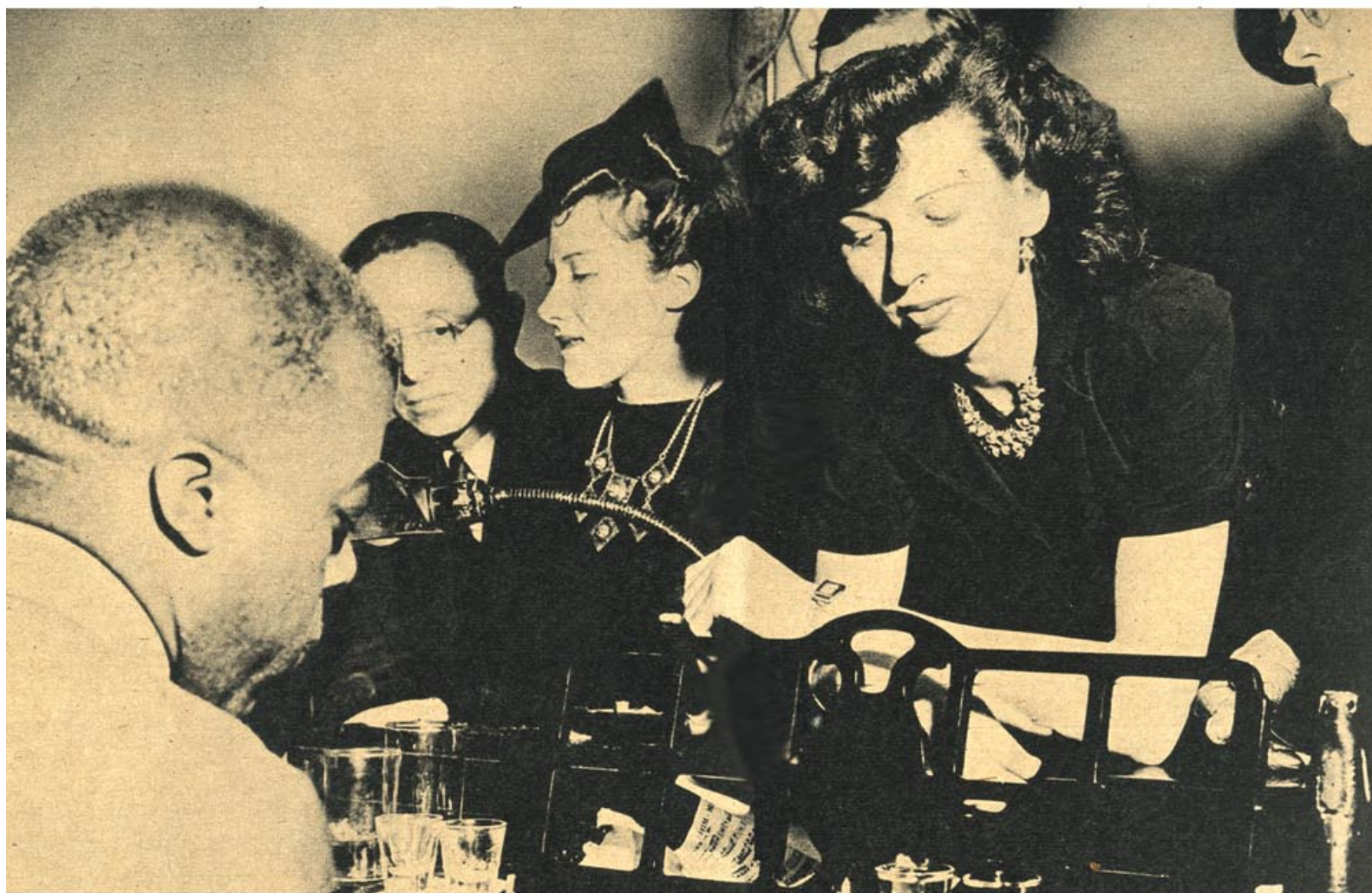
THE BOOGIE-WOOGIE ARTIST "SENDING" JAZZ DEVOTEES AT HOT JAM SESSION IN VILLAGE VANGUARD, NEW YORK'S BOHEMIAN NITERY.

"Back Door Stuff" was first written for the Chicago Bee in 1932, where Dan served from 1932 to 1937. The fame of the column induced the publishers of the Amsterdam News to bring