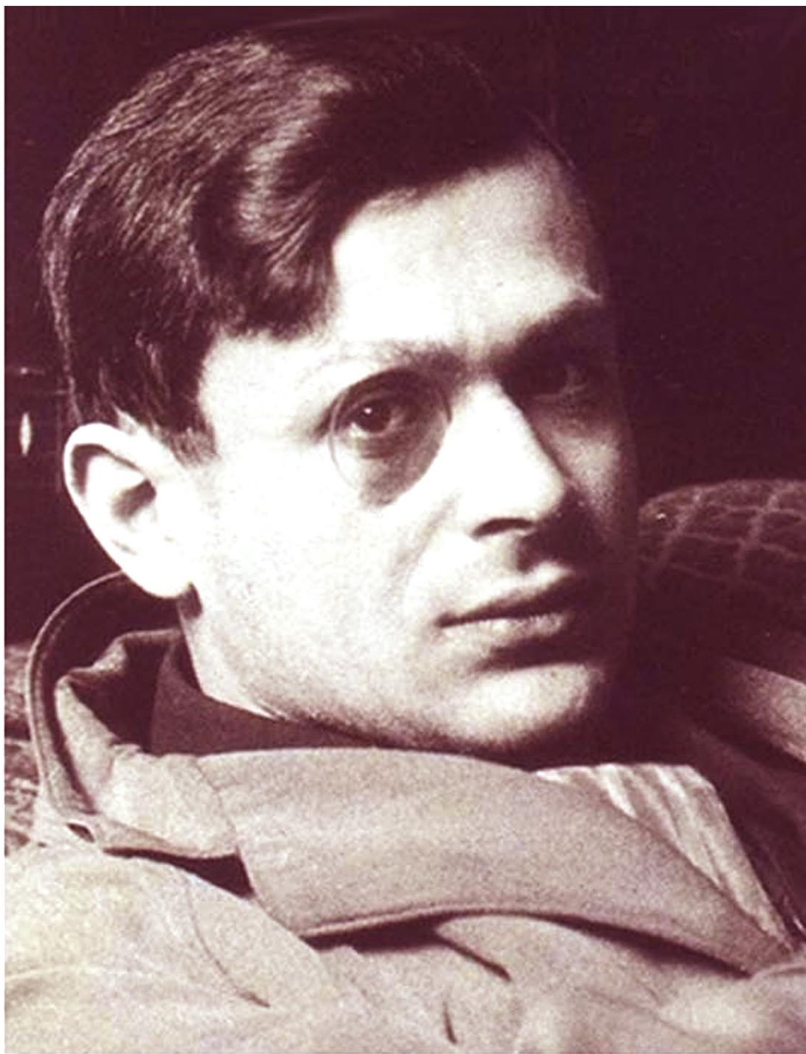
Tristan Tzara (1896 - 1963)