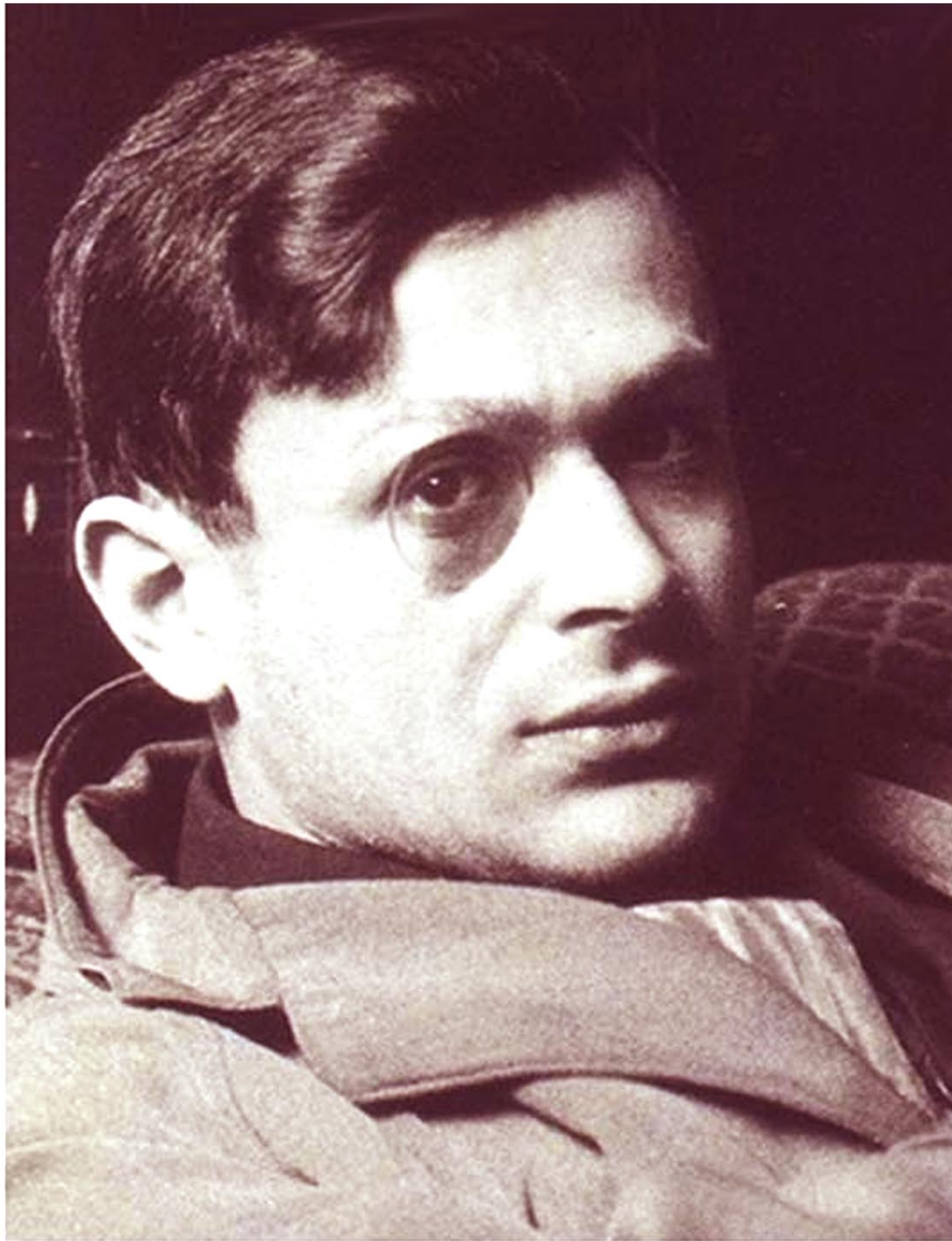
Tristan Tzara (1896 - 1963)