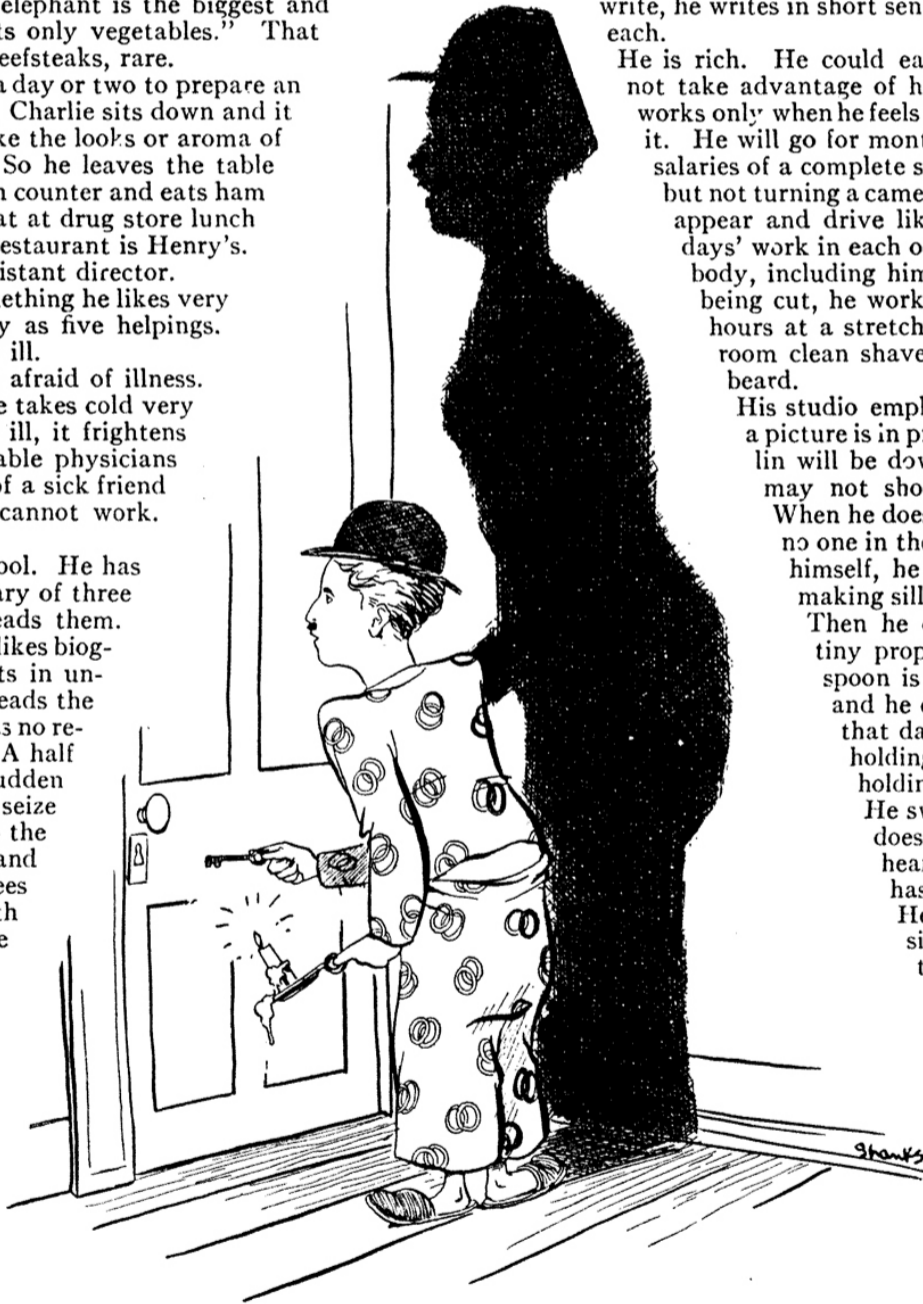
Chaplin locks every door of his bedroom each night before turning in. We do not know for sure whether he sleeps in his derby

He has a dictaphone beside his bed. Two or three times a night, he wakes up and shouts thoughts into the machine. Then he turns it off and goes back to sleep. The next day, secretaries transcribe what he has said, and very often Chaplin doesn't know what it's all about when he reads it. Mostly, from his bed, he