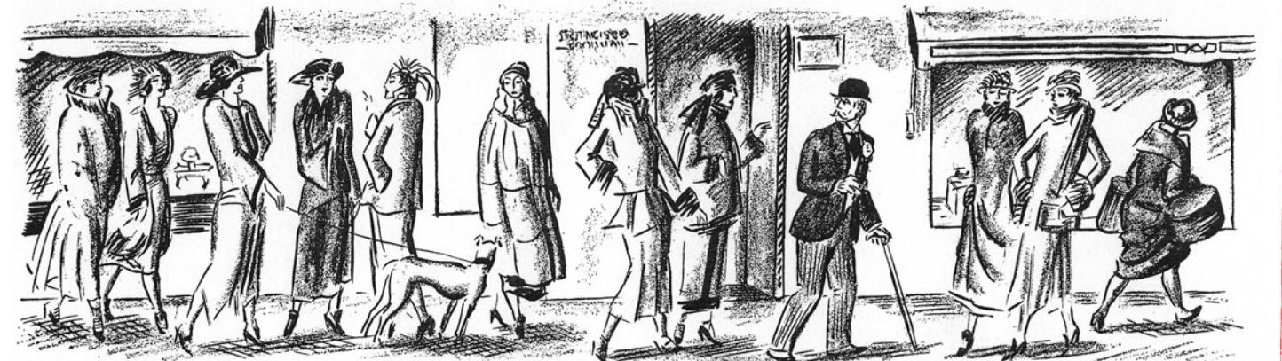
FIFTH AVENUE AT FORTY-EIGHTH STREET, WHICH IS THE HAUNT OF THE MILLINERS AND MIDINETTES