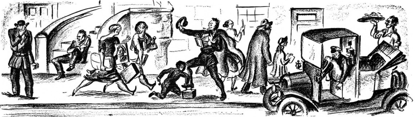
FIFTH AVENUE AT EIGHTH STREET, THE DISTRICT OF BATIKS, ART STUDENTS, TEA-ROOMS, AND FREE VERSE POETS

The thing which makes Fifth Avenue so extraordinary among the famous streets of the world is that it presents a new aspect every half mile or so. Where the Rue de la Paix and Piccadilly preserve their identity throughout, Fifth Avenue shows almost every phase of New York life within a few miles