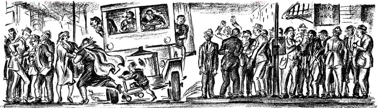
FIFTH AVENUE AT TWENTY-EIGHTH STREET, WHERE THE GARMENT WORKERS, BOLSHEVISTS AND SWEAT-SHOPS ARE FOUND