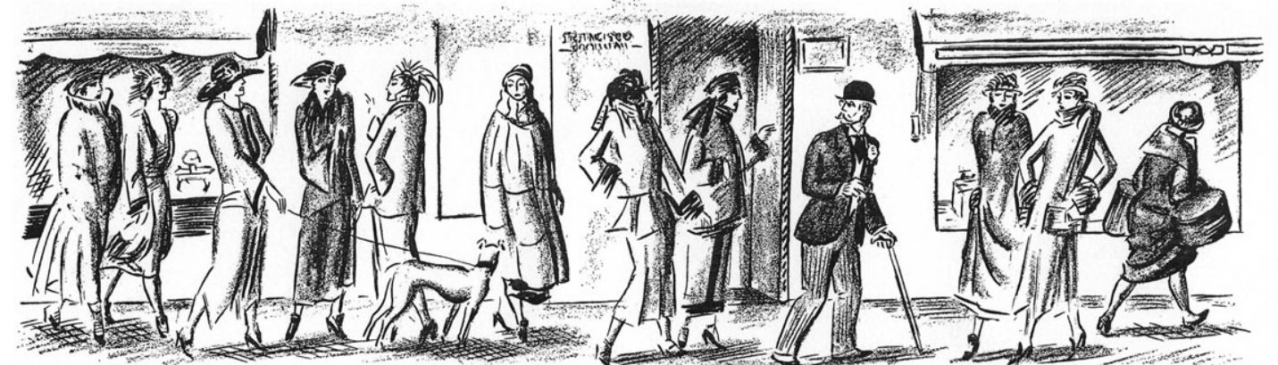
FIFTH AVENUE AT FORTY-EIGHTH STREET, WHICH IS THE HAUNT OF THE MILLINERS AND MIDINETTES