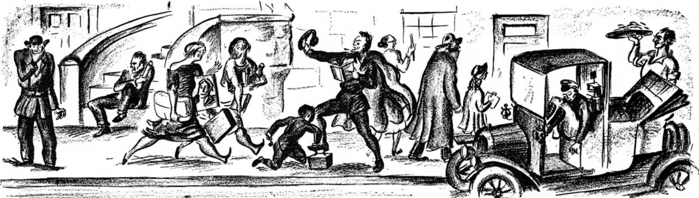
FIFTH AVENUE AT EIGHTH STREET, THE DISTRICT OF BATIKS, ART STUDENTS, TEA-ROOMS, AND FREE VERSE POETS

The thing which makes Fifth Avenue so extraordinary among the famous streets of the world is that it presents a new aspect every half mile or so. Where the Rue de la Paix and Piccadilly preserve their identity throughout, Fifth Avenue shows almost every phase of New York life within a few miles