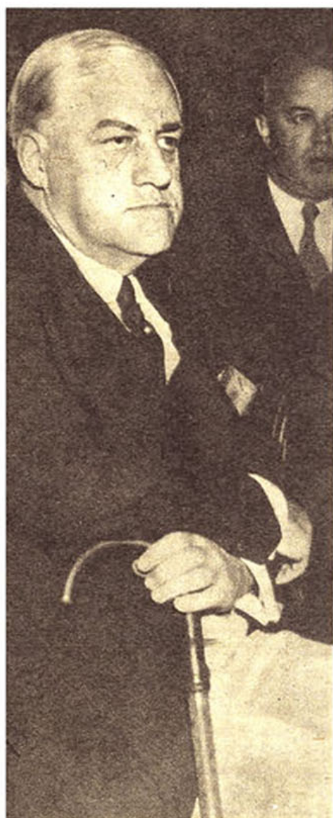
A "RED-HUNT" by Atty.-Gen. A. Mitchell Palmer in 1919 squelched the party until 1923.