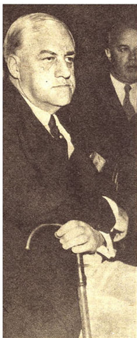
A "RED-HUNT" by Atty.-Gen. A. Mitchell Palmer in 1919 squelched the party until 1923.