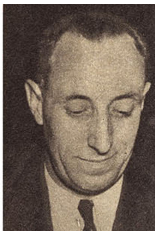
DENYING Communist ties, Harry Bridges and other agitators use Red tactics.