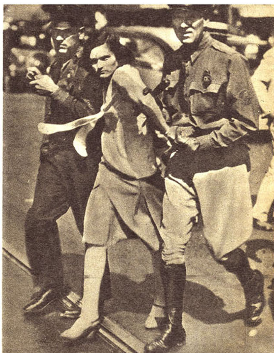
AN ALLEGED Communist is arrested during a 1930 Labor Day clash with the "cossacks." Civil warfare has been stopped by edict of party leaders.