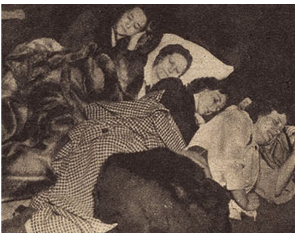
THIS sit-down strike of reliefers in Pleasantville, N. J., is typical of many revolts against the Government dictated by alien-minded leaders of the unemployed.