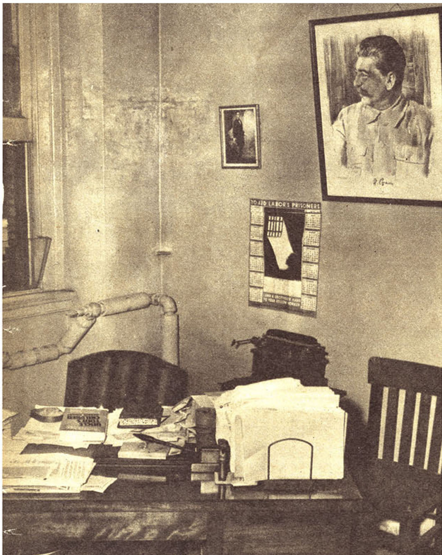
FROM this ninth floor office, 50 E. 13th Street, New York City, Browder directs the activities of 75,000 American Communists. For each card-carrying member there are said to be 15 to 20 "sympathizers."