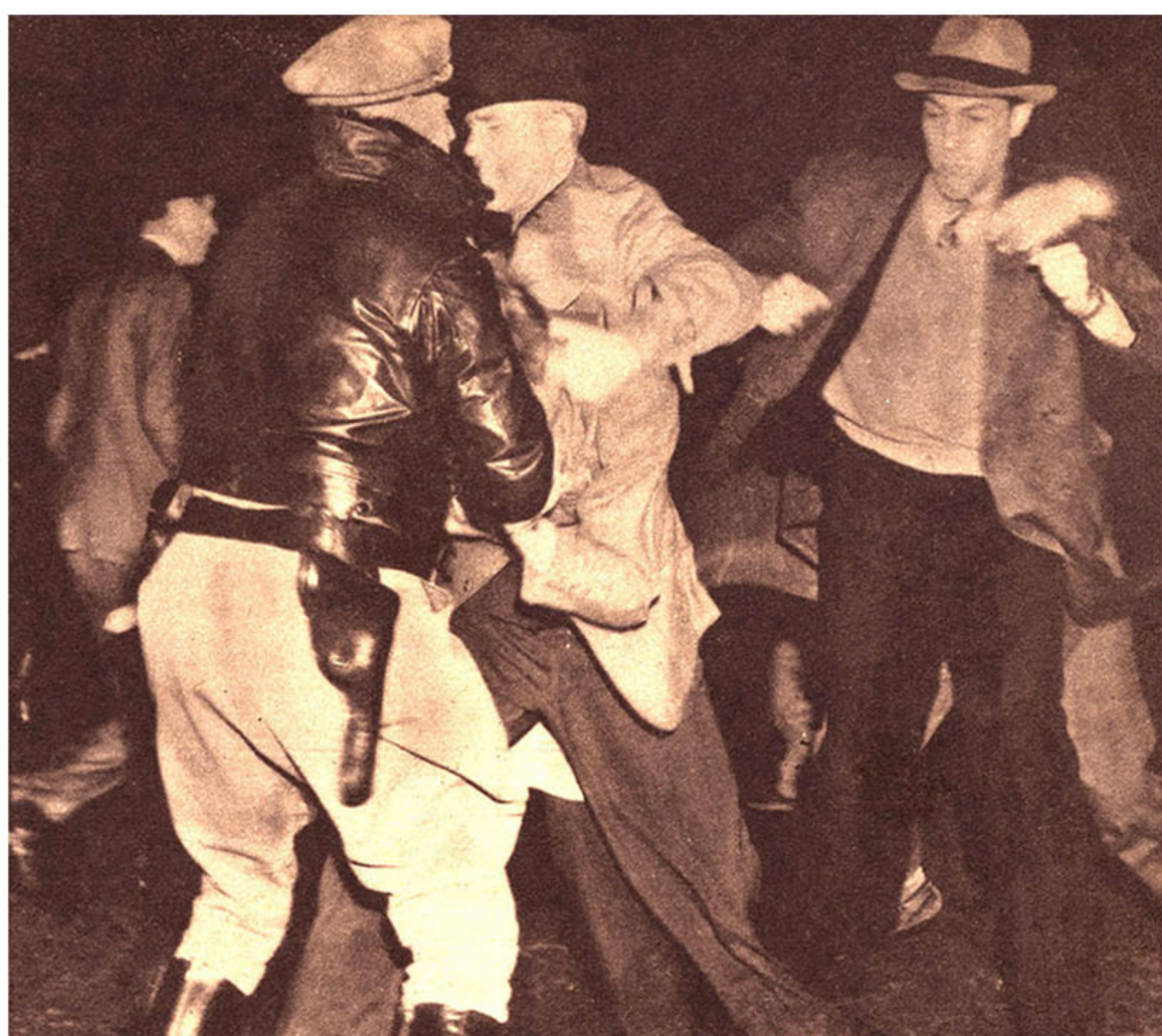
MANY a U. S. college is infested by the Young Communists' League with its insidious, moral-mocking propaganda. The college men who resent such troublous agitation often resort to fisticuffs as in this battle between Loyola University students and lecture-picketing Communists.