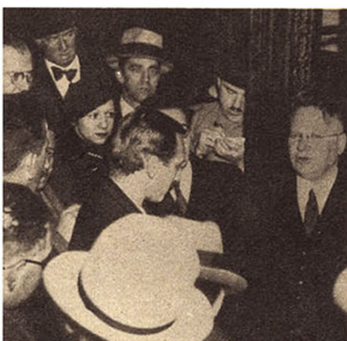
IN 1933 , via Maxim Litvinoff, Russia promised to quash U. S. Reds. The pledges never were fulfilled.