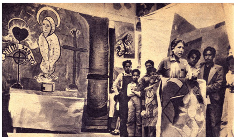
STRATEGICALLY camped at our back door of Mexico waiting to give U. S. comrades help, when necessary, is another branch of the Party. Their children are taught to burlesque religion with crude wall paintings.