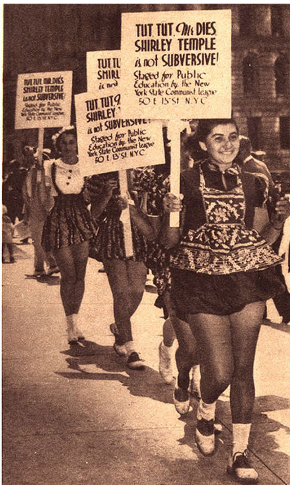
COMMUNIST cuties carry signs which ridicule a Congressional Committee's blunder. The Reds' new "publicity" methods overrule old-time displays of violence.