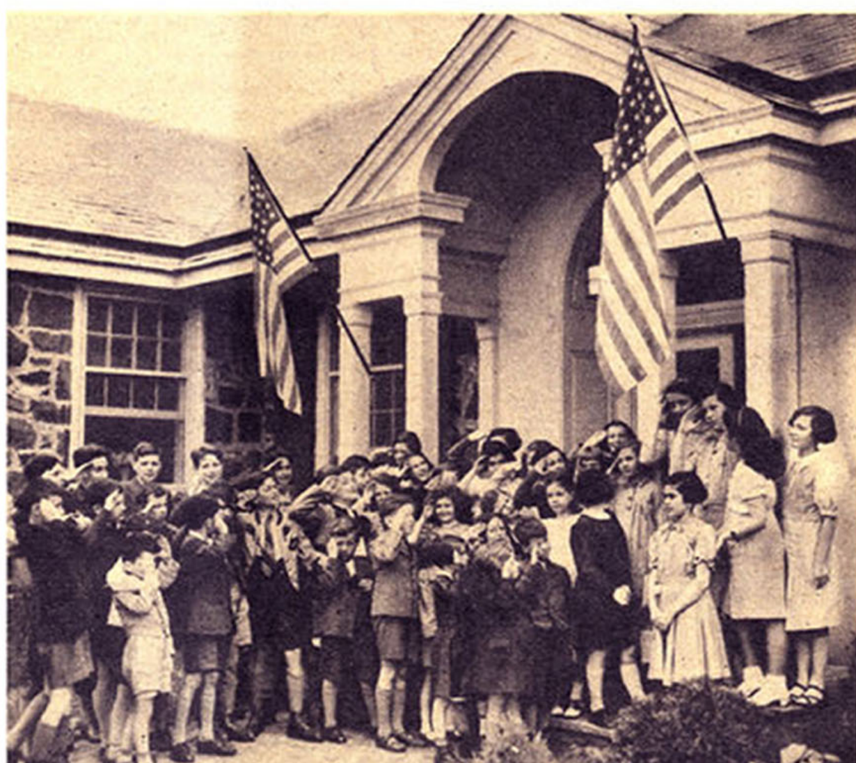
FIFTY Viennese children are among the many welcomed to U. S. Democratic humanitarianism must be protected from the machinations of the liberty-killing Communists hacking at our structure.