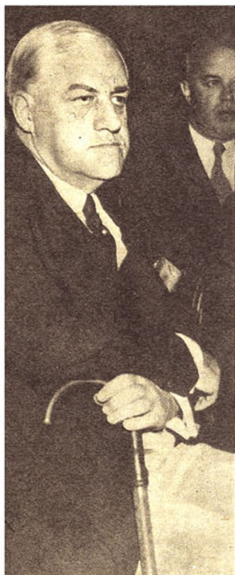
A "RED-HUNT" by Atty.-Gen. A. Mitchell Palmer in 1919 squelched the party until 1923.

C OMMUNISM is the greatest menace to the domestic peace of the United States today. For three reasons: The virus of its democracy-wrecking disease is not easily recognized by laymen who often mistake it for liberalism. The American Communist Party is so potently organized and politically powerful that it exerts an influence which out-proportions its actual numbers. A foothold already has been gained in colleges, labor, relief and even hospitals. This is a result of the new "Trojan-horse" policy adopted in Moscow, 1935. The expressed purpose was to penetrate—within democracies—"every organization which might put Communists in places of influence." Greatest success of such "penetration" to date is with the Workers' Alliance, organization of the unemployed and WPA workers. Prominent among the Reds who dictate their policies is Secretary-Treasurer Herbert Benjamin, admittedly a Communist for 18 years. With such leadership the Alliance remains a government-supported organization alien to democratic principles . . . a club to batter not only the government that feeds it, but the already over-burdened taxpayers who pay for the food.