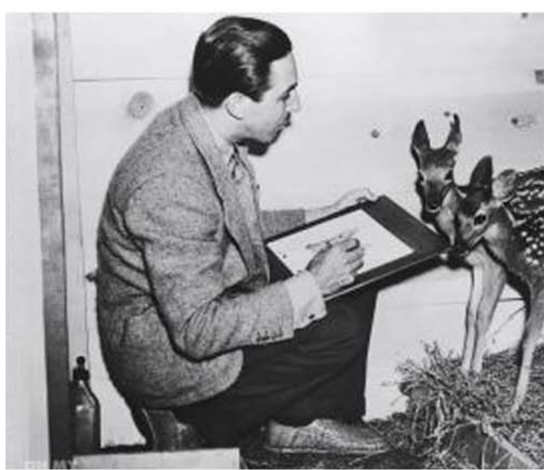
Walt Disney sketching