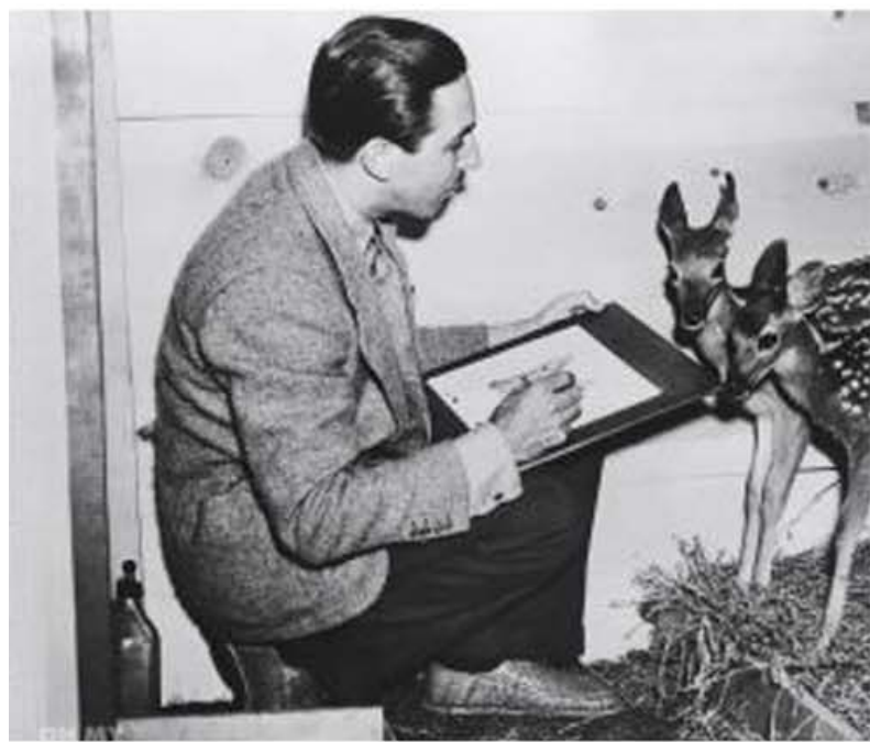
Walt Disney sketching