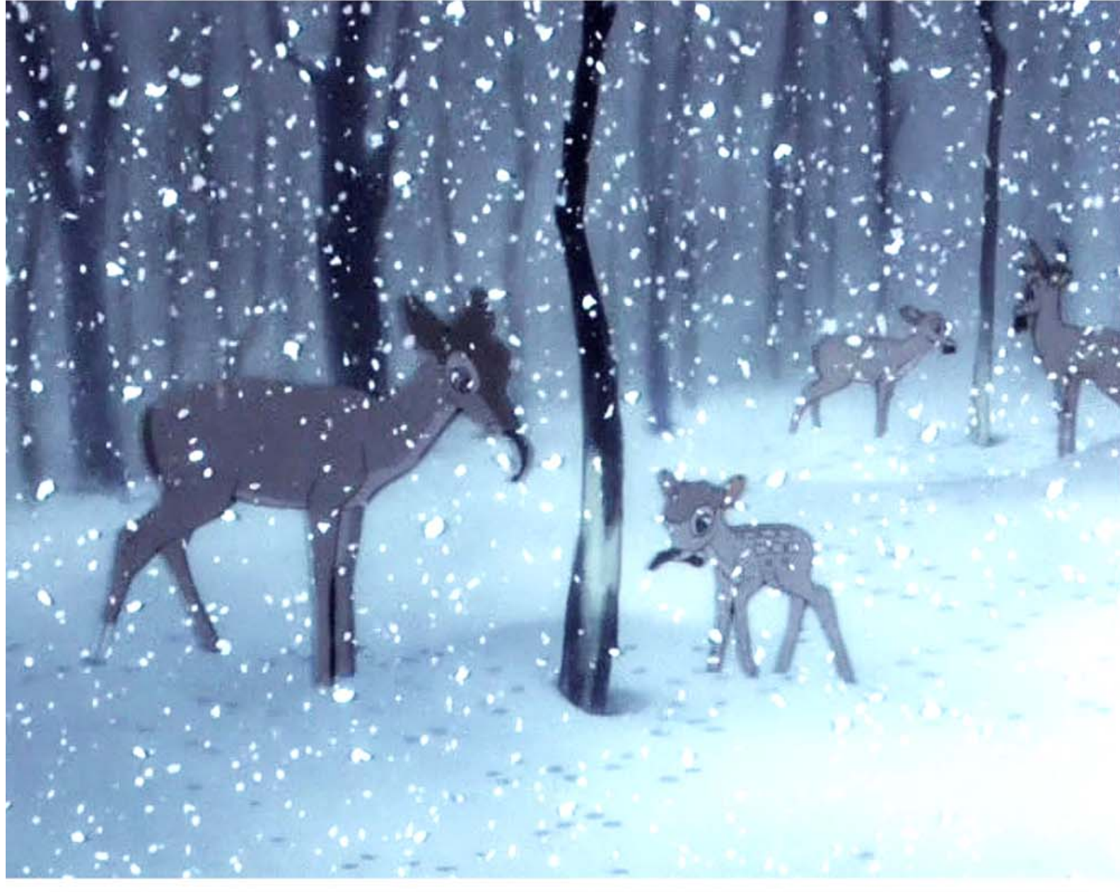
Hungry Bambi watches his mother pull the bark off a tree. You can be sure every corrugation in the bark is authentic. Jake Day saw to that

ney that this and no other was the Bambi country. Here were the pools and glades and ferns and flowers and blowdowns and mountain chimneys that would make the only likely neighborhood for Bambi's life and adventures.