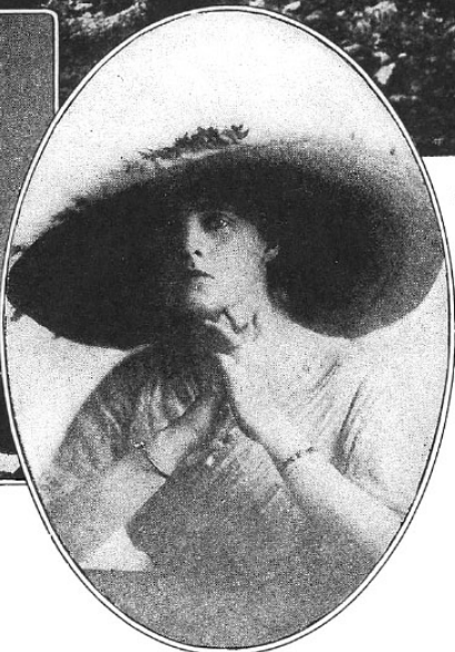
Princess Elizabeth of Roumania