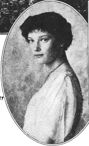
Grand Duchess Tatiana, daughter of the Czar of Russia