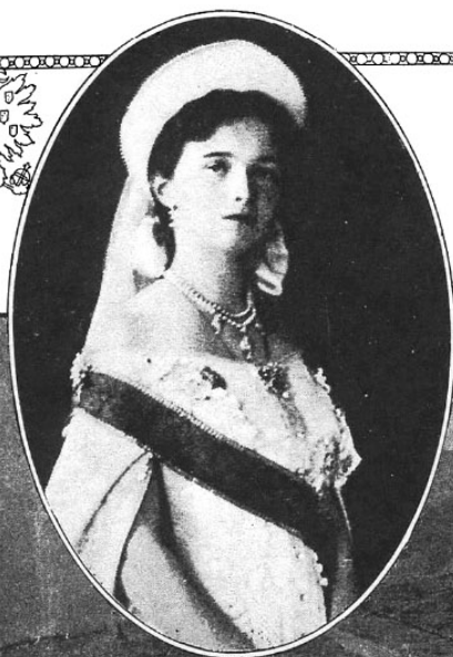
Grand Duchess Olga, daughter of the Czar of Russia