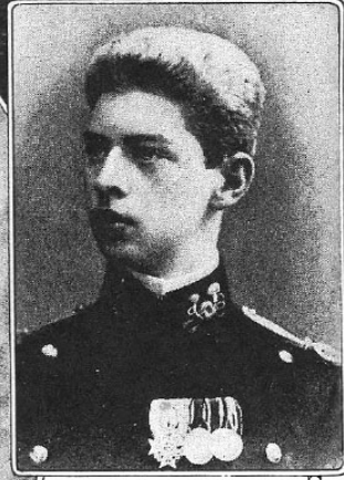
Crown Prince Charles of Roumania

I T HAS been announced in diplomatic circles, that a future alliance of the Balkan peoples, who have been at war for the past year and at odds for many years in the past, is to be cemented by the marriages of Crown Prince George of Greece to the Princess Elizabeth of Roumania; and of the Crown Princes of Serbia and Roumania to Olga and Tatiana, the daughters of the Czar. These inter-marriages, it is hoped, will help end the bitterness between the nations. The Karageorgevitch family of Serbia is not related to big European royalties, but it is looking for a rise in the world. Montenegro got one when Helenea married Victor Emanuel of Italy. Her sisters and cousins will not envy the Russian Grand Duchess who is assigned to Belgrade.