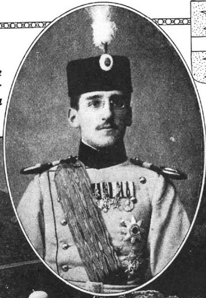
Crown Prince Alexander of Serbia