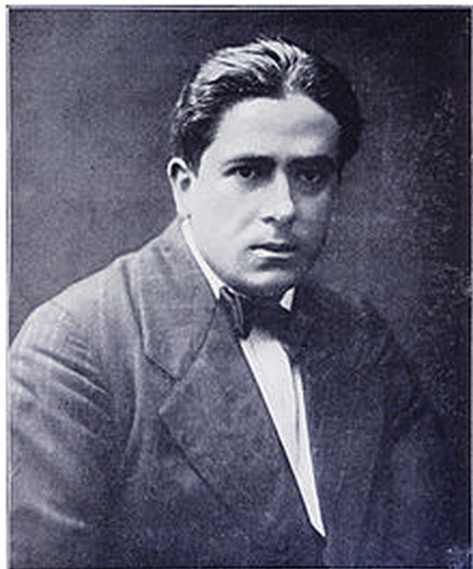
Francis Picabia (image added)

An example of the "cubist" art which may be found not so difficult of elucidation as most.