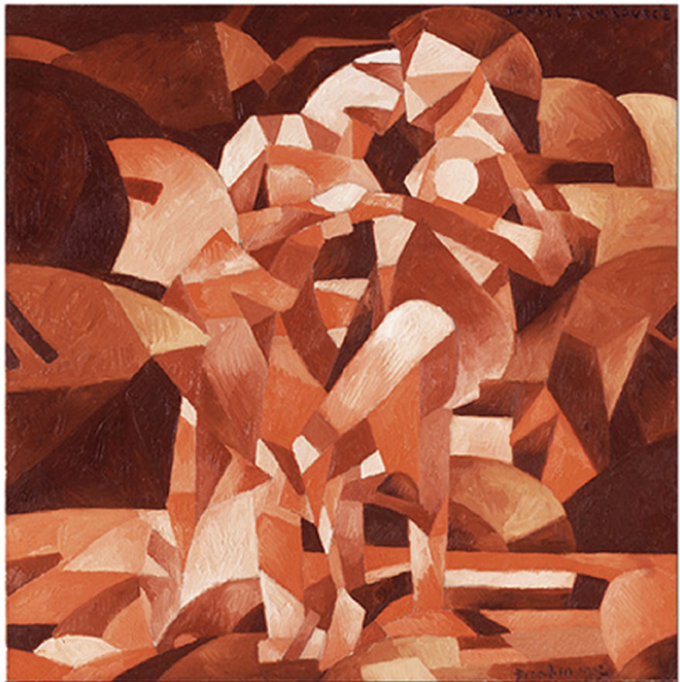
THE DANCE AT THE SPRING. From the painting by Francis Picabia.

"The opening night of the International Exhibition seemed to me one of the most exciting adventures I have experienced, and this sense of excitement was shared by almost every one who was present. It was not merely the stimulus of color, or the rise of sensuous appeal, or the elation that is born of a successful venture, or the feeling that one had shared, however humbly, in an historical occasion. For my own part, and I can only speak for myself, what moved me so strongly was this: I felt for the first time that art was recapturing its own essential madness at last, and that the modern painter and sculptor had won for himself a title