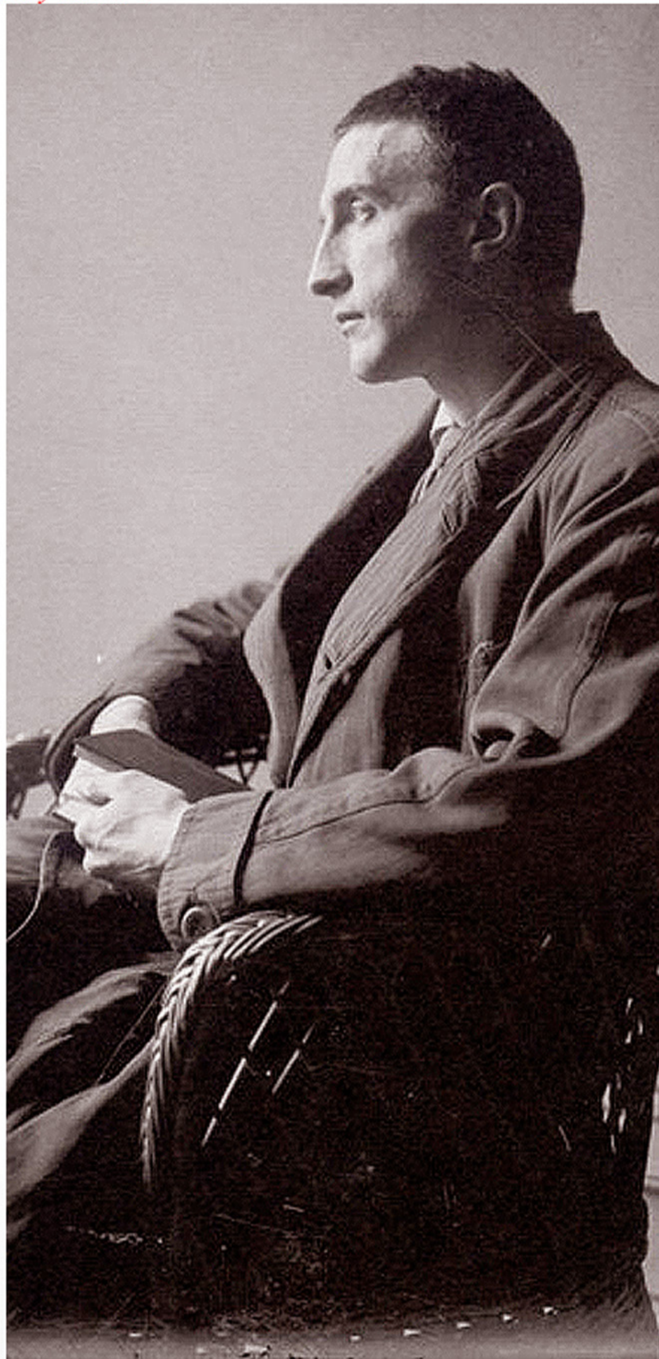
Marcel Du Champ, 1917 (image added)

"For these artists are endeavoring to give us a pictorial representation of the physical reaction to sense stimuli, the cellular and nervous reactions which carry the messages of sense perception to the brain. They attempt to diagram the shiver which indicates to you that you are cold; the nerve shock and accelerated heart action which mean fear. Do not mistake: they do not picture cold and fear, but they diagram the physical sensation which accompanies the mental recognition of cold and fear.