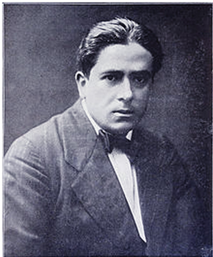
Francis Picabia (image added)

An example of the "cubist" art which may be found not so difficult of elucidation as most.