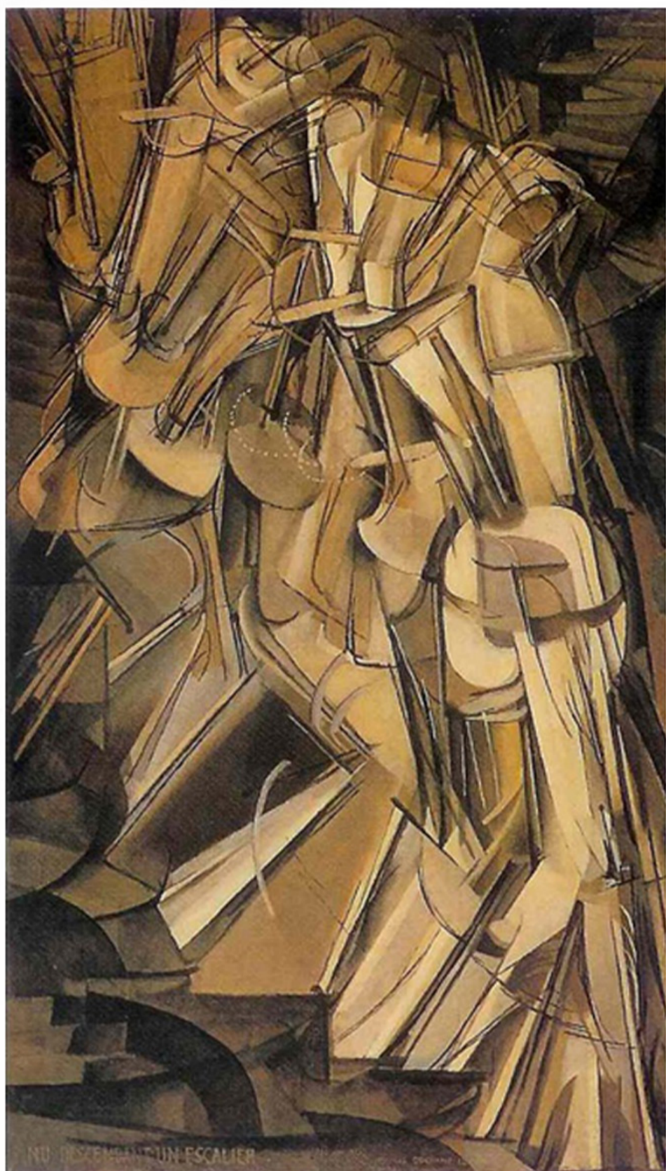
THE SENSATION OF THE SHOW.

Crowds daily stood before this picture by Marcel Duchamp called "The Nude Descending a Staircase" trying to make out the figure or the staircase or, by good luck, both.