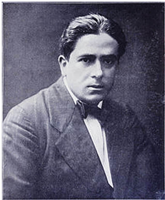
Francis Picabia (image added)

An example of the "cubist" art which may be found not so difficult of elucidation as most.