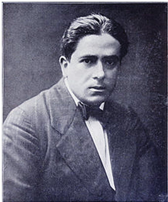
Francis Picabia (image added)

An example of the "cubist" art which may be found not so difficult of elucidation as most.