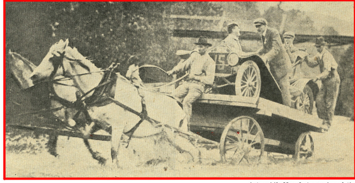
Automobile Manufacturers Association

One community proposed an ordinance to require the motorist approaching a turn to toot a horn, ring a bell, fire a gun and send up three bombs as a signal to any who might be around the bend. Another decreed that if a horse refused to pass an automobile, the operator must "take the machine apart as rapidly as possible and conceal the parts in the grass." Some places barred motorists altogether; others so hemmed him with restrictions as to immobilize him.