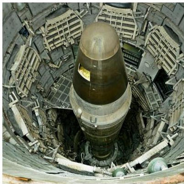
A Titan Missile Silo.

But the ICBM's first rocket engines are likely to be powered with liquid