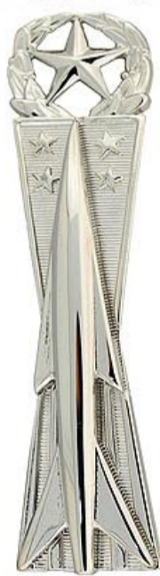
USAF Master Missile Maintenance Badge

The “guidance” of the ICBM simply endeavors to put the warhead on a proper course at a proper speed at a fixed predetermined point in space. This is done primarily in two ways. The course and speed required to reach a fixed and known target are precalculated (as they are prior to the firing of an artillery shell), the amount of