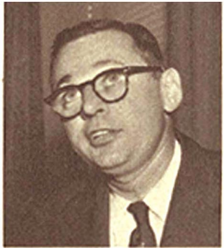
Left: Maj. Gen. Bernard A. Schriever heads the AF ballistic missile program. Right: Trevor Gardner, dissatisfied with Pentagon policy on ICBM, resigned as Assistant Air Secretary

The ICBM as now envisaged, therefore, is subject in free flight to the whims and vagaries of nature. And some of these are irregular and variable—one reason why the ICBM will never be a "bomb-in-a-pickle-barrel" weapon, but essentially a weapon of limited accuracy for area bombardment.