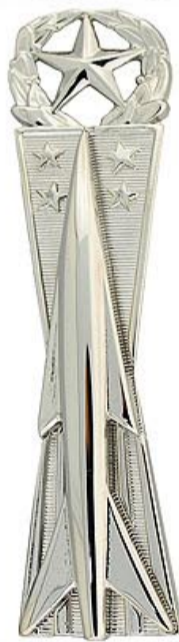
USAF Master Missile Maintenance Badge

The “guidance” of the ICBM simply endeavors to put the warhead on a proper course at a proper speed at a fixed predetermined point in space. This is done primarily in two ways. The course and speed required to reach a fixed and known target are precalculated (as they are prior to the firing of an artillery shell), the amount of