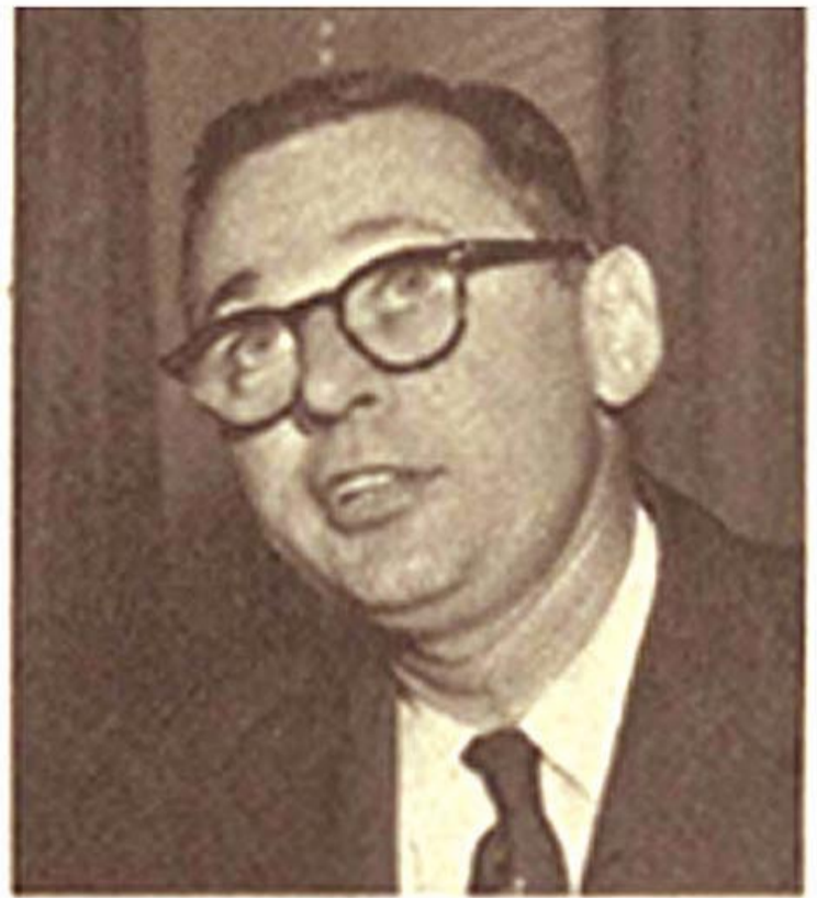
Left: Maj. Gen. Bernard A. Schriever heads the AF ballistic missile program. Right: Trevor Gardner, dissatisfied with Pentagon policy on ICBM, resigned as Assistant Air Secretary

The ICBM as now envisaged, therefore, is subject in free flight to the whims and vagaries of nature. And some of these are irregular and variable—one reason why the ICBM will never be a "bomb-in-a-pickle-barrel" weapon, but essentially a weapon of limited accuracy for area bombardment.