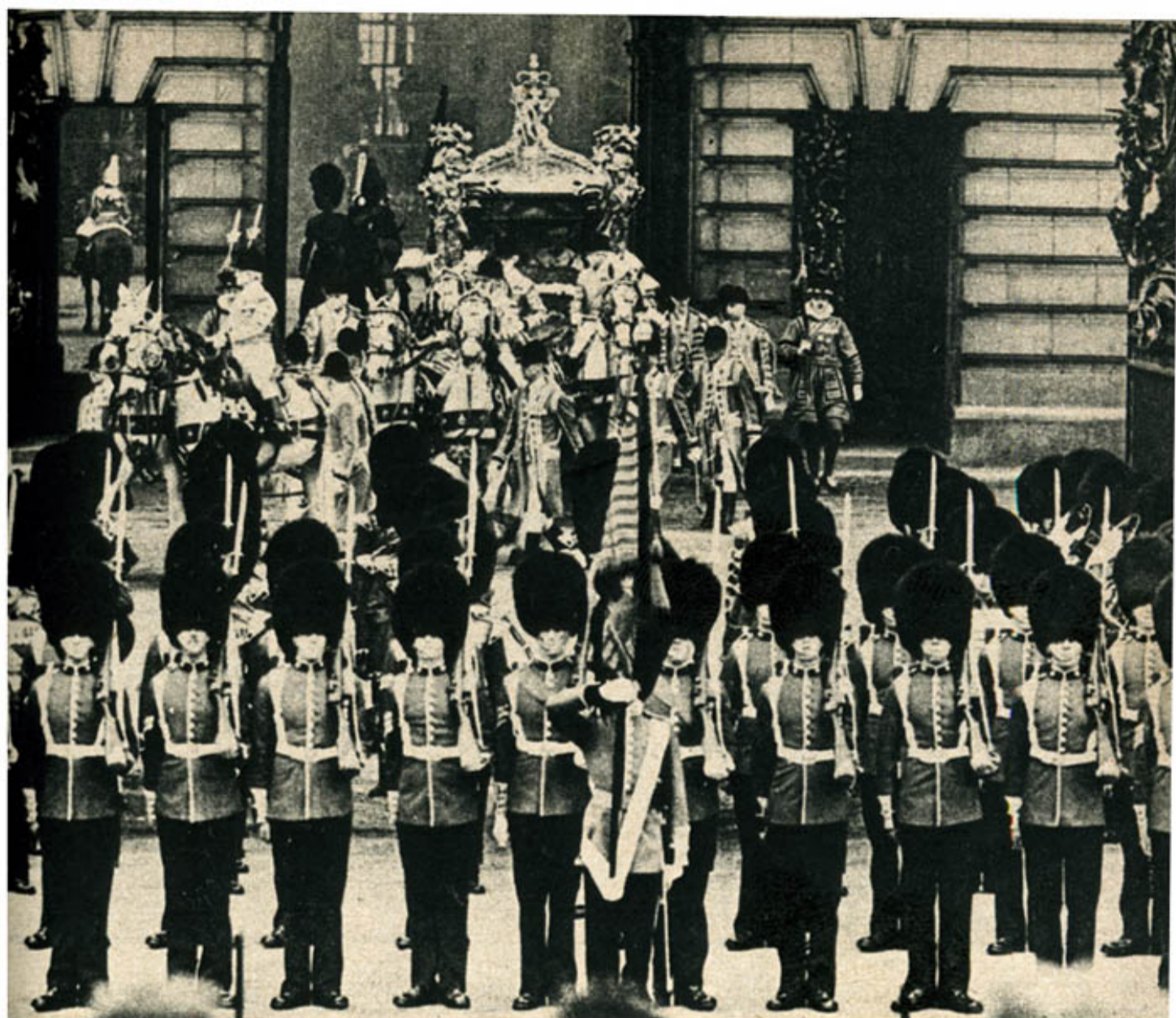
Act I: State Coach with Elizabeth and Philip leaves palace on way to Westminster Abbey

Act II: The altar of Westminster, with everything in readiness for the Coronation. Westminster has been the scene of every Coronation since that of William the Conqueror in 1066. The Coronation Chair (right) has been used since year 1297