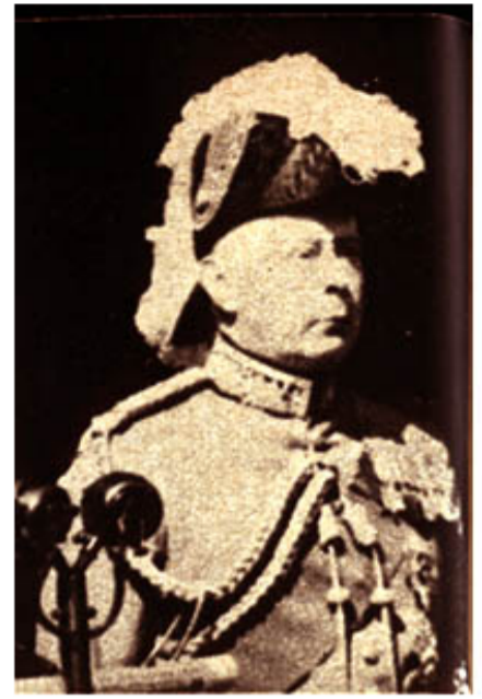
Duke of Norfolk