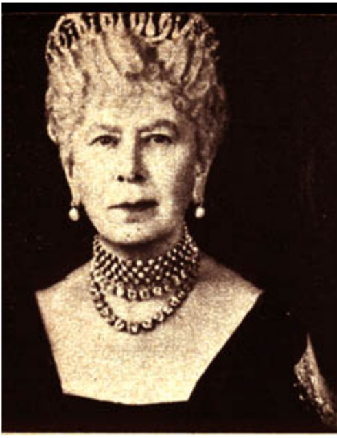
The late Queen Mary