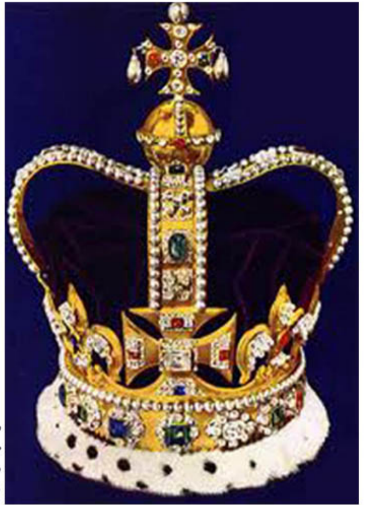
The Crown of St. Edward the Confessor, first crown placed on the Queen's head. It is quickly removed (weighs 7 pounds), replaced by 39-ounce Imperial Crown

Three of the crown jewels. Holy oil is poured from the beak of the golden eagle into the anointing spoon (below). The Monarch is anointed with this spoon. The royal sceptre (far right) contains the Great Star of Africa, the world's largest diamond