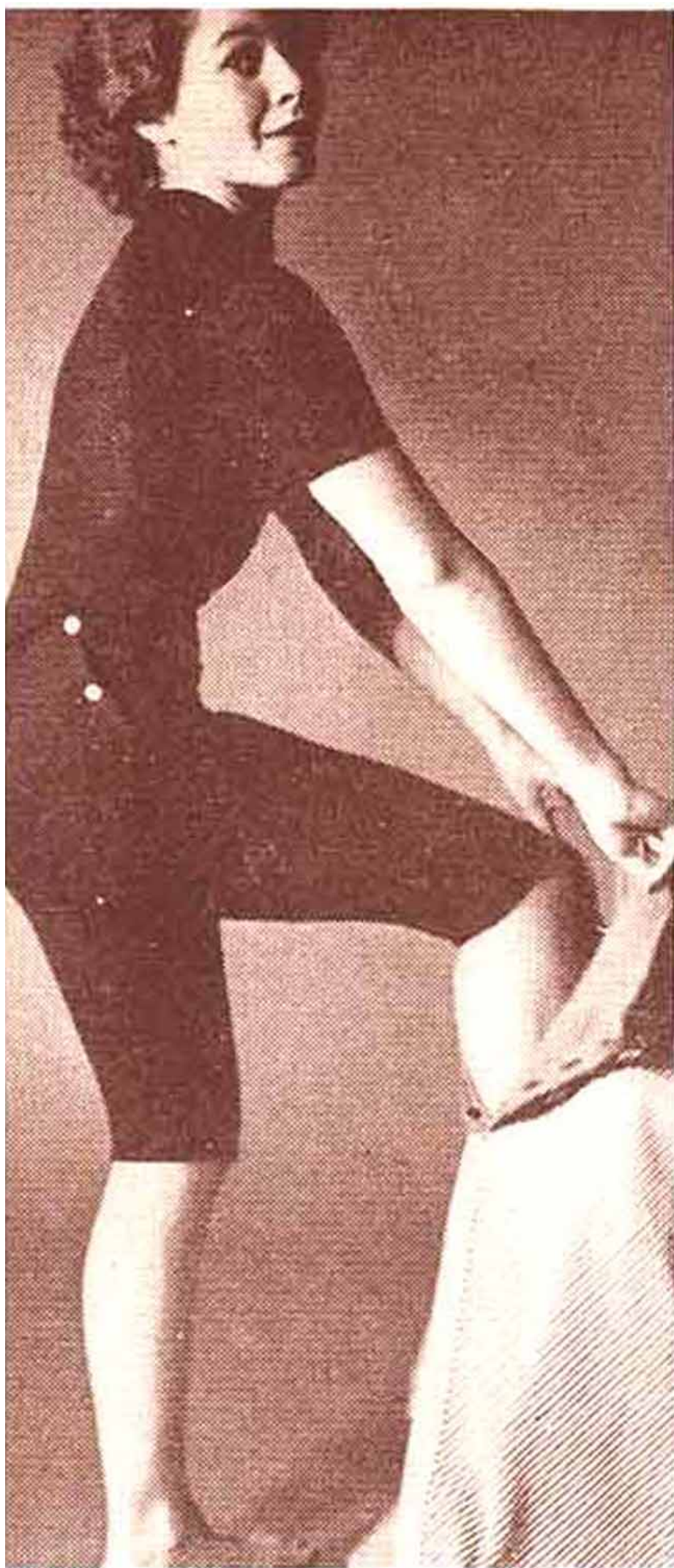
Rhinestone-buttoned leotard (Masket)