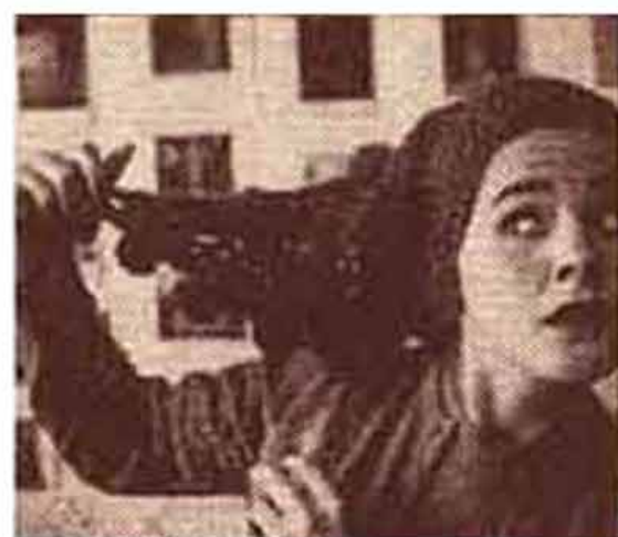
Corsican cap (Madcaps)