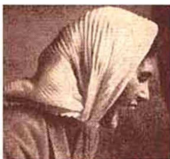
Head scarf (Symphony),