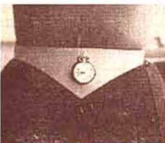
Watch belt (Frank Speyer),