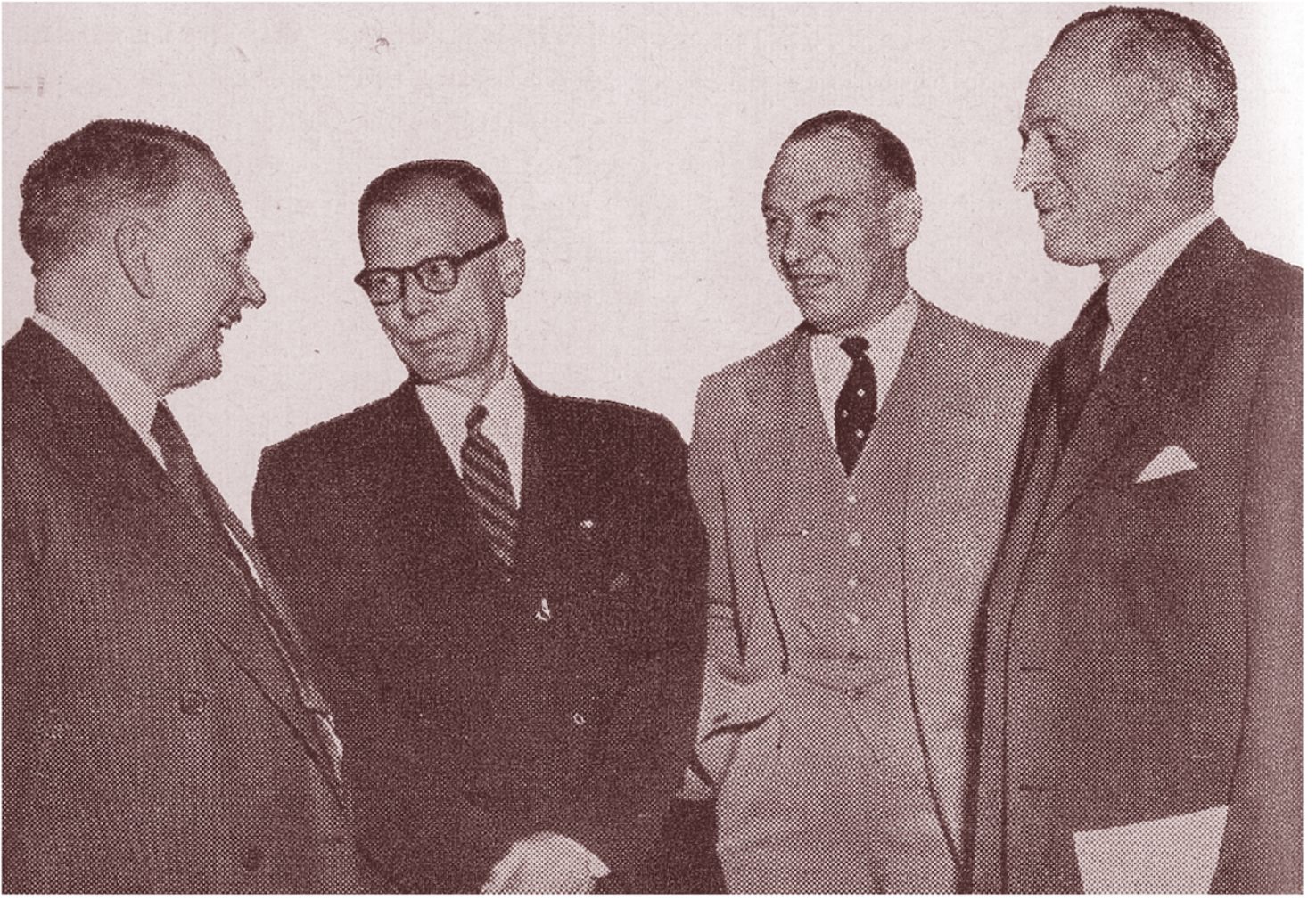
CIA's Gen. Smith (2nd from l., on Capitol Hill): For U.S. Intelligence, no Hollywood heroism, no rich blockheads, but bright young men who'll work.

Repeated intelligence failures (from Pearl Harbor to Red China's offensive in Korea) jolted Washington into awareness that a sound intelligence system can't grow on a catch-as-catch-can basis. Result: A training program looking 20 years ahead, to staff CIA (Central Intelligence Agency) with dedicated espionage experts