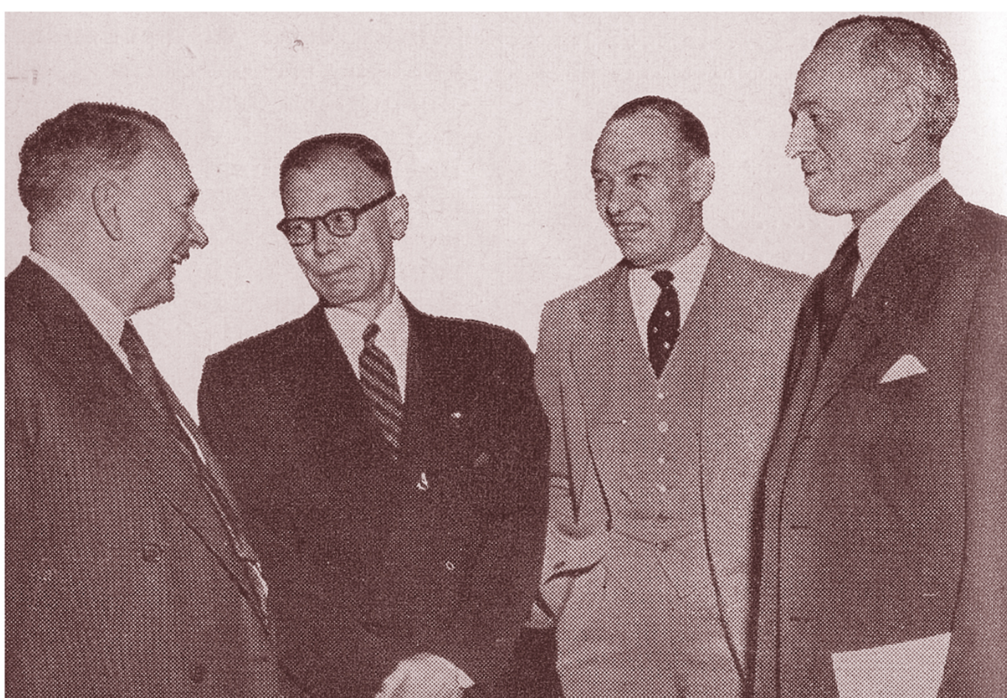
CIA's Gen. Smith (2nd from l., on Capitol Hill): For U.S. Intelligence, no Hollywood heroism, no rich blockheads, but bright young men who'll work.

Repeated intelligence failures (from Pearl Harbor to Red China's offensive in Korea) jolted Washington into awareness that a sound intelligence system can't grow on a catch-as-catch-can basis. Result: A training program looking 20 years ahead, to staff CIA (Central Intelligence Agency) with dedicated espionage experts