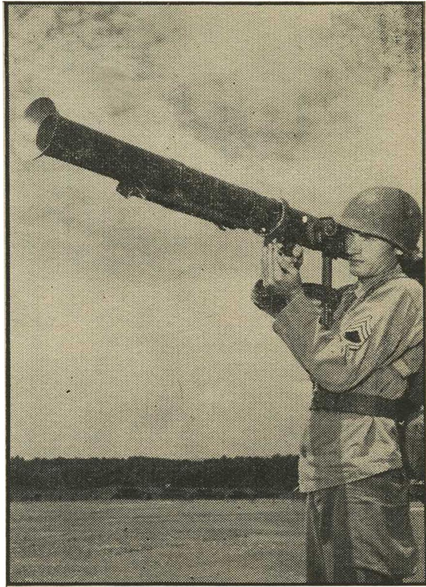
Tank-buster. A five-year-old weapon takes slow trip to Korea.