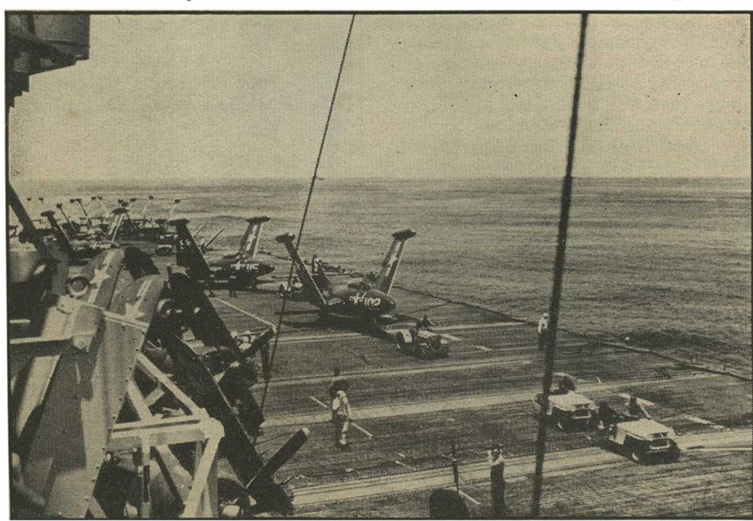
Big flattop. Secretary Johnson called aircraft dead dodos.

This does not mean that the U.S. must match Russia man for man, gun for gun or tank for tank. But it does mean we cannot coast along on the false security of supposed superiority in atom bombs. The U.S. now needs, according to the JCS, an army of at least 2.6 million men, sufficiently elastic in command, weapons