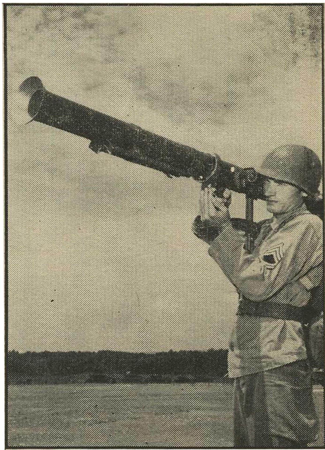
Tank-buster. A five-year-old weapon takes slow trip to Korea.