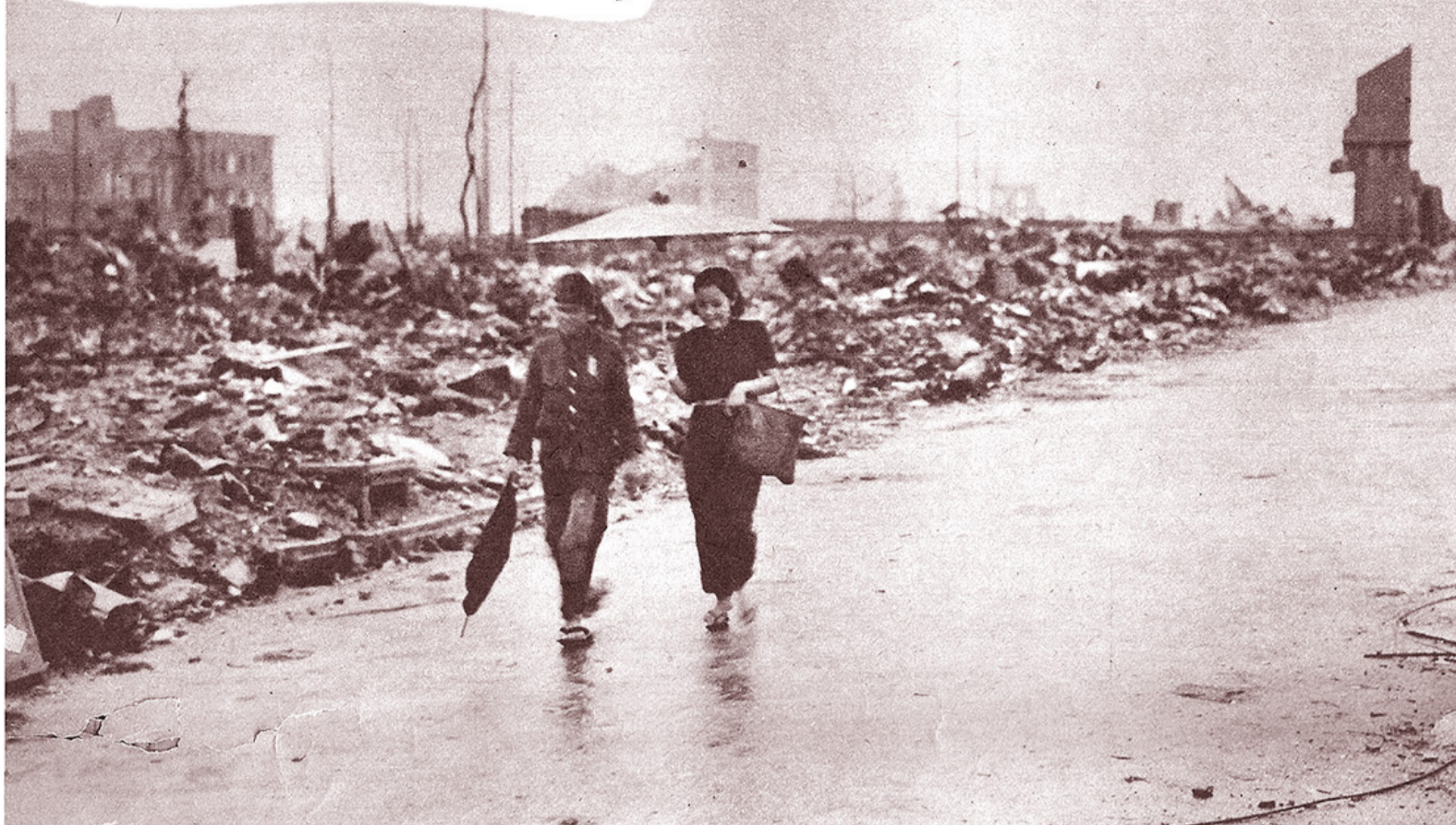
Two Japanese civilians walk on a road cleared through the dead ruins of Hiroshima. For four square miles the city was left in total destruction by the atomic bomb.

H IROSHIMA—In the bombed-out cities of Europe there were always plenty of eyewitnesses who were only too eager to tell you exactly how it was the day their house fell in. It wasn't like that in Hiroshima when I came here with the first group of Americans to enter the city since it was almost completely destroyed by our atomic bomb on Aug. 6. For the first two hours, as we walked through the utterly demolished downtown section, we couldn't find a single Jap on the streets who had been here when the bomb landed. Practically all eyewitnesses seemed to be dead or in the hospital.