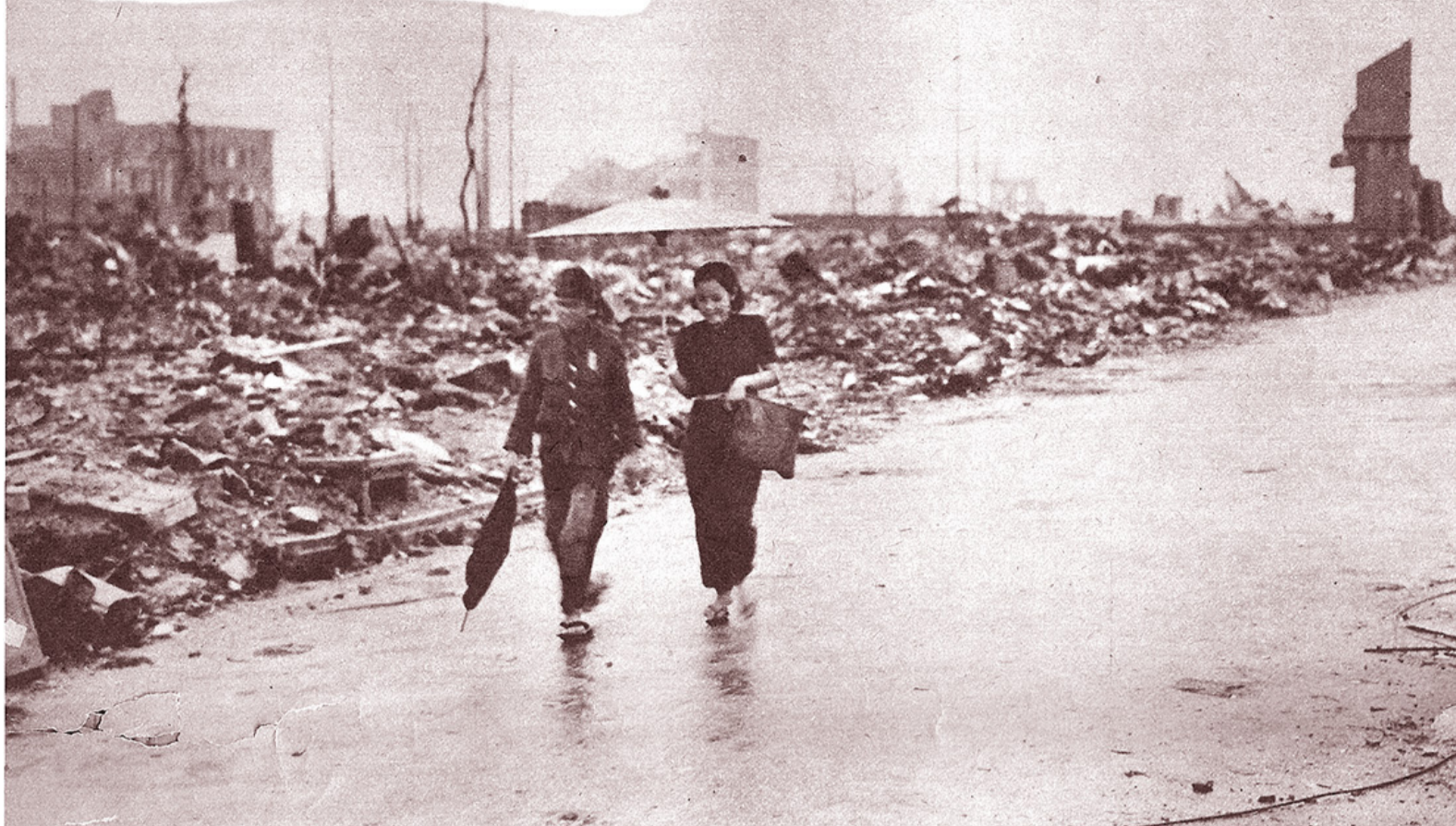
Two Japanese civilians walk on a road cleared through the dead ruins of Hiroshima. For four square miles the city was left in total destruction by the atomic bomb.

H IROSHIMA—In the bombed-out cities of Europe there were always plenty of eyewitnesses who were only too eager to tell you exactly how it was the day their house fell in. It wasn't like that in Hiroshima when I came here with the first group of Americans to enter the city since it was almost completely destroyed by our atomic bomb on Aug. 6. For the first two hours, as we walked through the utterly demolished downtown section, we couldn't find a single Jap on the streets who had been here when the bomb landed. Practically all eyewitnesses seemed to be dead or in the hospital.