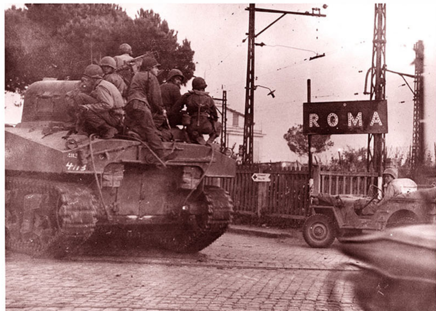
Tanks and jeeps carried the newest conquerors into the City of the Caesars

The capture of the Eternal City—first Axis capital to fall to the Allies—came on the 275th day of the Italian invasion and realized the political and psychological objective of the entire campaign. Yet for the Allied Armies the fall of Rome was rather the beginning than the end of the job. Paced by the air forces, without a pause the troops rolled on through the city and across the Tiber in a drive aimed at smashing completely the retreating German forces.