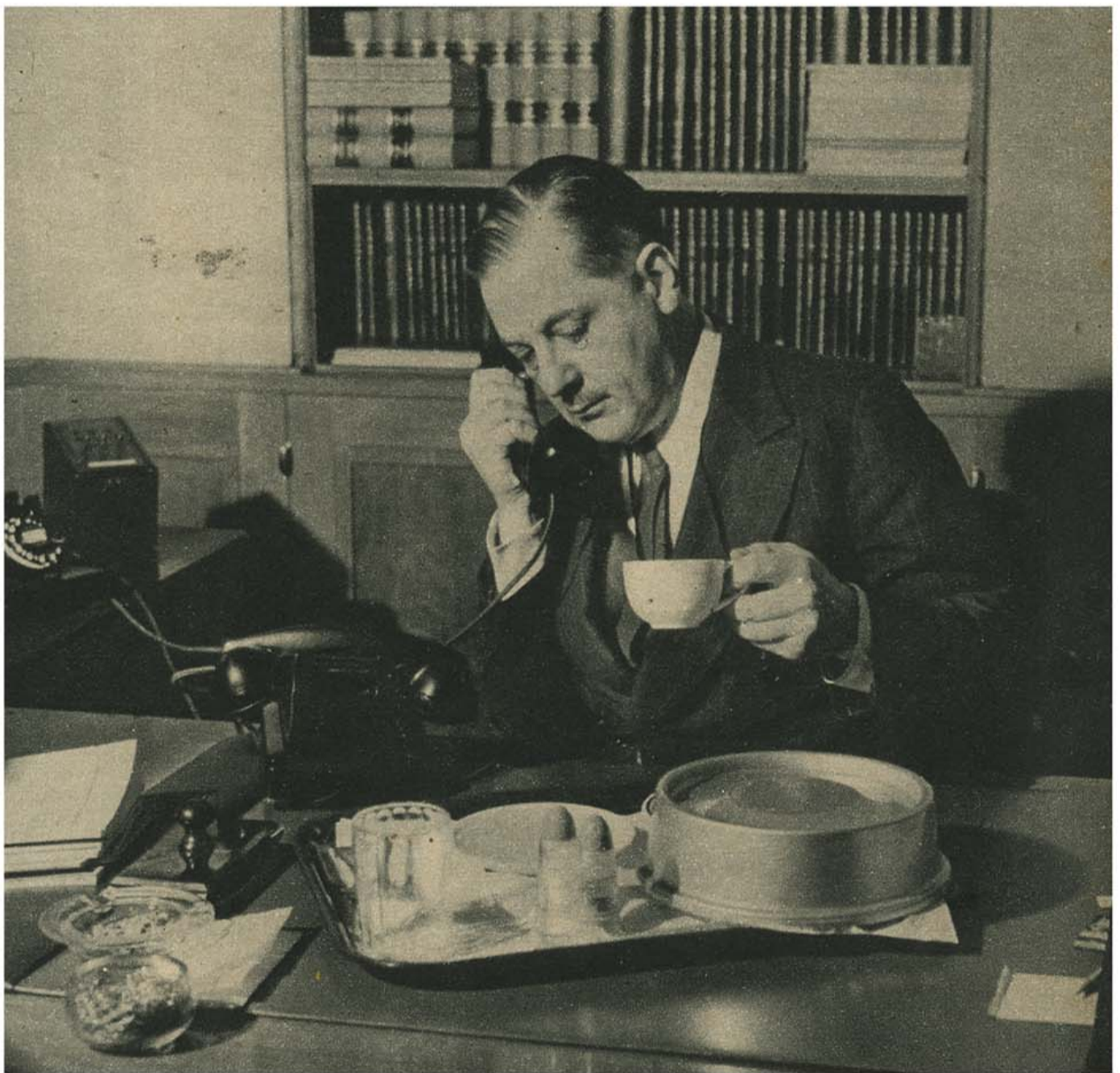
WHAT MAKES THURMAN ARNOLD REALLY BUSY is fighting not only this war but private wars of his own simultaneously. The Assistant Attorney General (below) has just started after loan sharks who take billions of dollars a year in interest rates of 30% to 240% a year. "People who borrow to pay income taxes must not be rooked," he says determinedly.