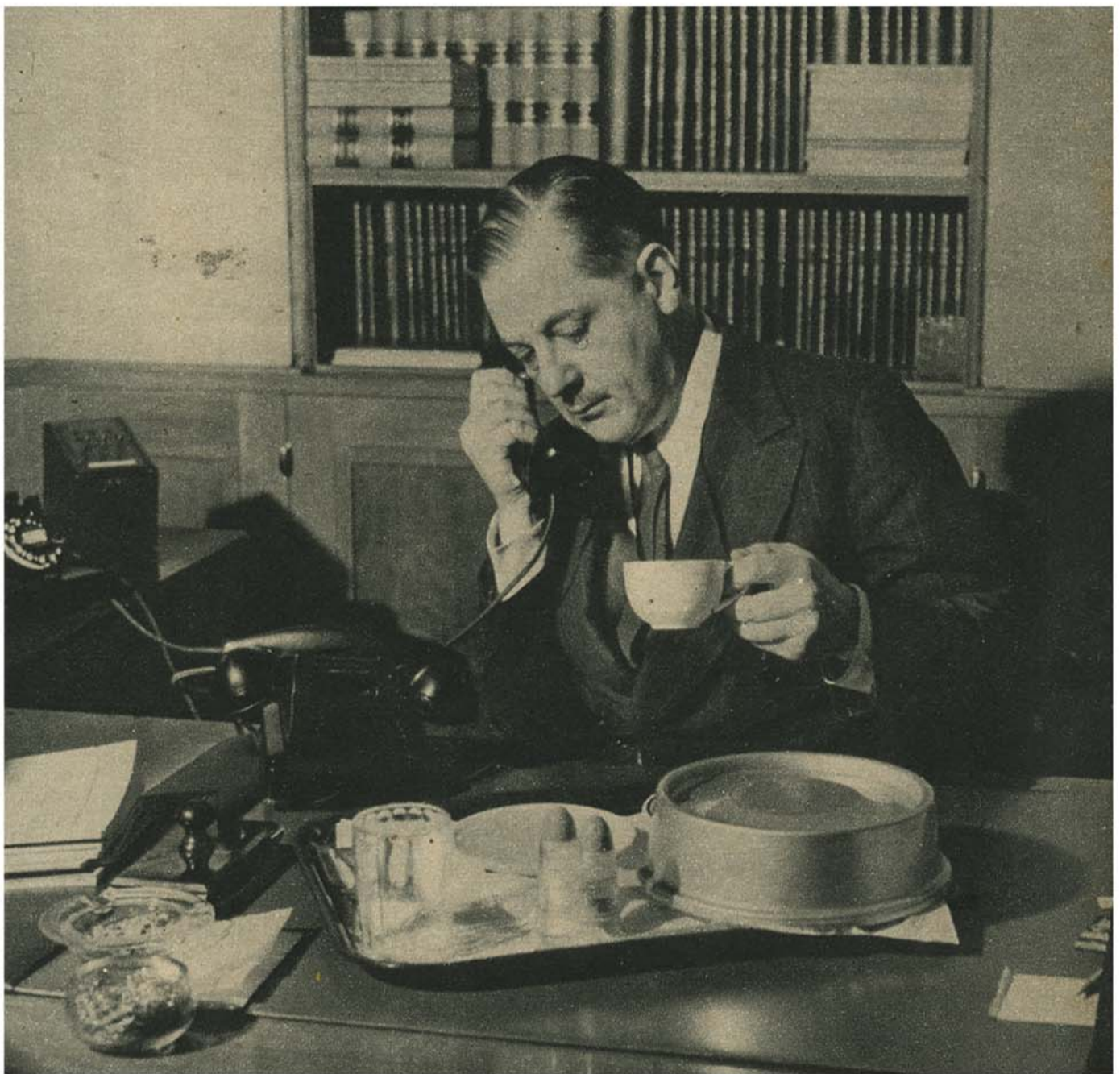
WHAT MAKES THURMAN ARNOLD REALLY BUSY is fighting not only this war but private wars of his own simultaneously. The Assistant Attorney General (below) has just started after loan sharks who take billions of dollars a year in interest rates of 30% to 240% a year. "People who borrow to pay income taxes must not be rooked," he says determinedly.