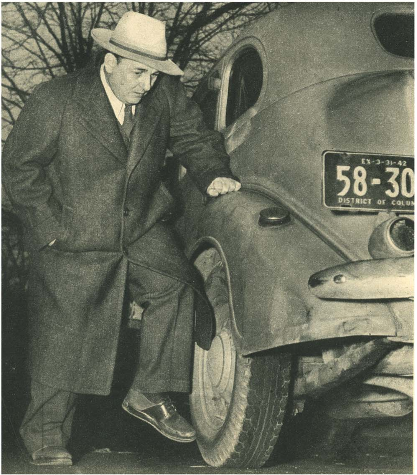
THE WITCH HUNTS OF THE LAST WAR , when restaurant keepers who called Liberty Cabbage by its teutonic name of sauerkraut were hounded by super-patriots, will not occur again if Attorney General Biddle (above) can prevent them. It is his job to ferret out and convict all genuine enemies. Leon Henderson (below) tests his tires to see if they can last the war.