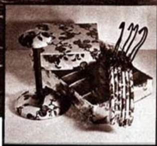
THE ORDER becomes easy randeur Product closet ries in the red apple print.