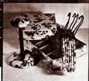
THE ORDER becomes easy randeur Product closet ries in the red apple print.