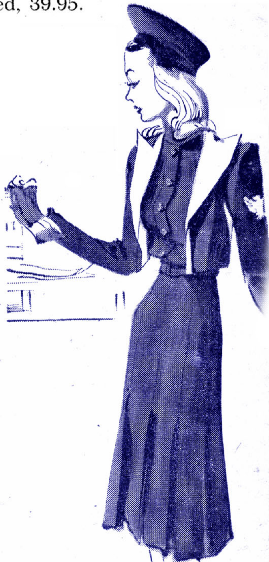
(D) Bloomingdale's, 16.95

In tune with the naval-military trend, as well as the developing fashion for capes, is an officer's cape advertised by Best's, of wool flannel with velvet collar and gold braid trim, for North or South, and "right" over suits or evening gowns. Lined in blue or red, 39.95.