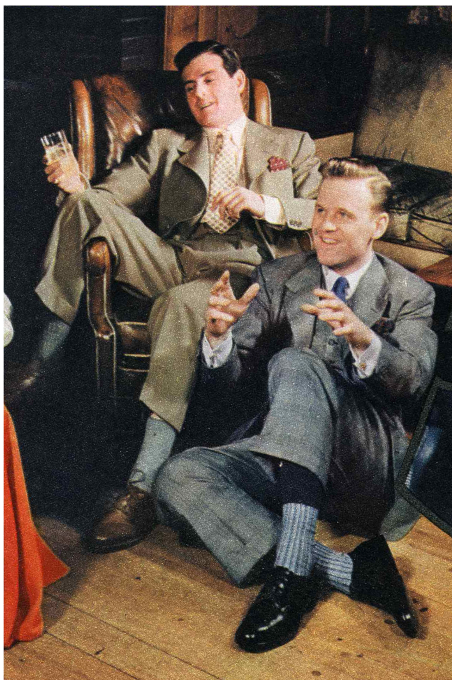
The young week-end loafer at the left has eased into a gabardine suit, an oxford shirt, a foulard tie and a drink on the house. The other guest is completely at ease in a Glen plaid.