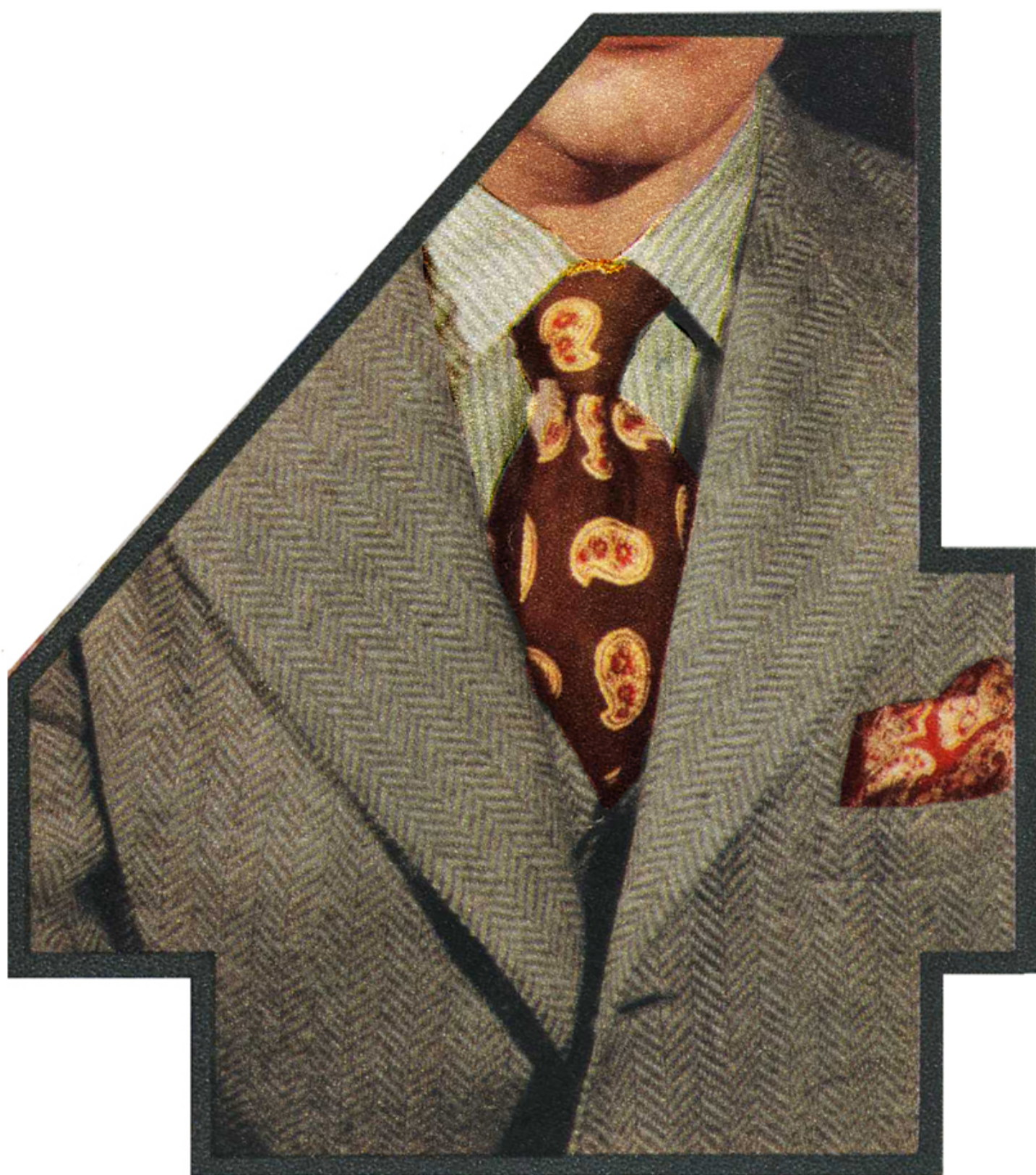
No. 4 sets against the natural-color Shefland herringbone suit a fan-and-white candy-striped oxford shirt, a brown, red and yellow India silk tie, complementary handkerchief