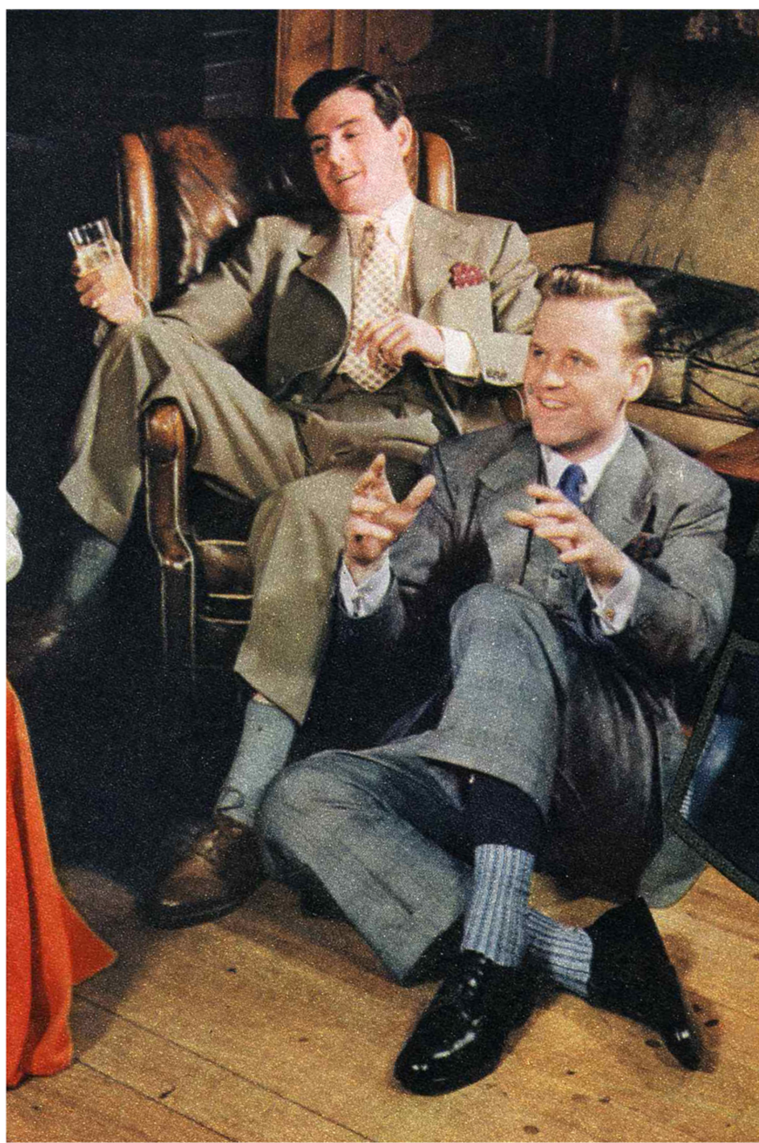
The young week-end loafer at the left has eased into a gabardine suit, an oxford shirt, a foulard tie and a drink on the house. The other guest is completely at ease in a Glen plaid.