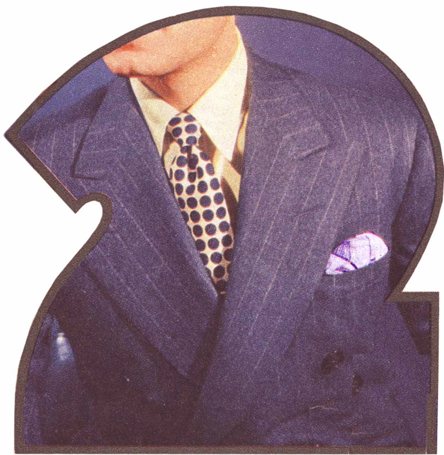
No. 2, pale yellow broadcloth shirt with navy-spotted, corn-color tie, blue-bordered handkerchief and gray-blue suit

For the cool of the evening, a covert topcoat will keep you comfortable in town or country, but be sure it's a loose, casual model—not form-fitting. And if the country air is a few degrees cooler than the city, blend a sweater into your ensemble.