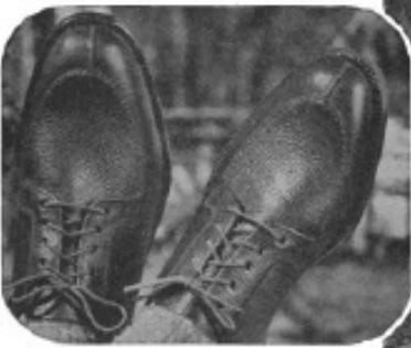
WHISTLE while you walk in Walk-Fitted Bostonians. Leathers give and take with foot action. Above, Stalwart in Scotch grain.

Now that you're back on your feet, Walk it and Like it in Bostonian Ruggediers. They cut up the miles, take every hill in high gear. Measure their rugged soles, thick but flexible! Careless the fine grain leathers! Splash through puddles, climb over rock fences—these husky Walk-Fitted Bostonians'll come up smiling. And comfortable? They'd make a postman craze walking. $8.95 to $12. Bostonian Shoes, Whitman, Mass.