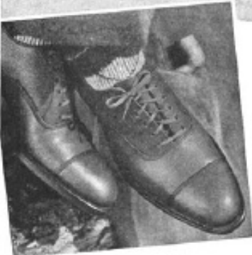
RUGGEDIER GRAINS —Bostonians' answer to winter walking. Heavy soles for men who won't jump puddles. Above, Tech.