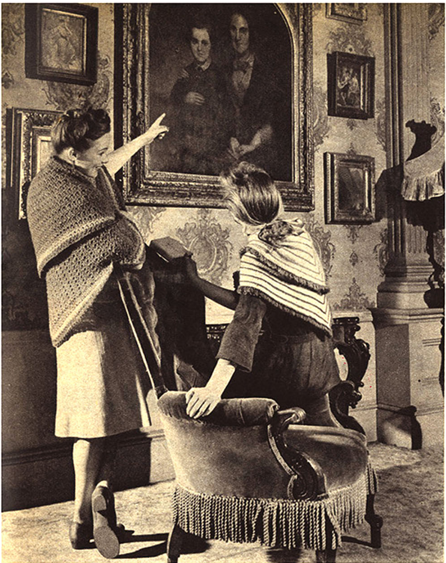
BIG AND SMALL SQUARES SHAPE INTO OLD-FASHIONED SHOULDER WARMERS