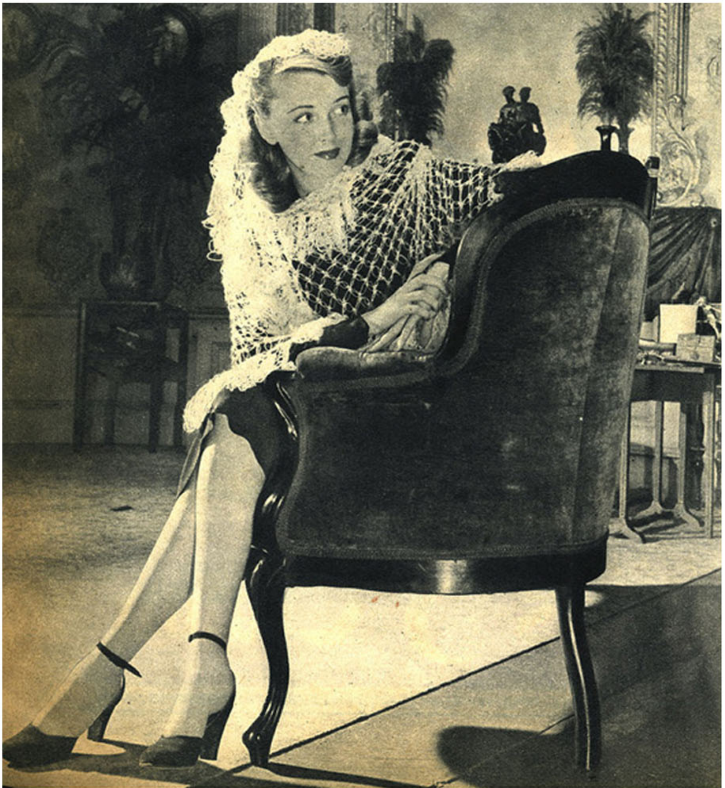
THIS WOOL FASCINATOR ADDS WARMTH WITHOUT WEIGHT