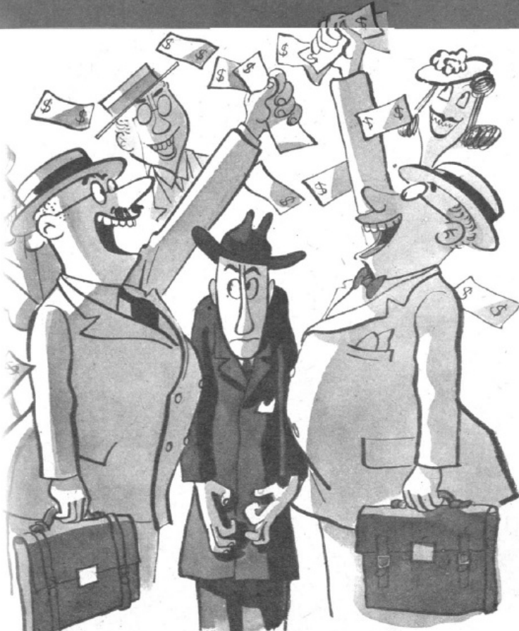
"How loudly everybody talks," said the Australian in a whisper. "Prosperity. Noise. Money. Everybody is obsessed with money."

The GIs from the U. S. have never been shy when it came to giving out with their opinions about people and customs in the foreign lands they've seen. Well, here's what some of the delegates at the San Francisco conference had to say about things in the U. S.