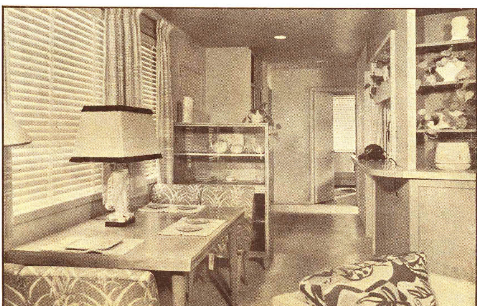
. . . offers gracious living space such as this dining-entry area.

For the past month, a snug little California ranch-type house has parked in downtown Washington, just north of Labor and east of Commerce. Against these staid Government buildings and the cold gravel lot, its green-stained cypress siding and sun-bright yellow trim have beamed a warm welcome to thousands of visitors.